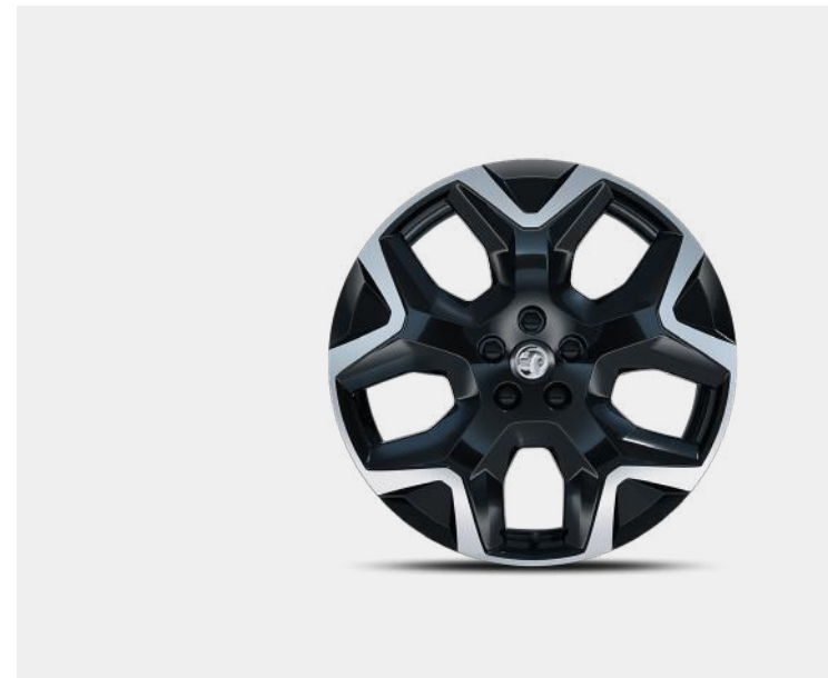
19-inch alloy wheel.