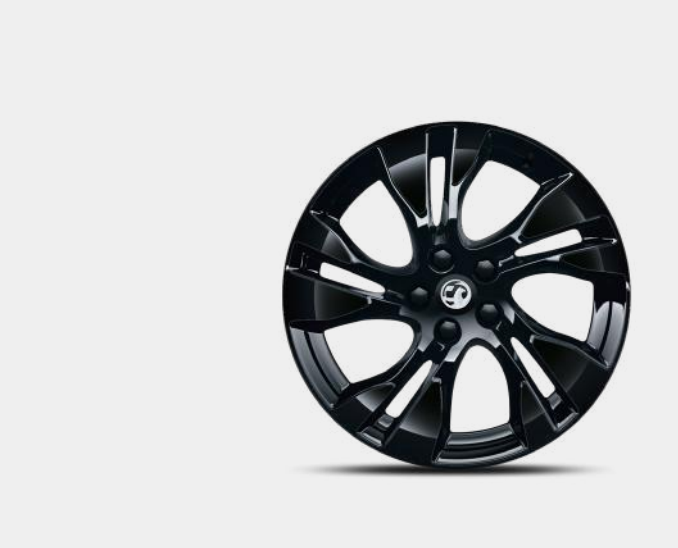
18-inch alloy wheel.