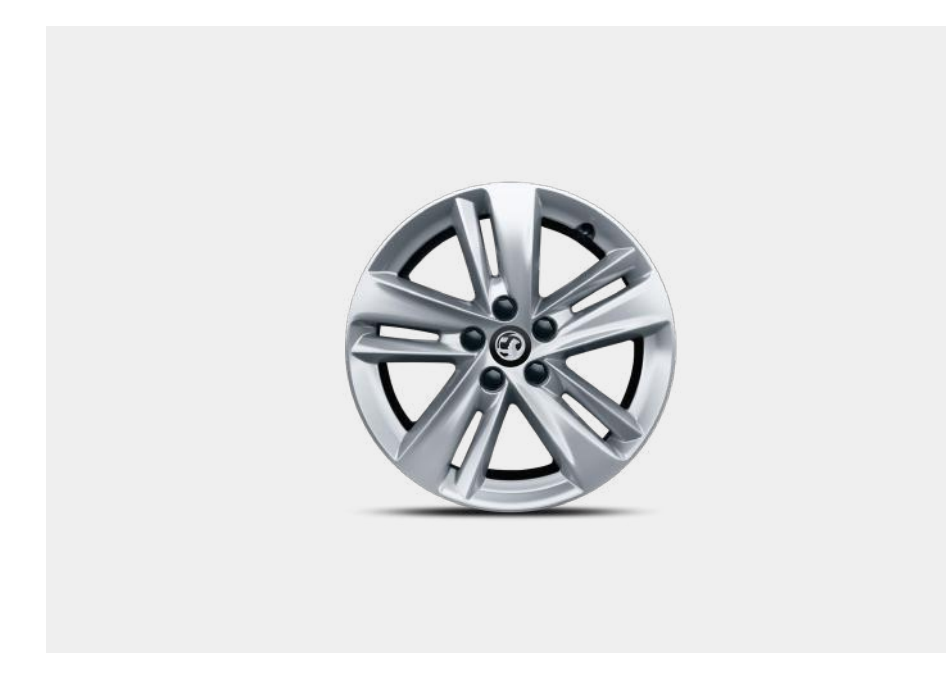
17-inch alloy wheel.