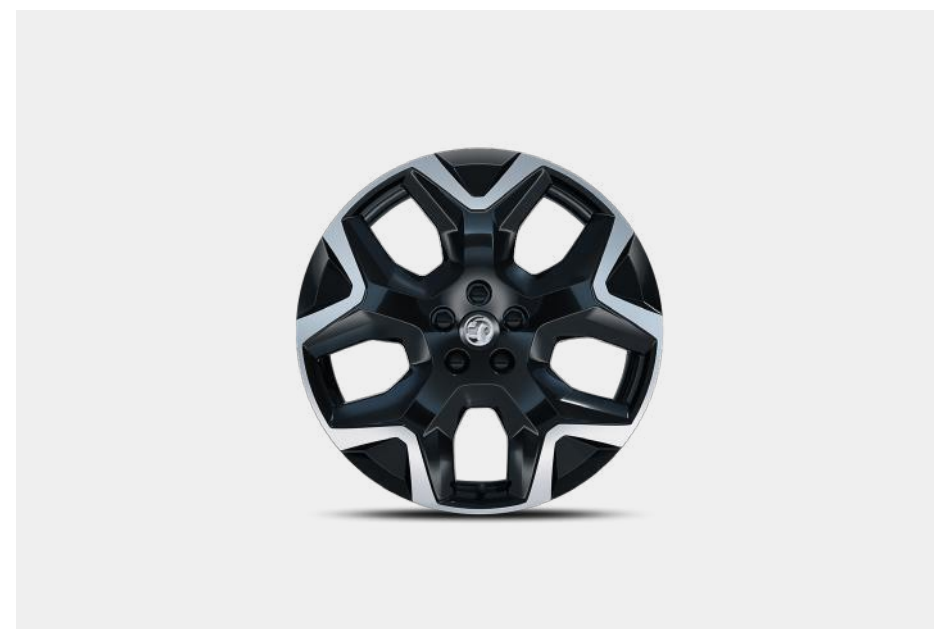
19-inch alloy wheel.