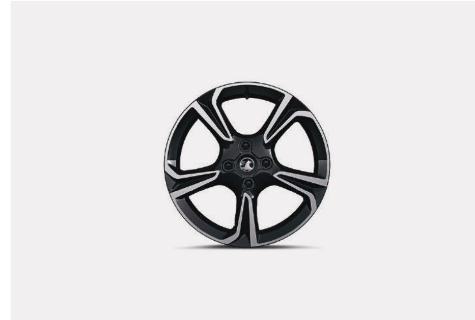
17-inch alloy wheel.