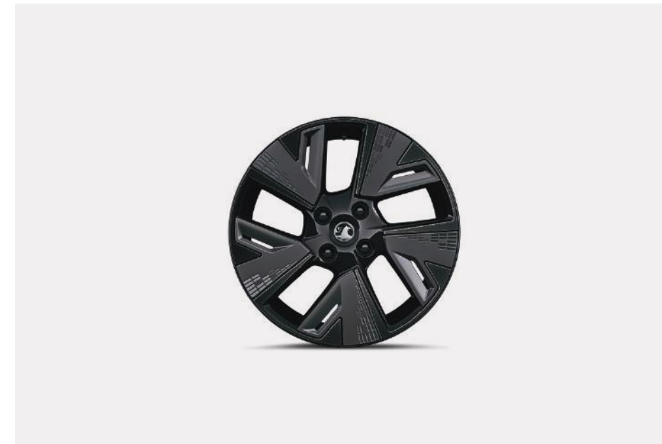
17-inch alloy wheel.