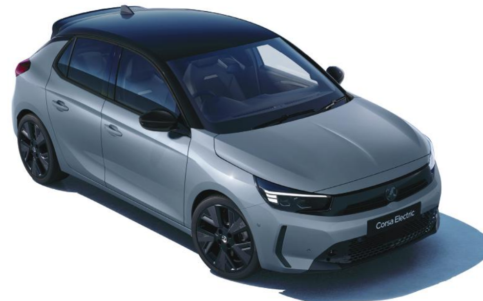
Graphic Grey (POSD)*** Two-coat premium metallic paint £700