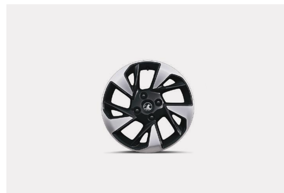
16-inch alloy wheel.