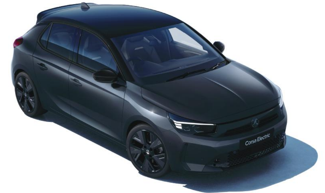
Carbon Black (M09V)*** Two-coat metallic paint £600