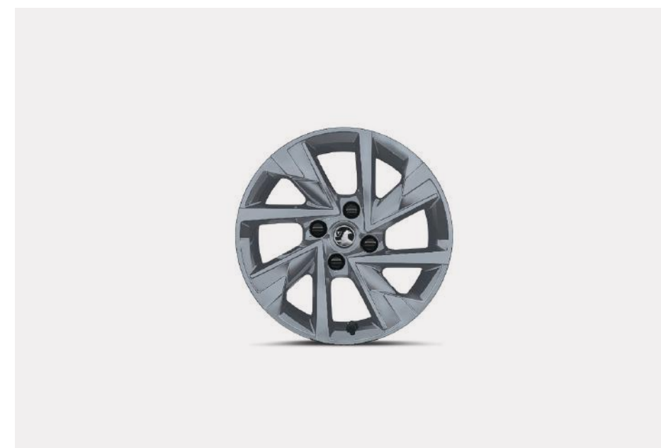
16-inch alloy wheel.