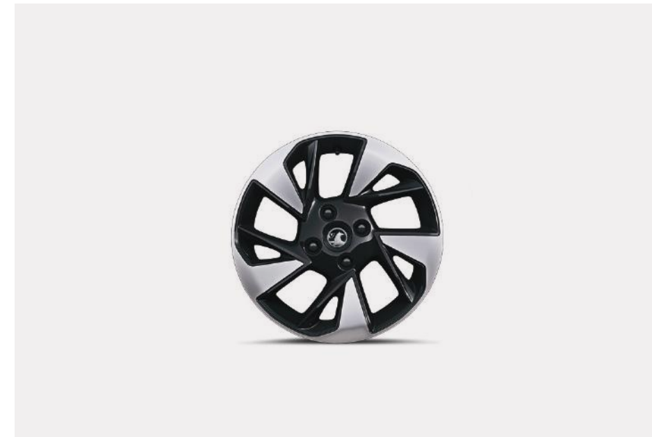
16-inch alloy wheel (Electric only). Optional at not extra cost