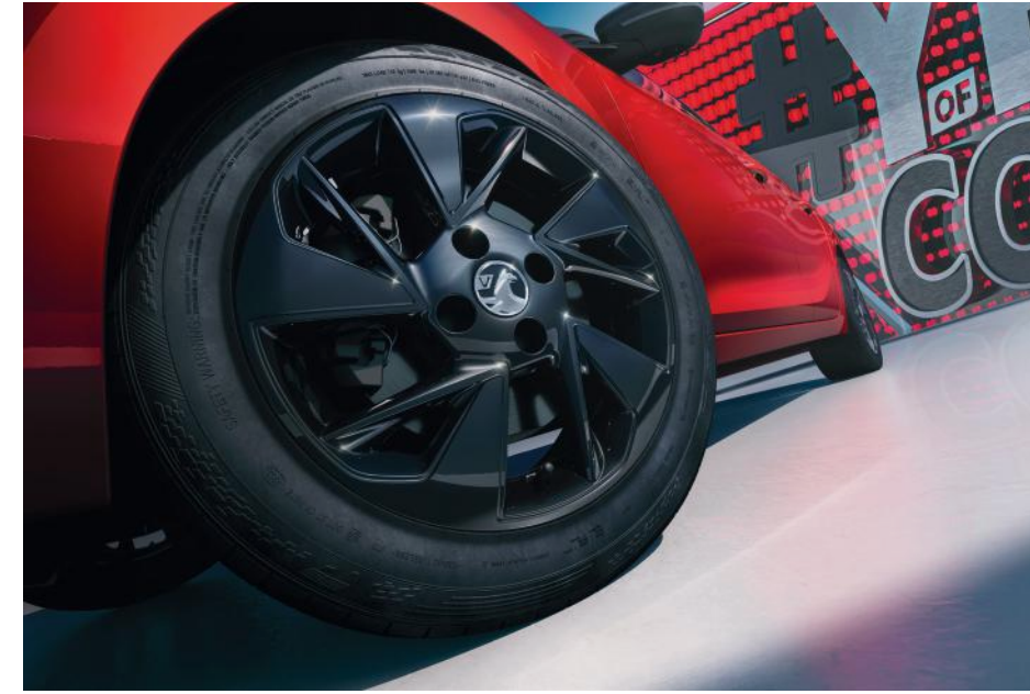
16-inch alloy wheel.