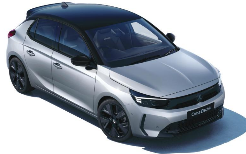
Crystal Silver (MOZR)** Two-coat metallic paint £600