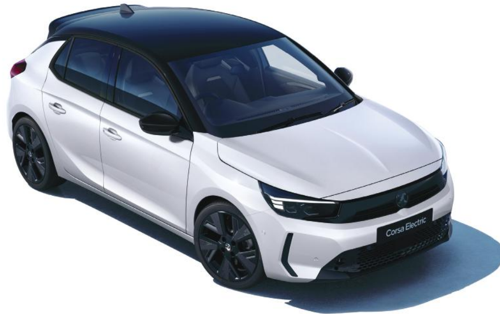
Arctic White (POWP)** Brilliant paint