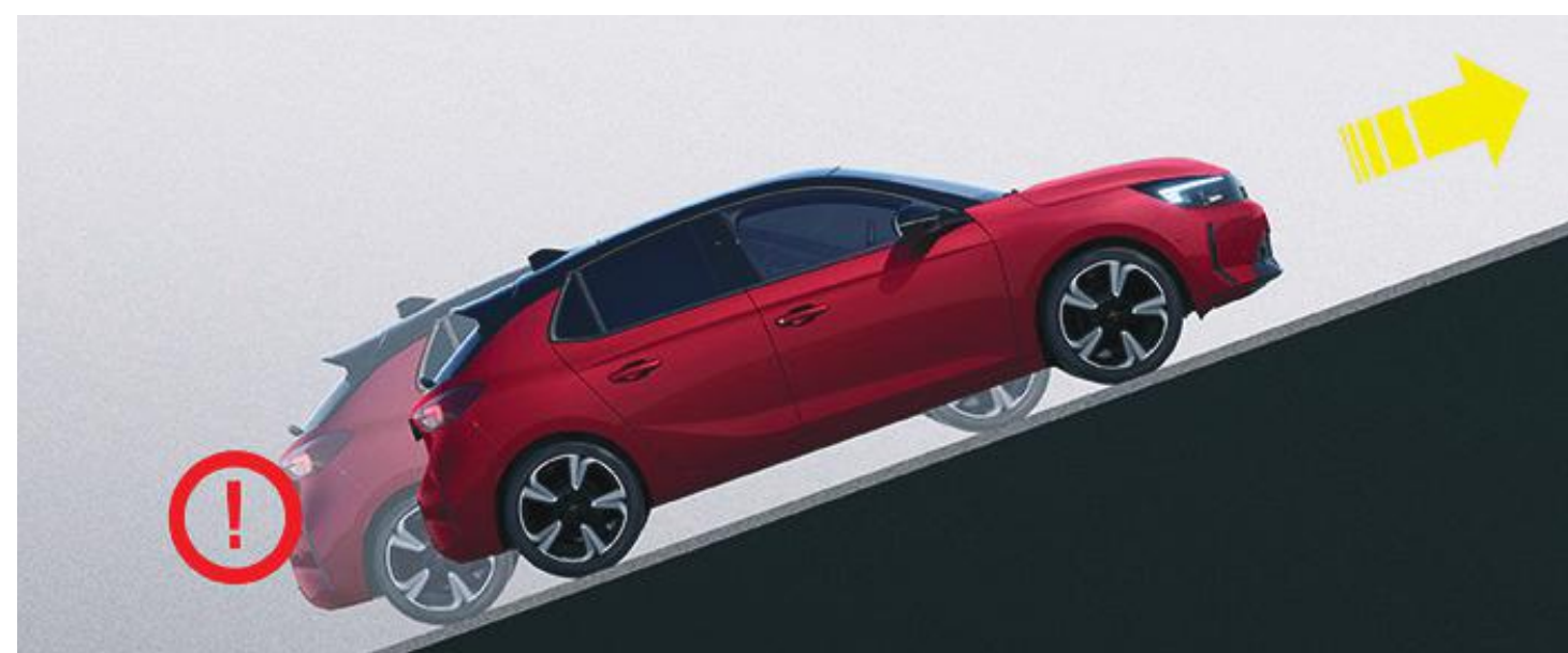
Hill start assist.