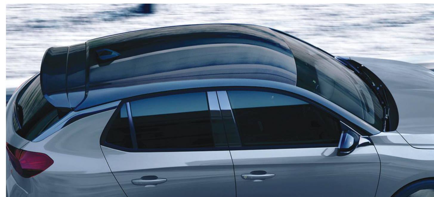
Black roof and dark-tinted rear windows.