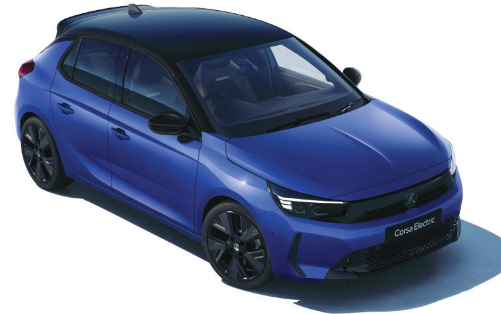
Voltaic Blue (MOAV)** Two-coat metallic paint £600