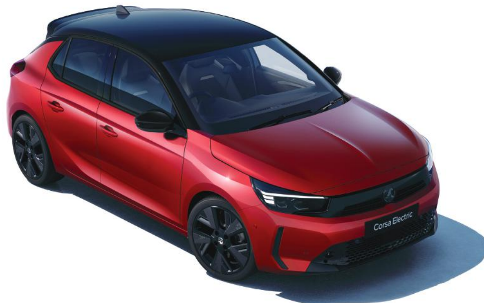
Crimson Red (MOPQ)** Two-coat premium metallic paint £700