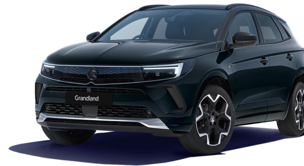
Carbon Black (OMMO/ON9V)** Two-coat metallic paint £600