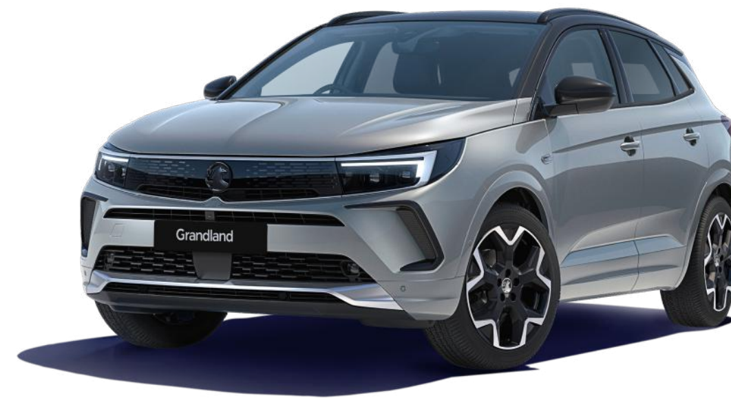
Contrast Grey (OMMO/ONF4)** Two-coat metallic paint £600