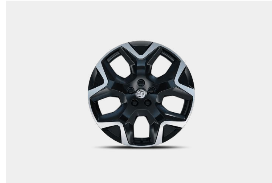
19-inch alloy wheel.