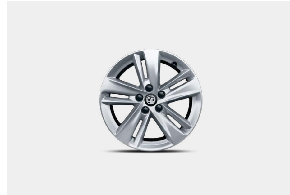
17-inch alloy wheel.