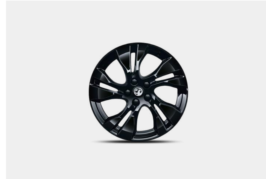
18-inch alloy wheel.