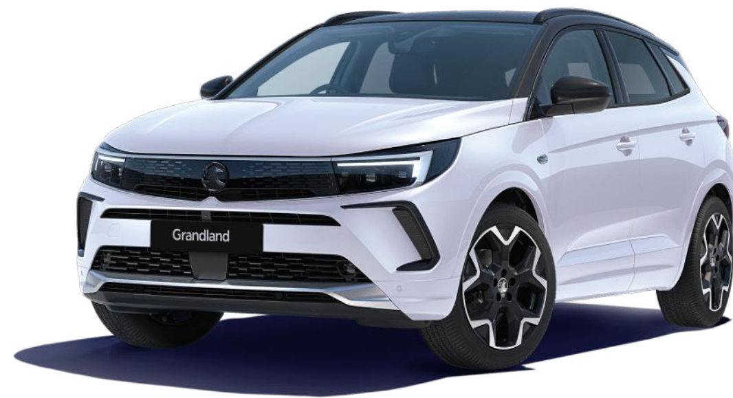
Arctic White (OMPO/ONWP)* Brilliant paint