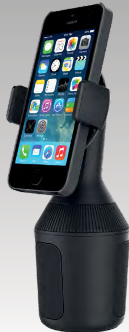
Universal Car Cup Phone Mount