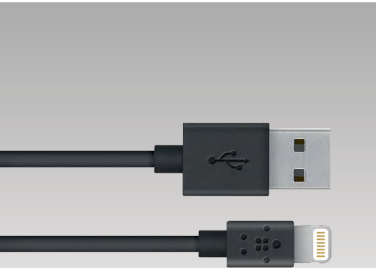
Lightning to USB Cable