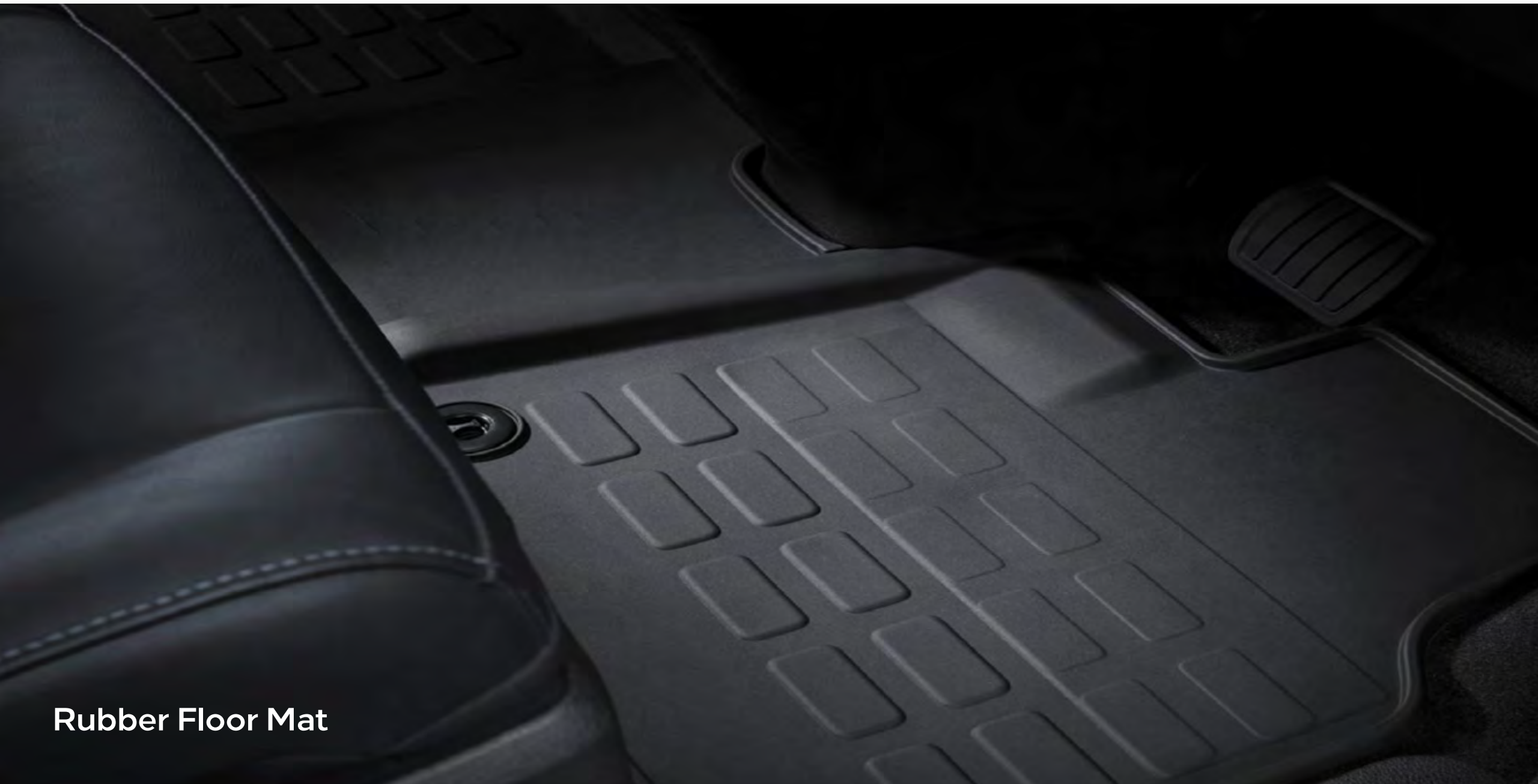
Rubber Floor Mat