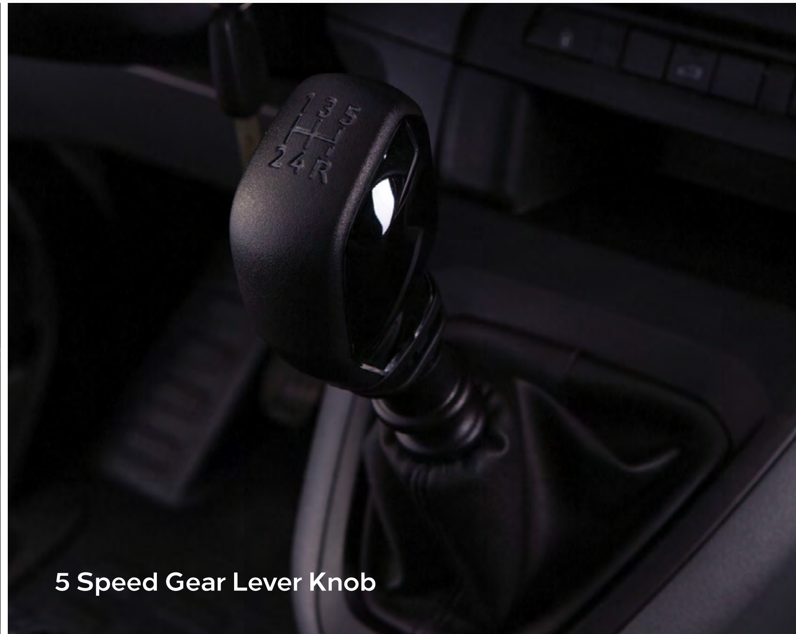
5 Speed Gear Lever Knob