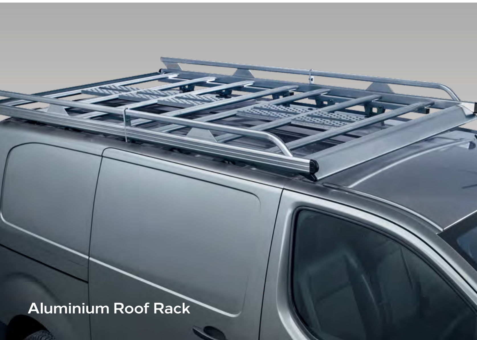
Aluminium Roof Rack