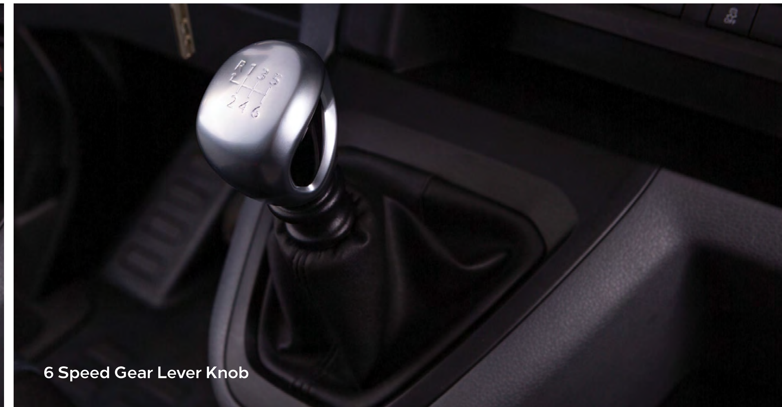
6 Speed Gear Lever Knob