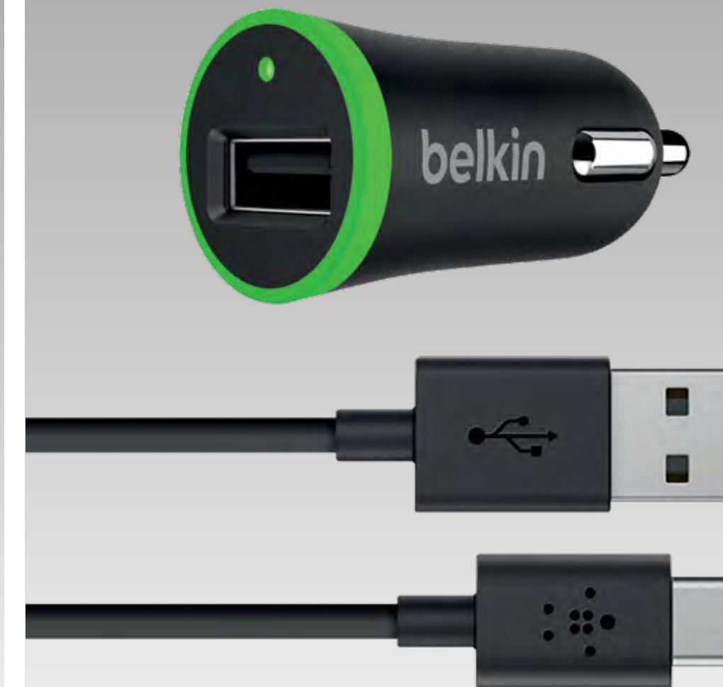
Universal Car Charger with USB-C Cable