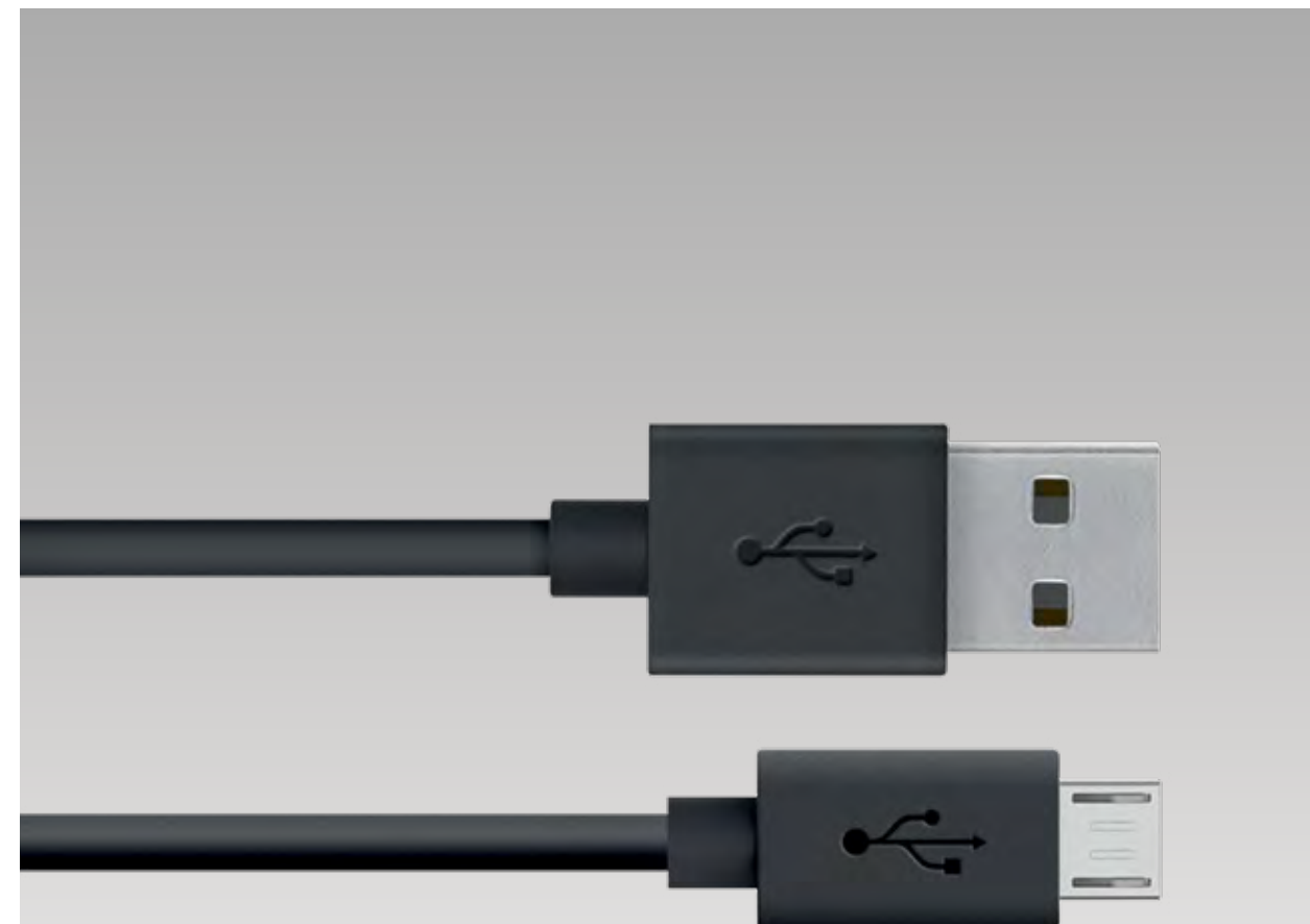
Micro-USB Charge/Sync Cable