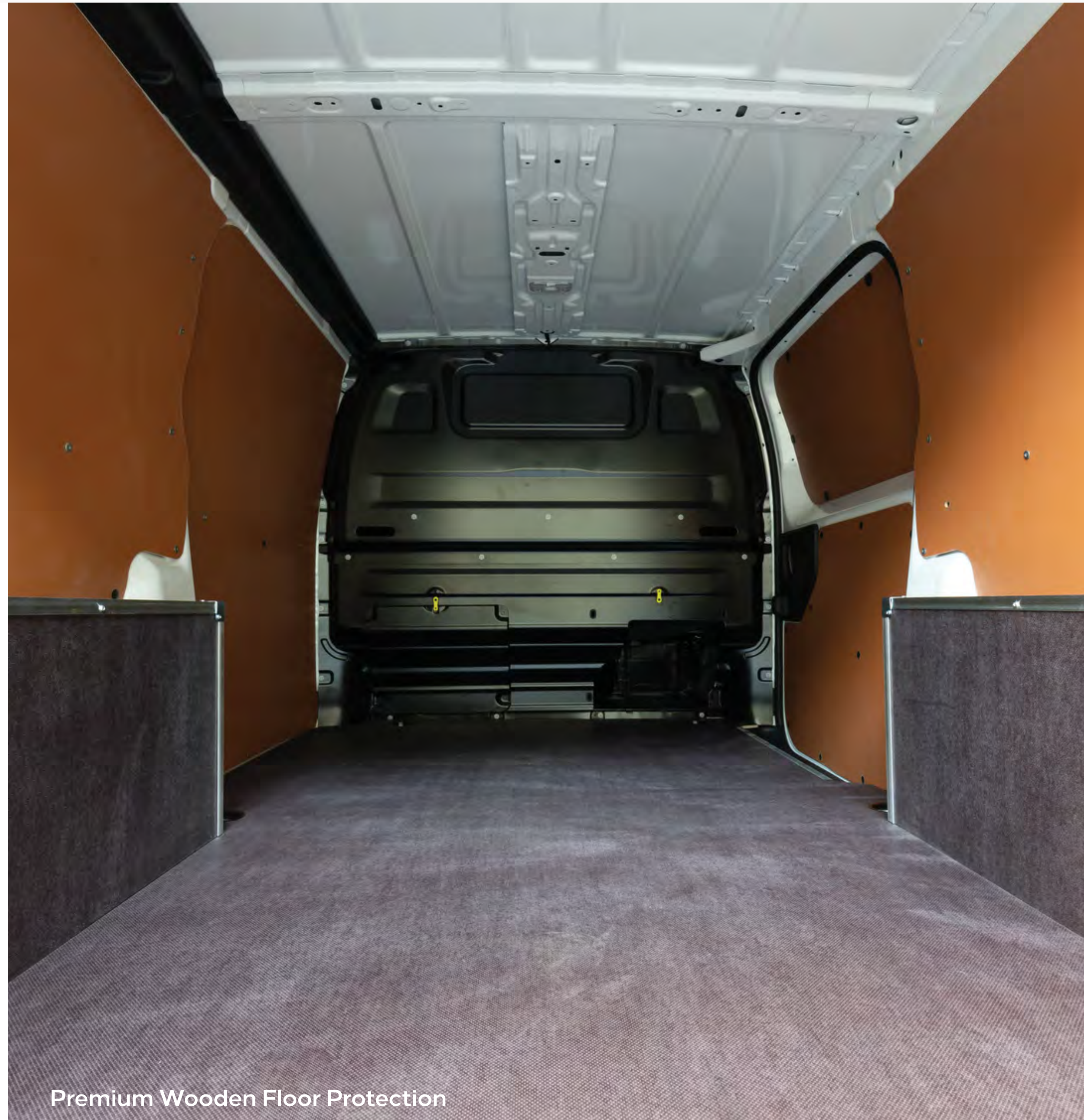
Premium Wooden Floor Protection