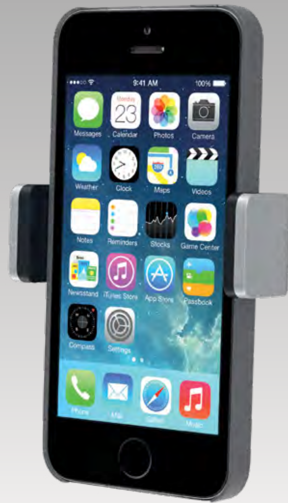
Universal Car Vent Phone Mount