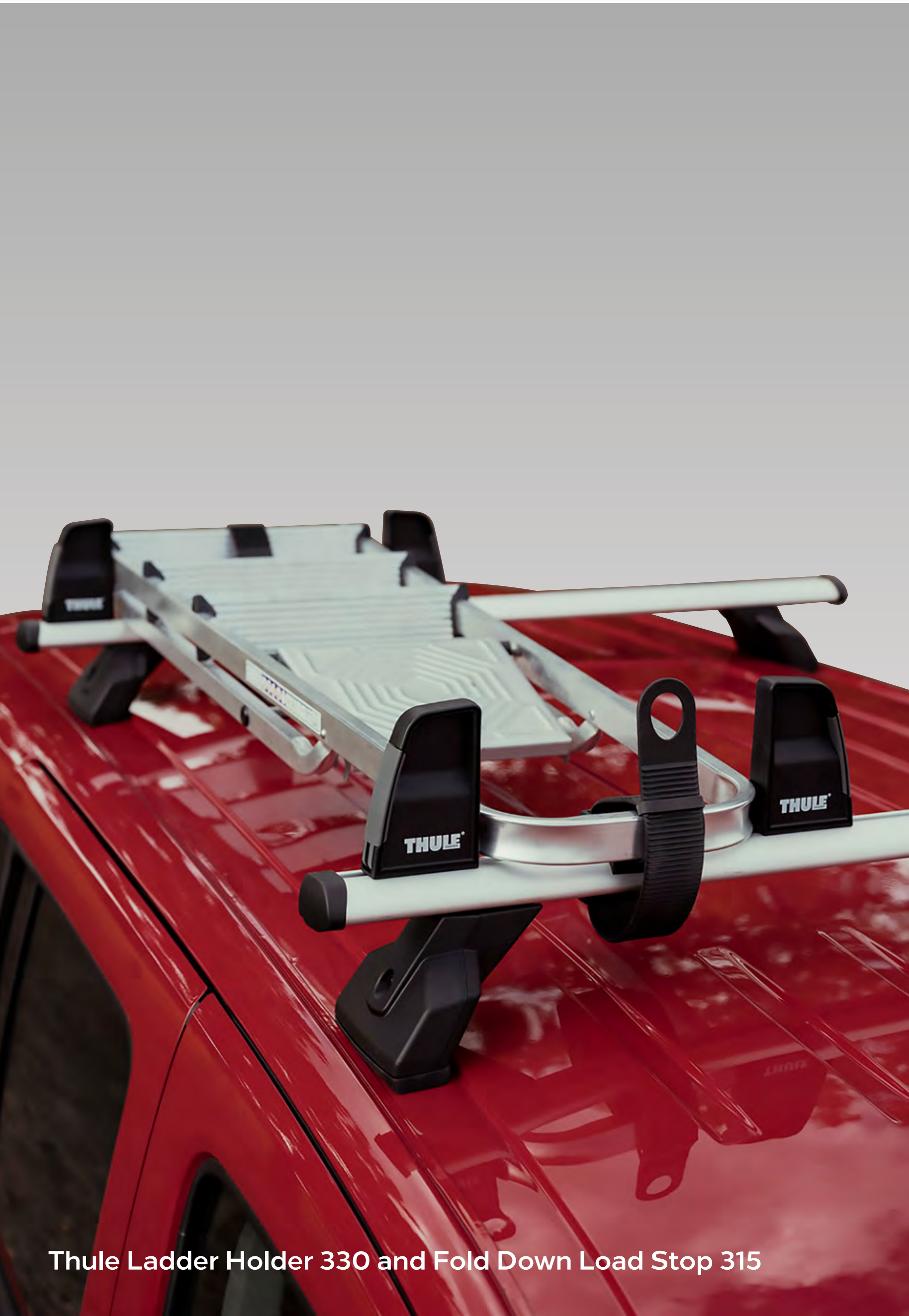
Thule Ladder Holder 330 and Fold Down Load Stop 315