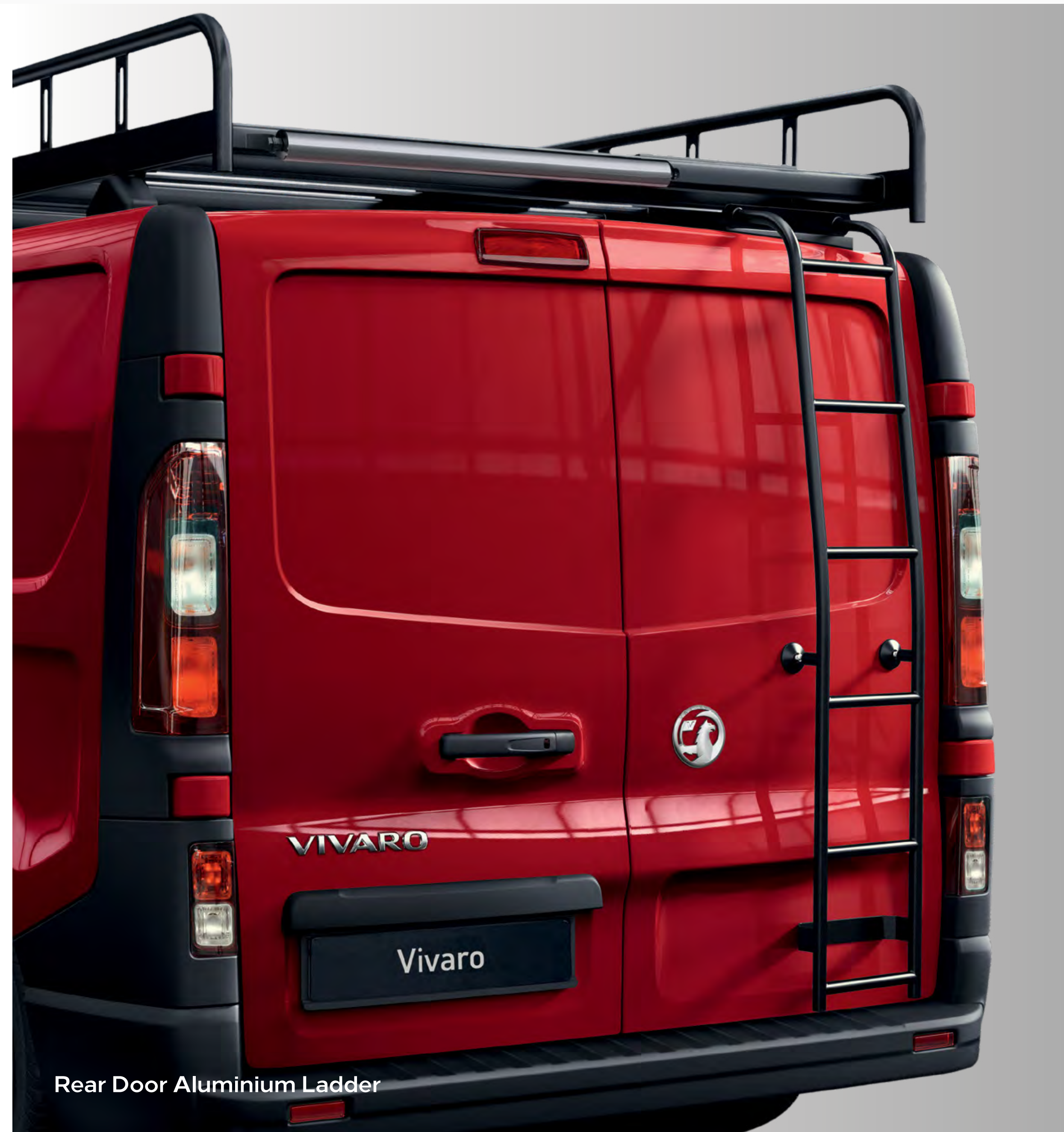
Rear Door Aluminium Ladder