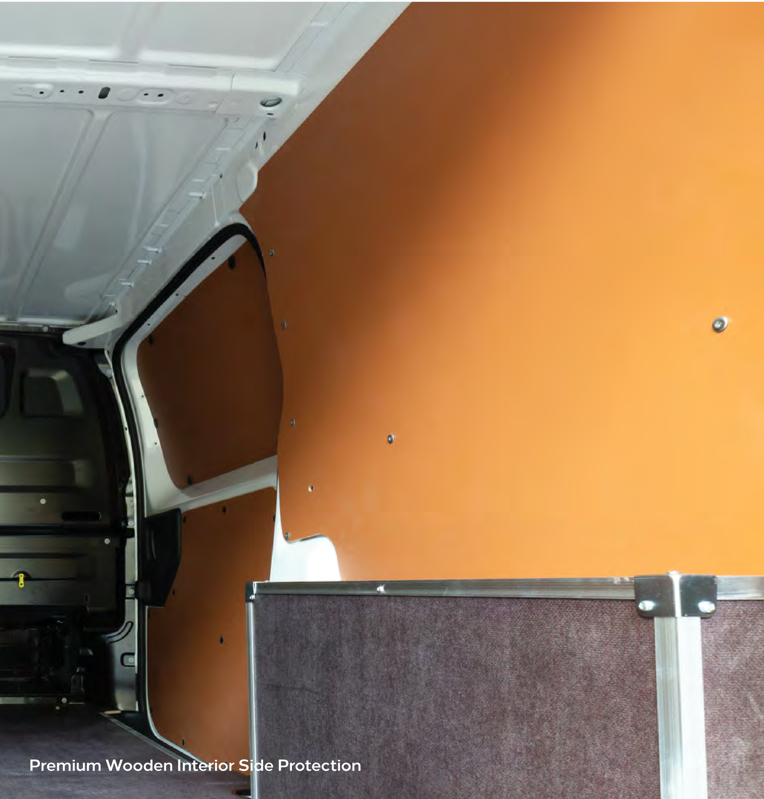
Premium Wooden Interior Side Protection