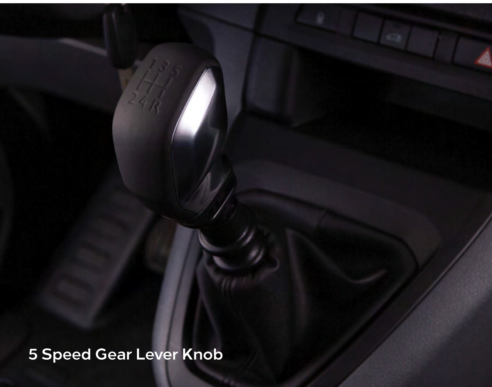
5 Speed Gear Lever Knob