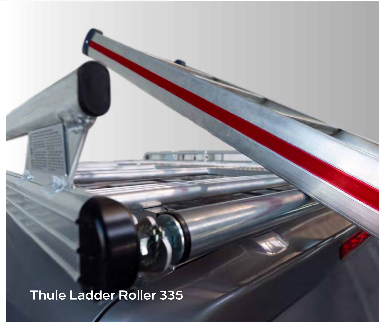
Thule Ladder Roller 335