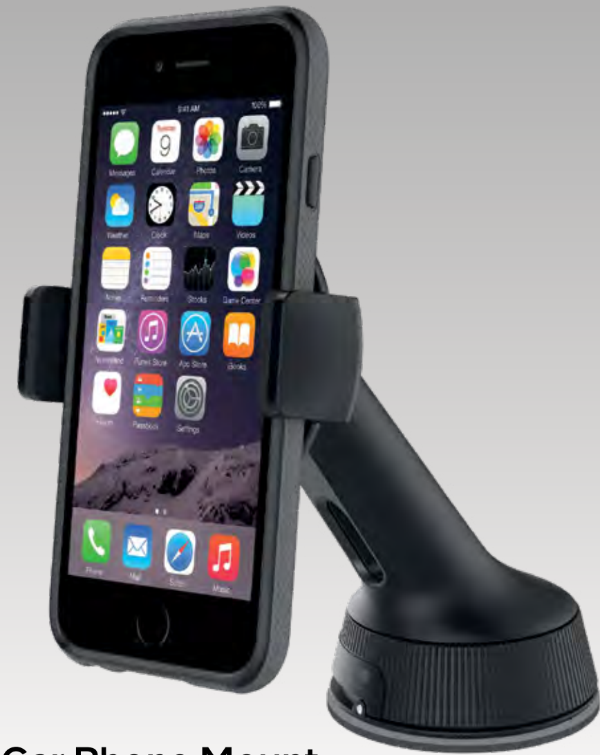
Universal Car Phone Mount