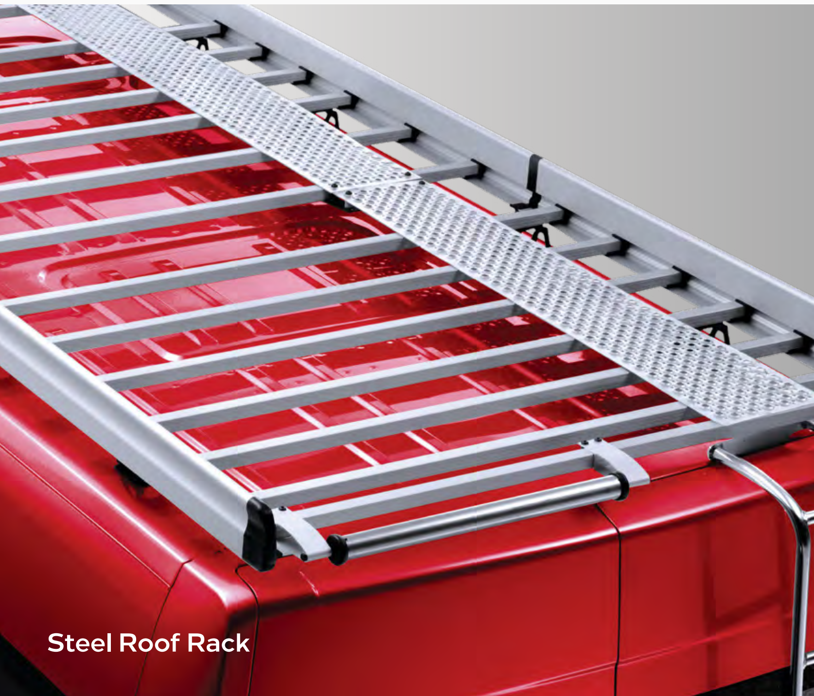
Steel Roof Rack