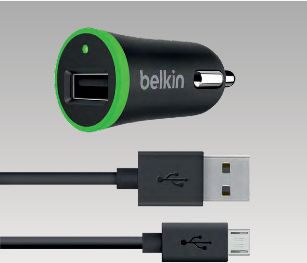
Universal Car Charger with Micro-USB