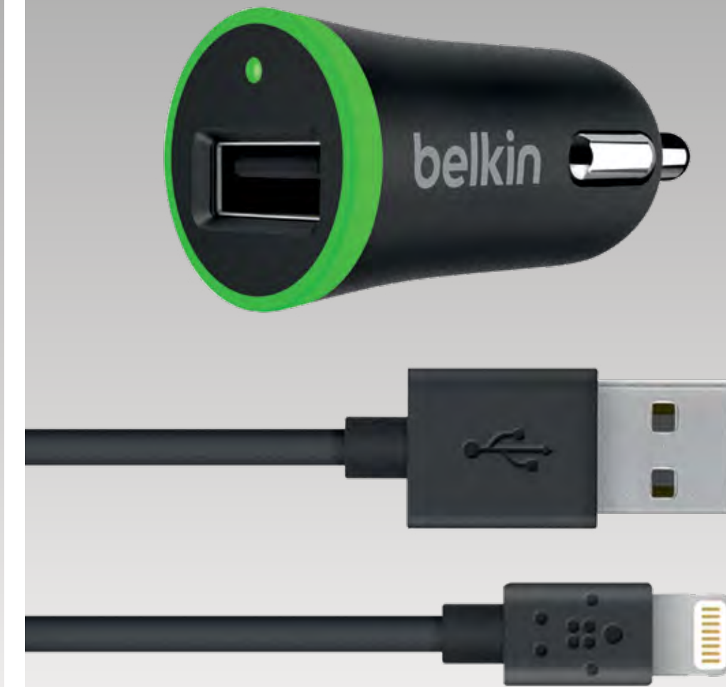
Universal Car Charger with Lightning Cable