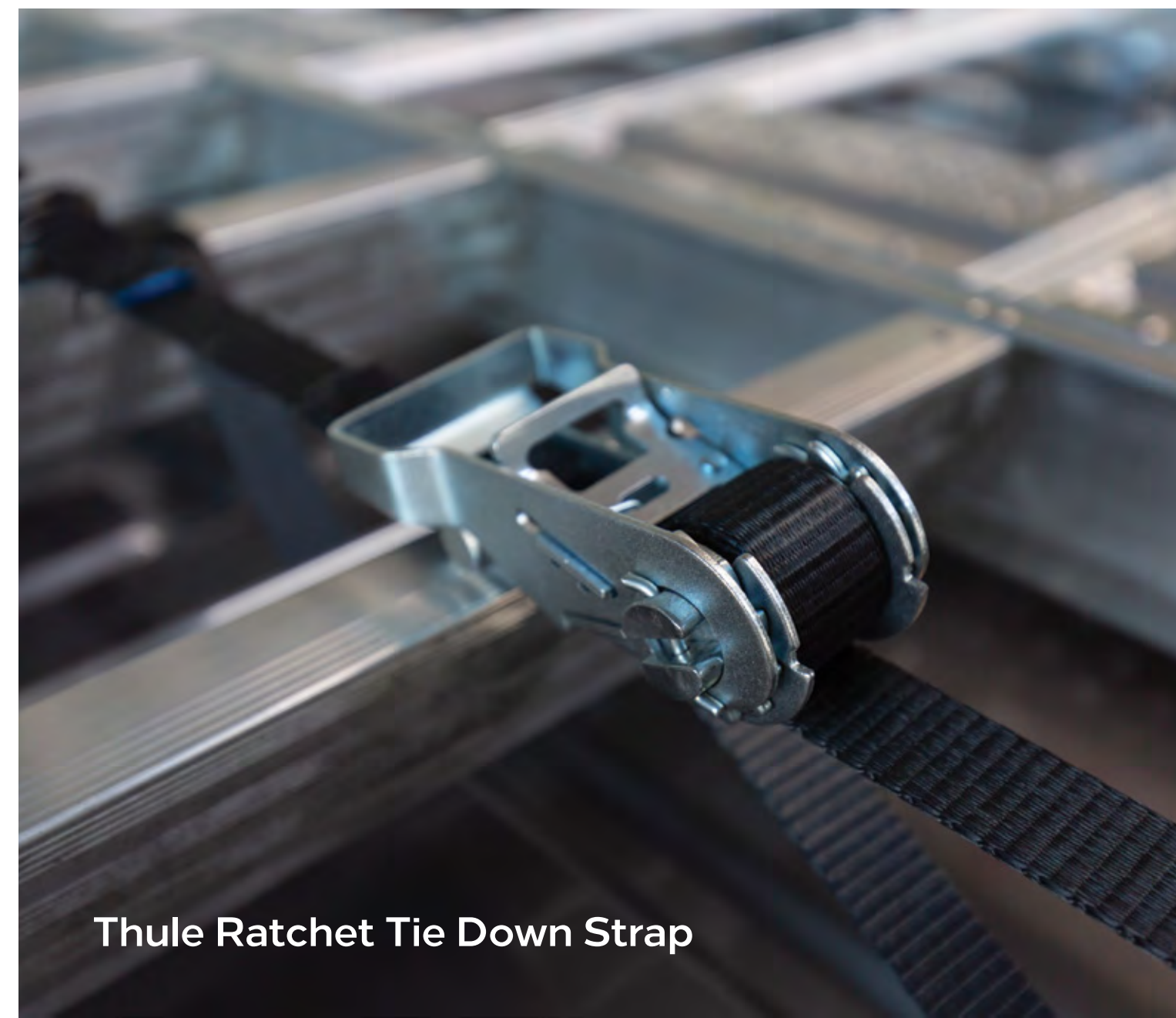
Thule Ratchet Tie Down Strap