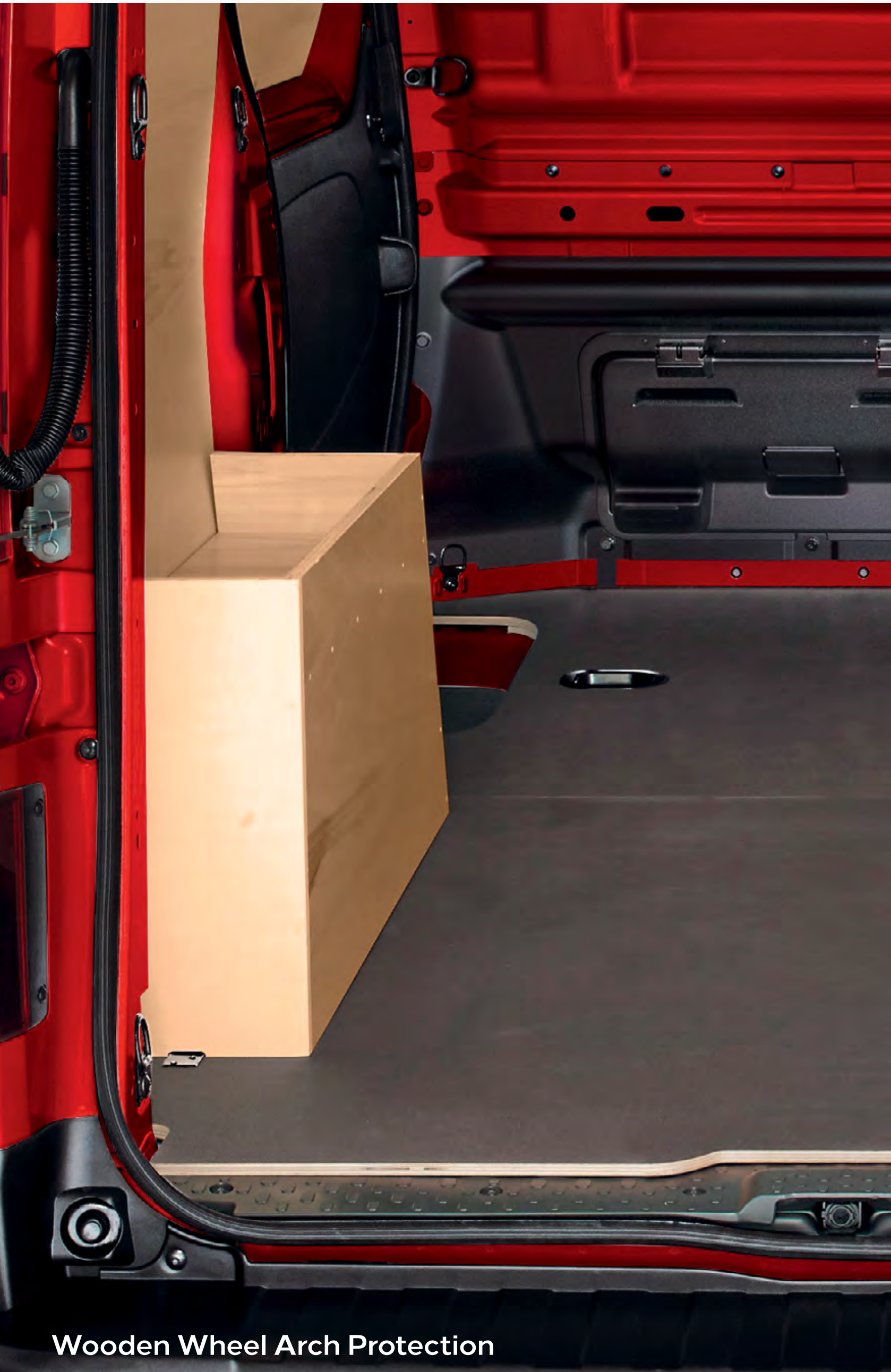
Wooden Wheel Arch Protection