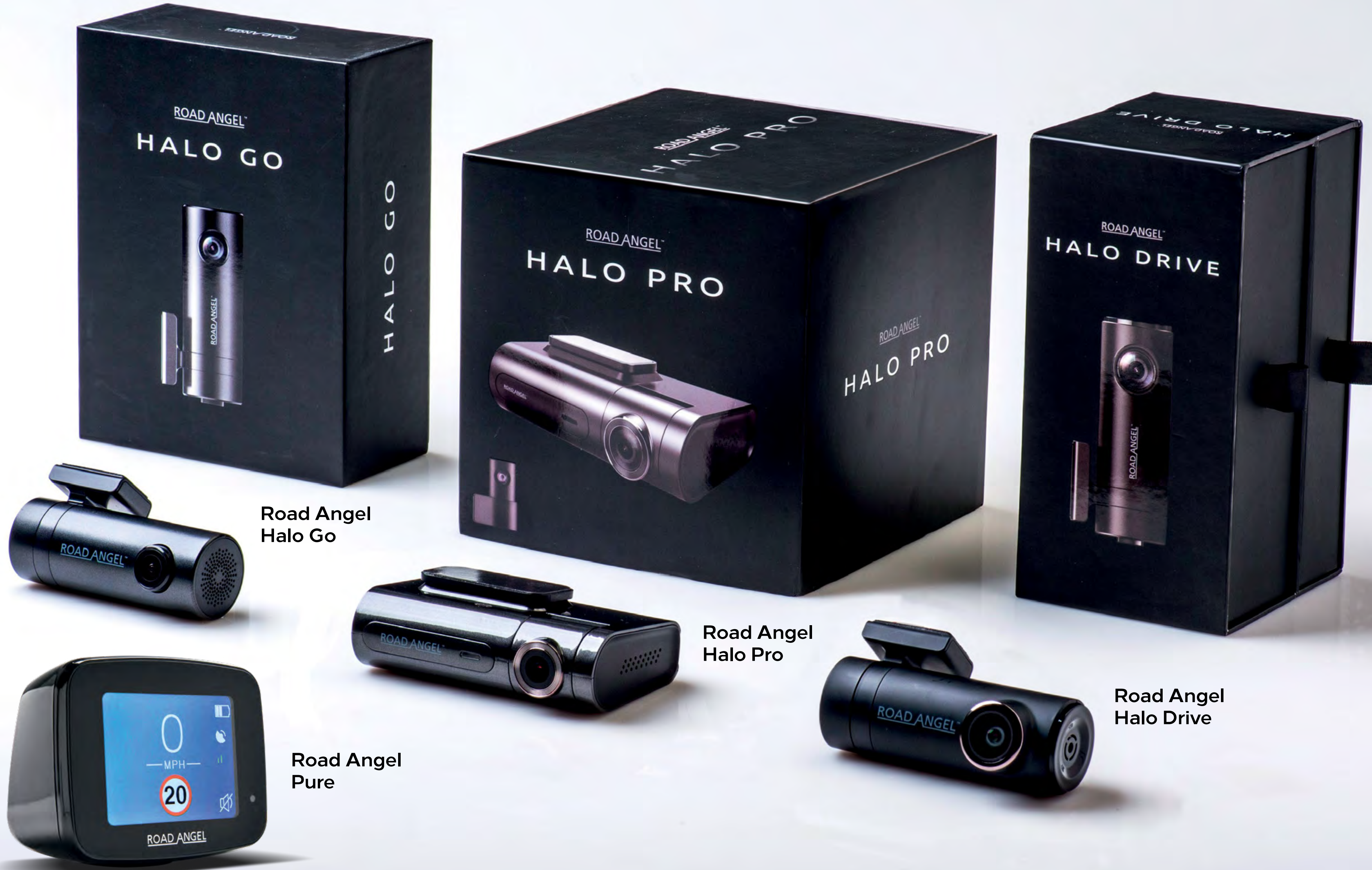
Road Angel Halo Go