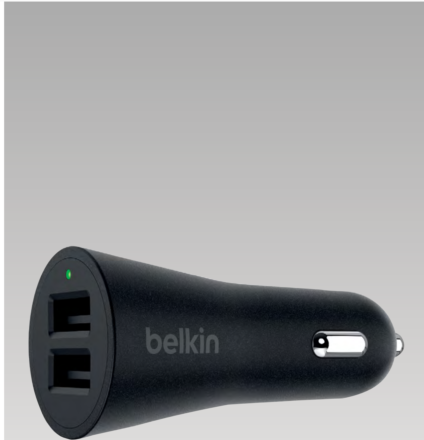
2-Port Universal Car Charger