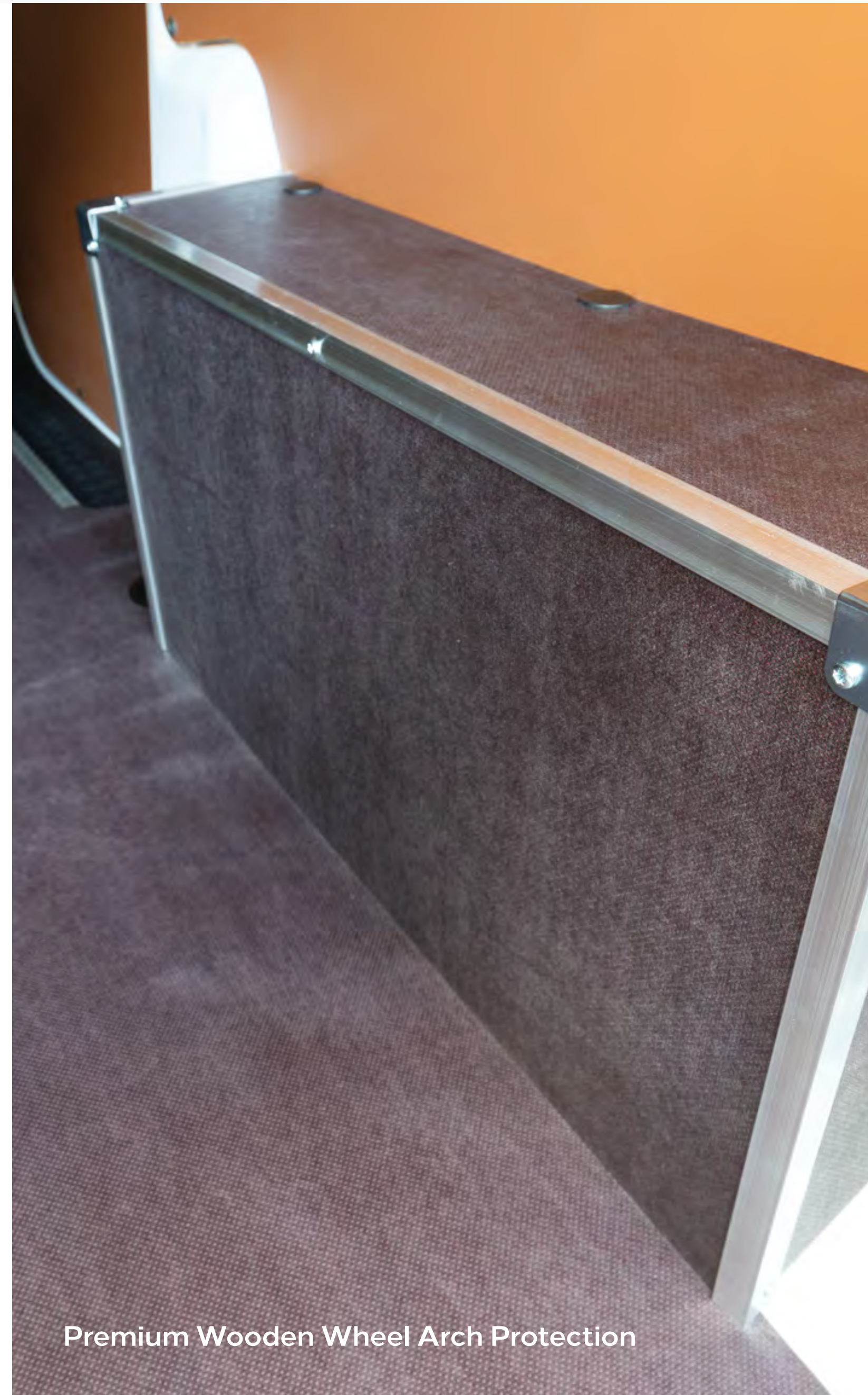
Premium Wooden Wheel Arch Protection