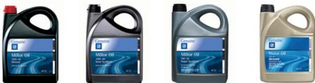
Vauxhall approved oils: Mineral Oil, Semi-Synthetic Oil, Super Synthetic Oil and Dexos2 Oil

The recommended type of oil for your car can be found in your Vauxhall Owner's Manual/Service Booklet. Vauxhall approved oils offer complete protection from the moment the engine is started. They are designed to give smooth performance, low emissions and improved fuel economy – all geared to maximising your engine's life. Use of inferior specification oil may have a detrimental effect on engine life and performance.