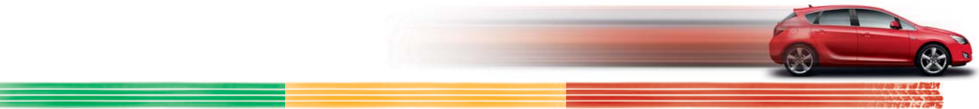
Legal limit – 1.6mm tread depth