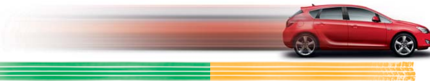
Recommended minimum – 3mm tread depth