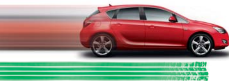
New tyre – 8mm tread depth

It is recommended you change your tyres when the tread depth reaches 3mm – following research** that highlighted an 8 metre difference in stopping distance when travelling at 50 mph in the wet compared to tyres at the 1.6mm legal limit.