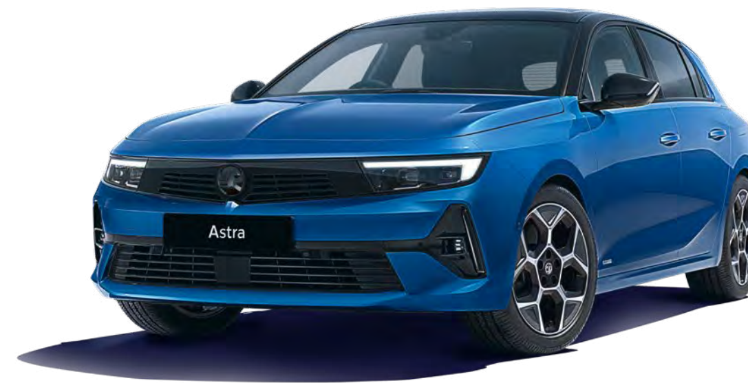
Cobalt Blue (M6SM)†† Tri-coat premium metallic paint £700