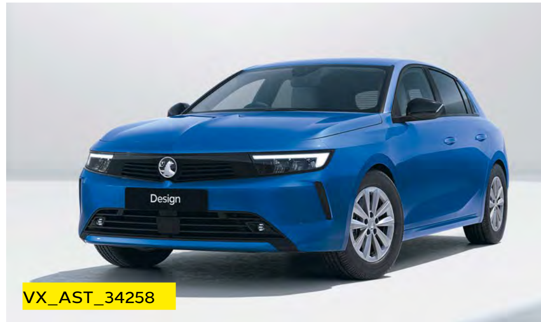
Design Petrol/Plug-in Hybrid.