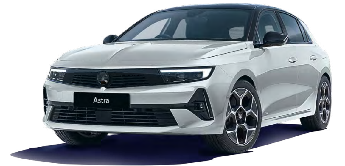
Crystal Silver (MOZR)** Two-coat metallic paint £600