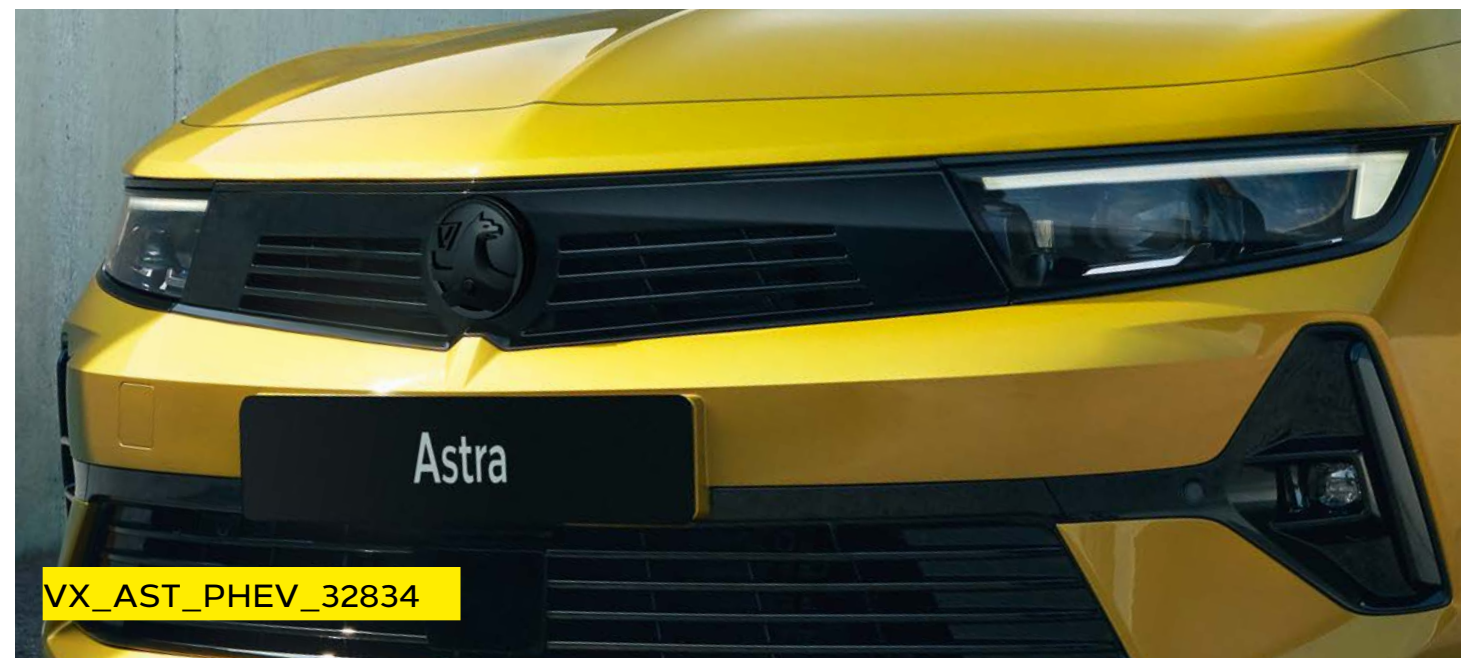
Black Griffin logo and vizer frame.

*Optional at extra cost including VAT. **Standard with Carbon Black body colour. †Not available with Electric Yellow or Cobalt Blue paints.