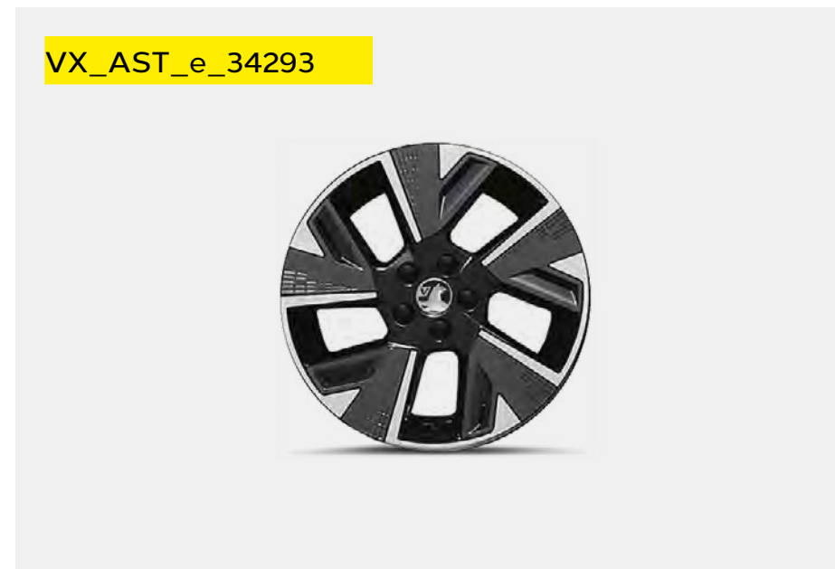
18-inch alloy wheel.