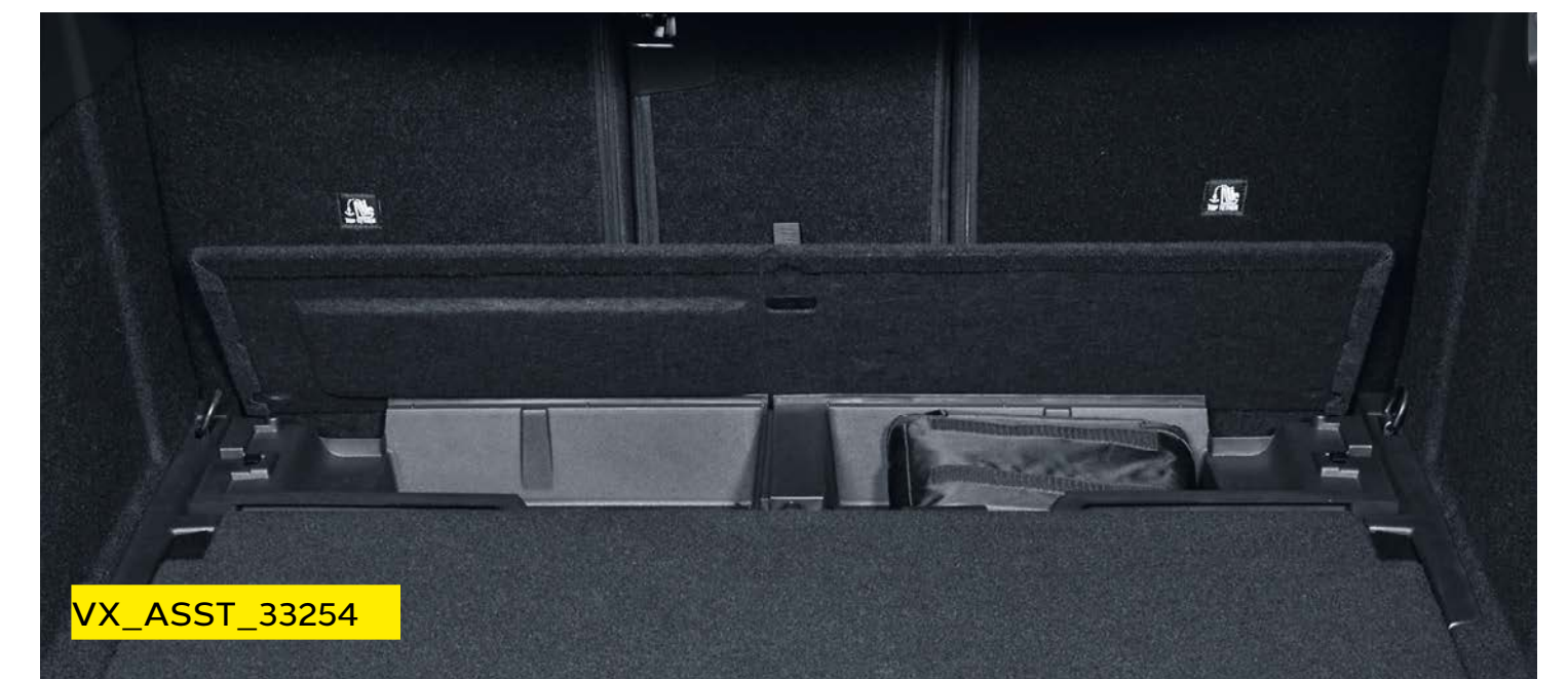
Easy accessible storage boxes.