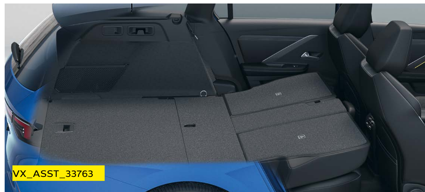
Intelli-Space 40/20/40 split rear seats.