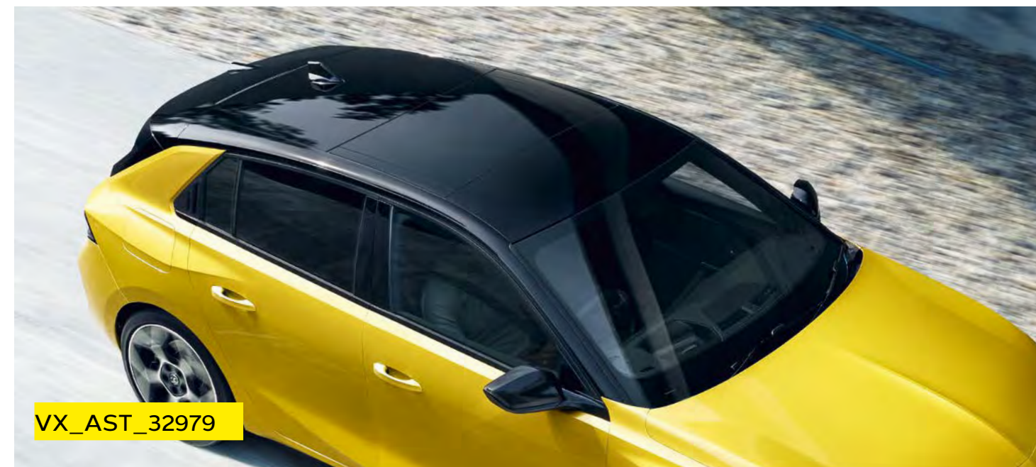
Black roof and dark-tinted rear windows.