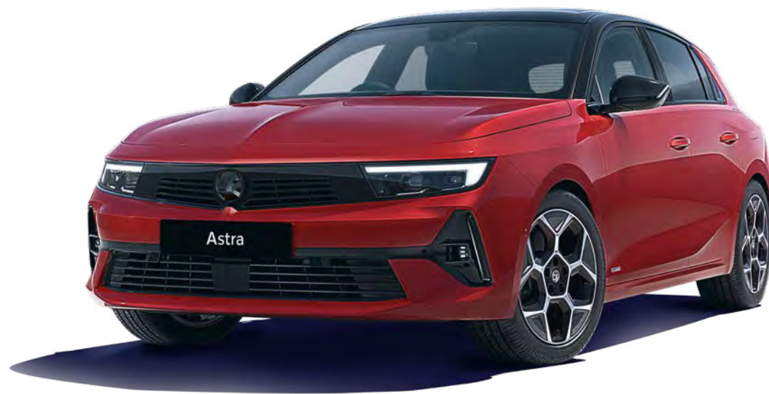
Crimson Red (M5PQ)** Two-coat premium metallic paint £700