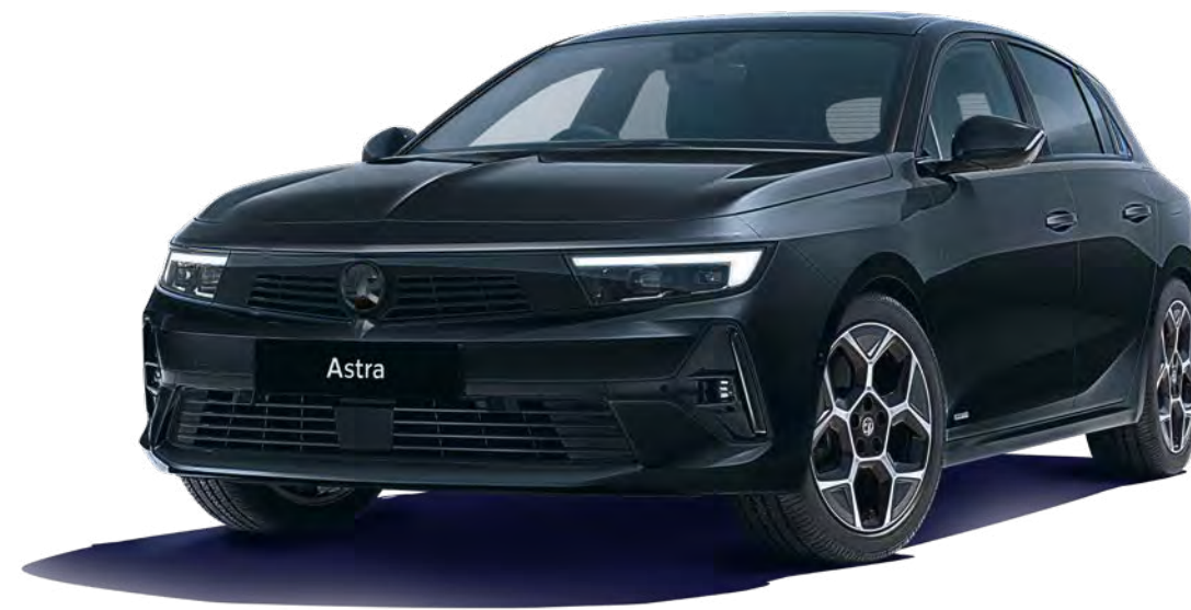
Carbon Black (M49V)** Two-coat metallic paint £600