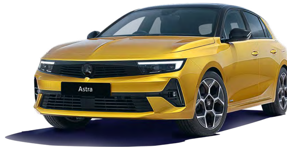
Electric Yellow (MORV)† Two-coat premium metallic paint £700