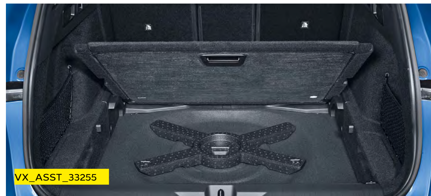
Intelli-Space adjustable load floor.