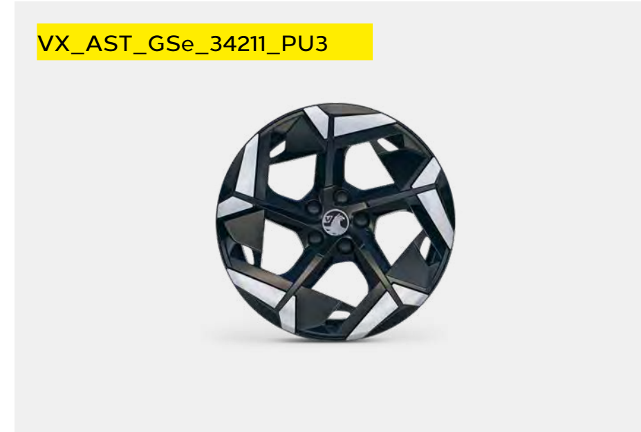
18-inch alloy wheel.