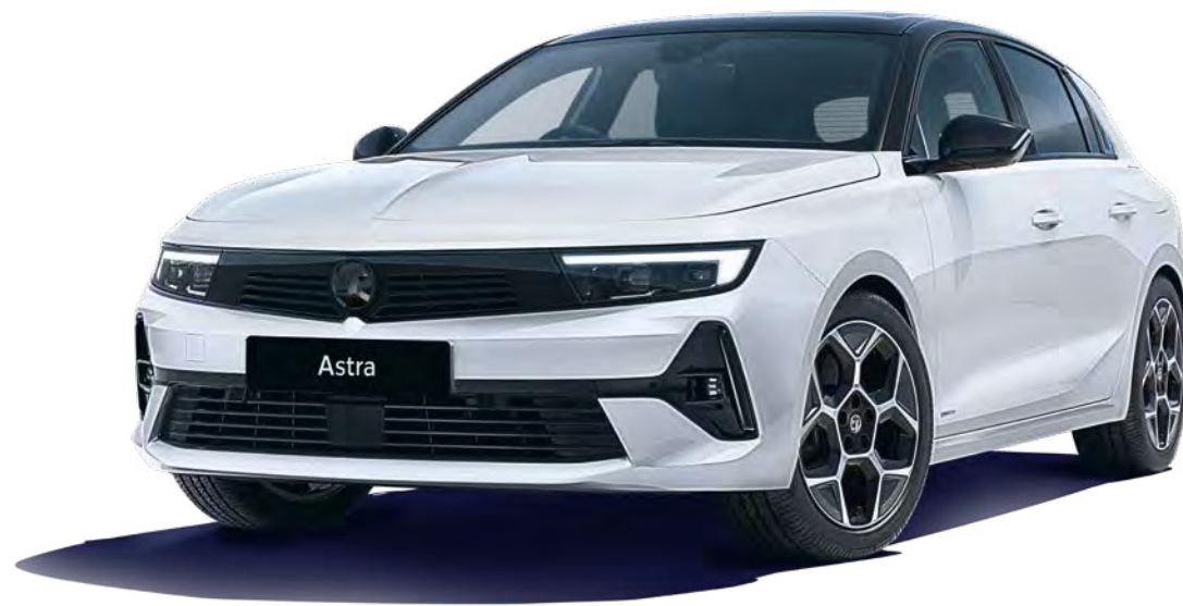
Arctic White (POWP)* Brilliant paint