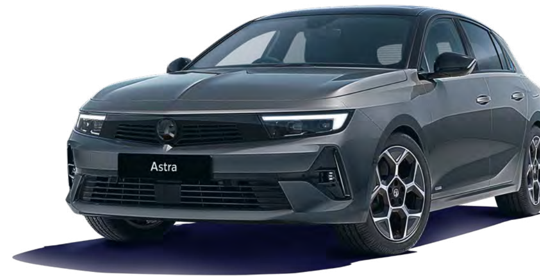
Vulcan Grey (MOVL)** Two-coat metallic paint £600