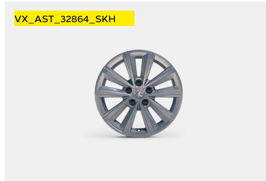
16-inch alloy wheel.