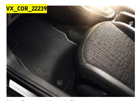
Velour floor mats add a touch of luxury.