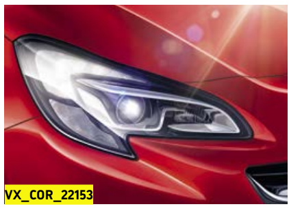
Bi-xenon headlights with cornering lights help you to see better when cornering at night.