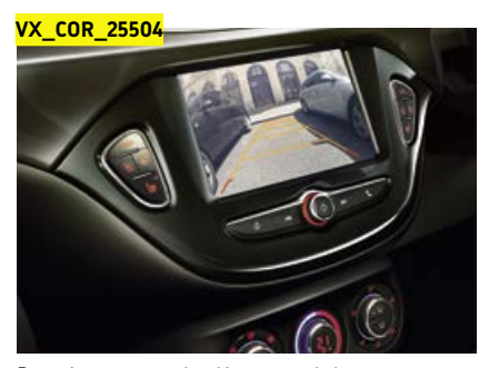
Rear-view camera and parking sensors help you to reverse safely and accurately.