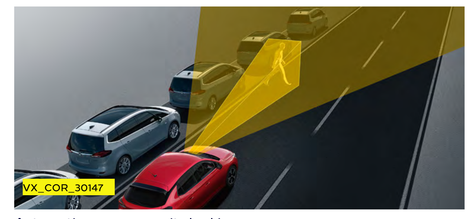
Automatic emergency city braking.