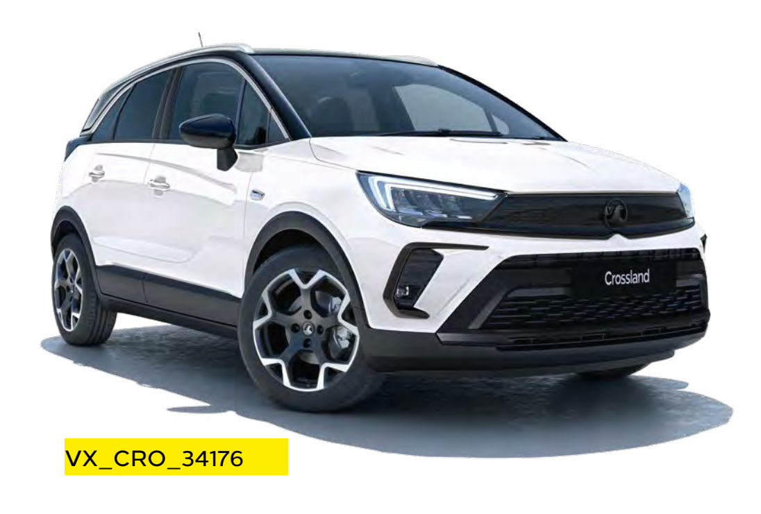
Arctic White (POWP)* Brilliant paint