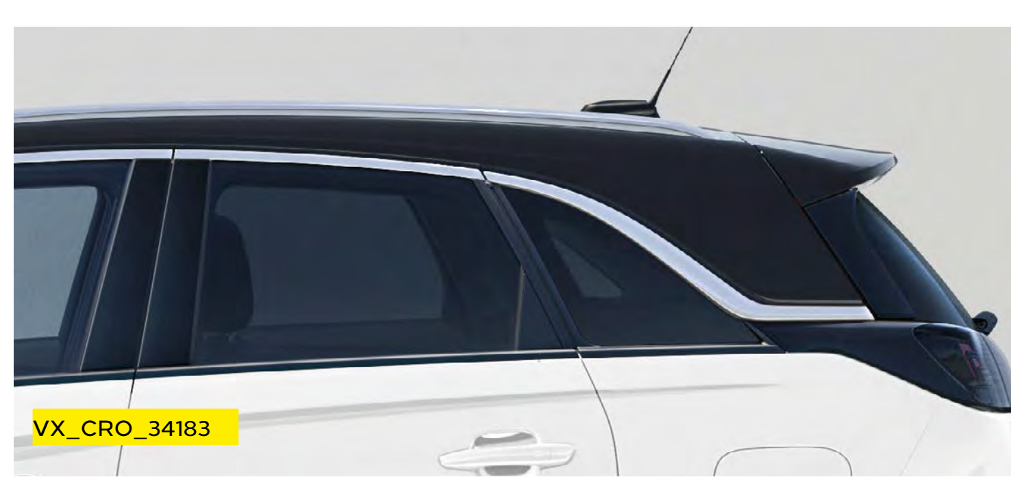
d silver-effect roof rails. Dark-tinted windows and chrome-effect window moulding.