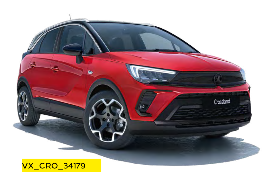
Crimson Red (MOPQ)** Two-coat premium metallic paint £700