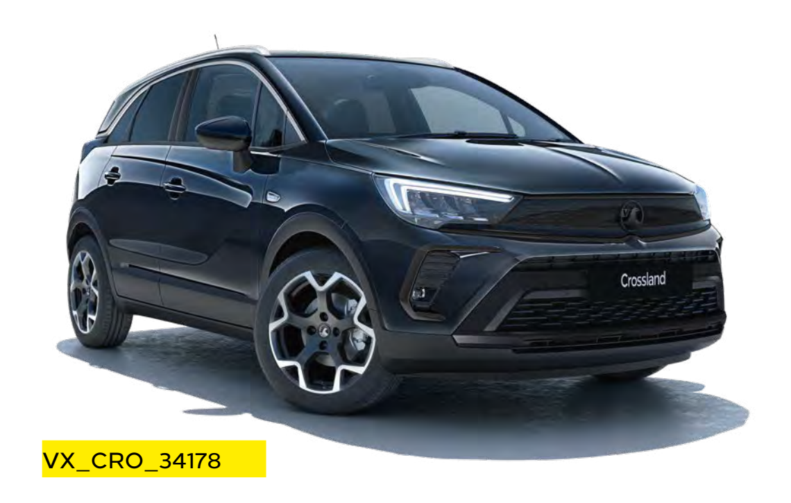
Carbon Black (M09V)** Two-coat metallic paint £600