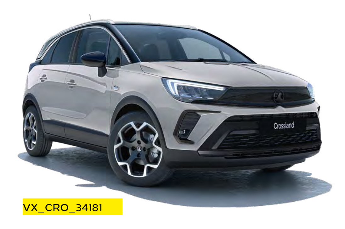
Crystal Silver (MOZR)** Two-coat metallic paint £600