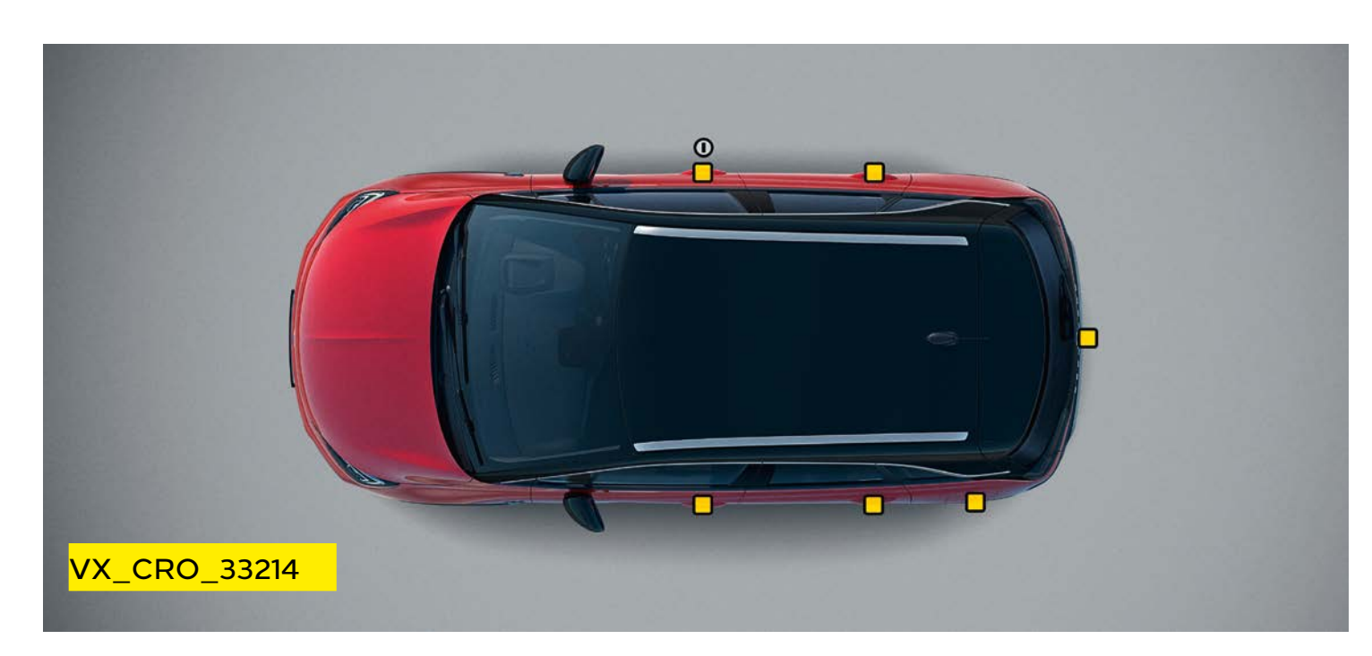
ISOFIX child seat mountings.