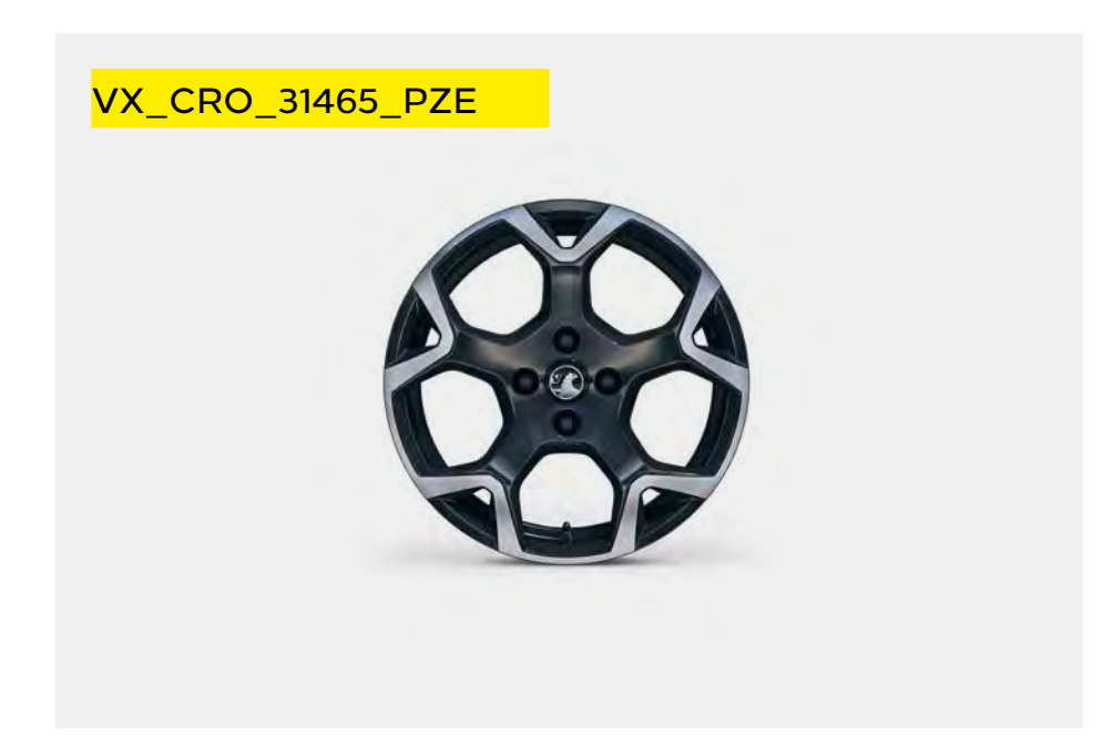
17-inch alloy wheel.