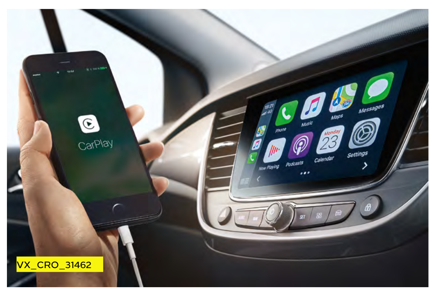
Please note, Apple CarPlay screen illustrated on 8-inch colour touchscreen on multimedia Navi Pro audio unit.