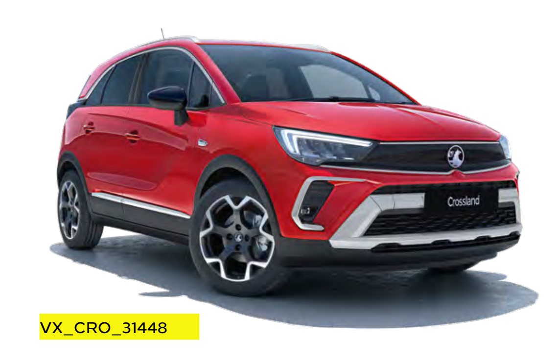
Hot Red (G1R)** Two-coat premium metallic paint £700