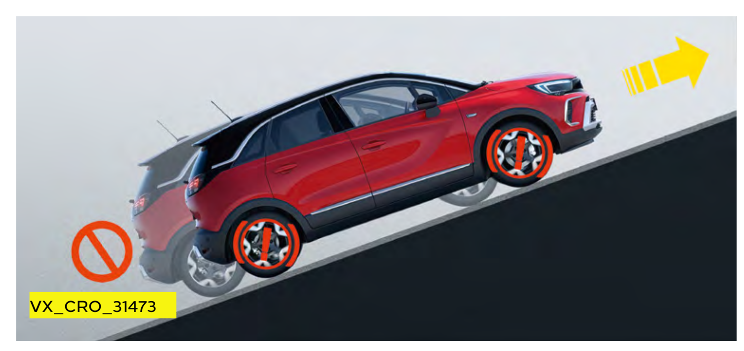
Hill start assist.