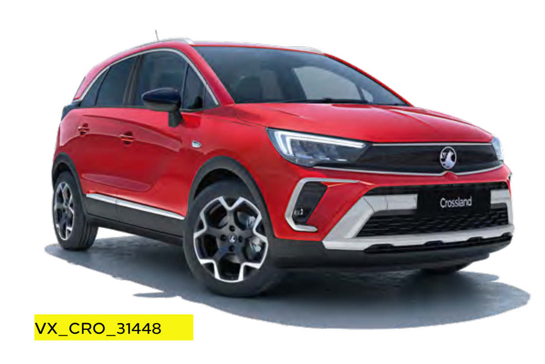
Hot Red (G1R)** Two-coat premium paint £650