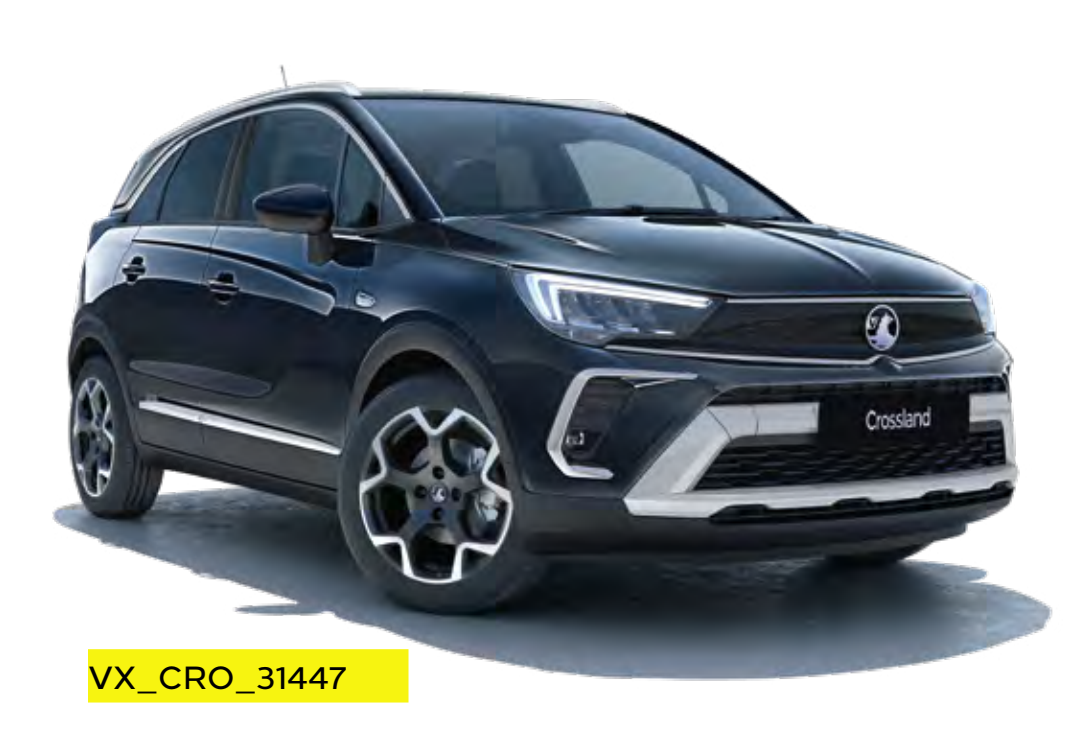
Diamond Black (G70)** Two-coat metallic paint £550