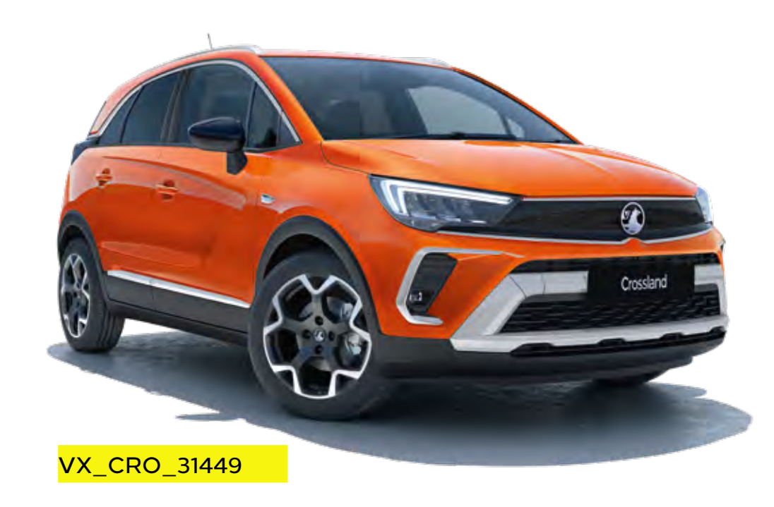
Power Orange (GPQ)** Two-coat premium paint £650