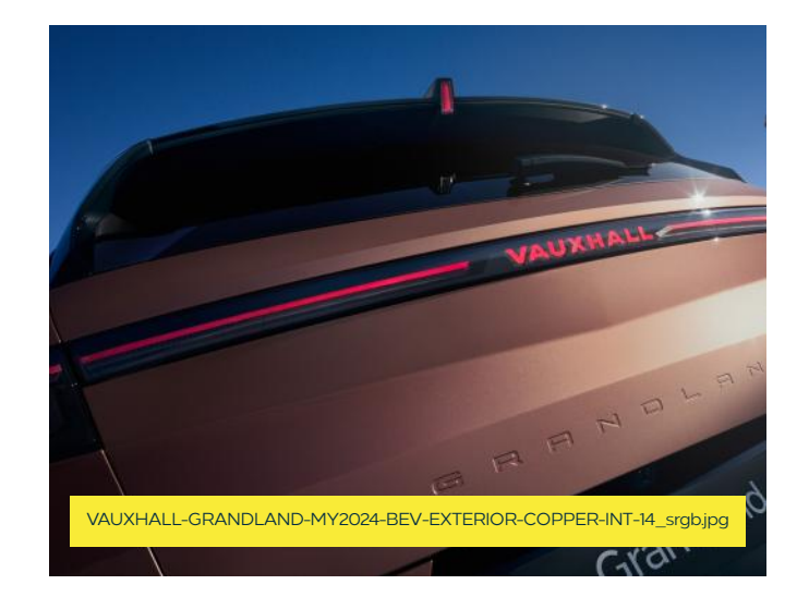
Impact Copper - Gloss Metallic Paint