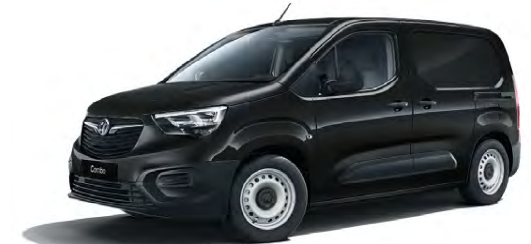
Pearl Black (G70)** Two-coat metallic paint £475