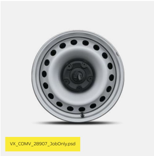
16" steel wheel with centre cap