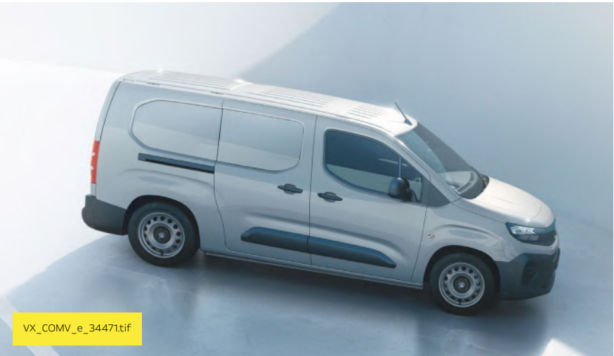
XL model illustrated