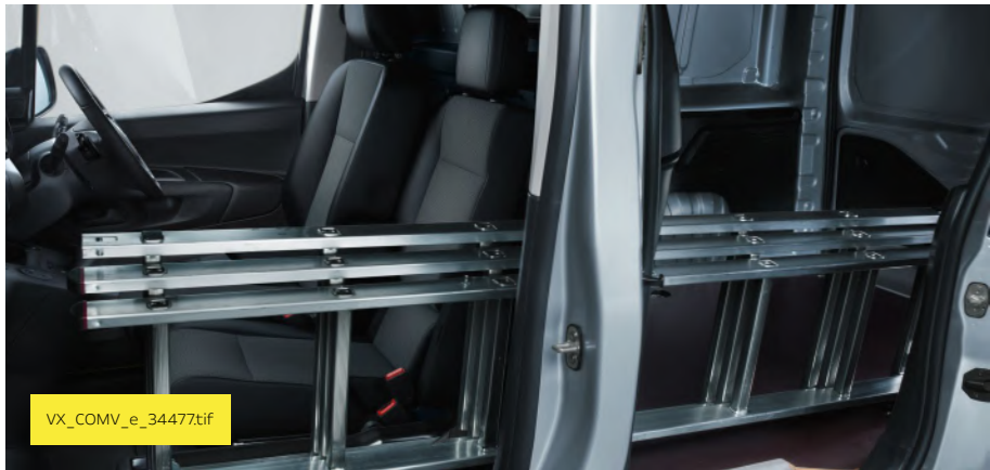
Load-through hatch within bulkhead