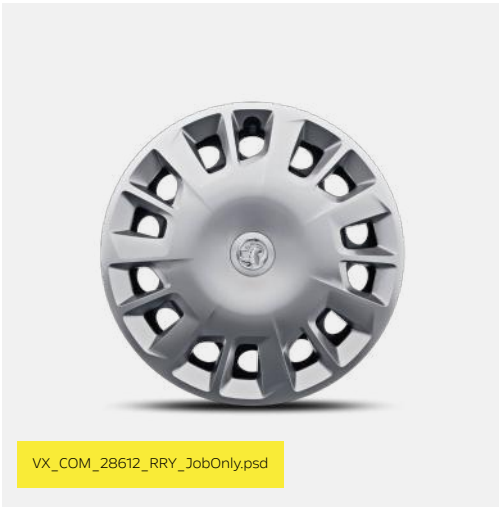
16" steel wheel with full-diameter wheel trim