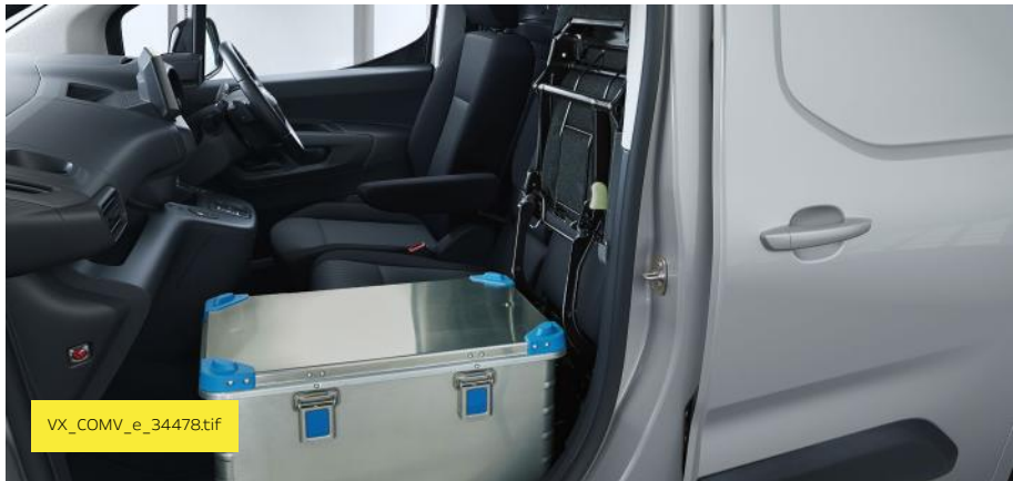
Fully folding passenger seat