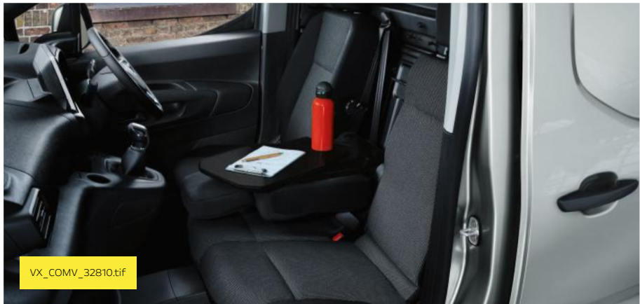
Fold-flat centre seat backrest with table.