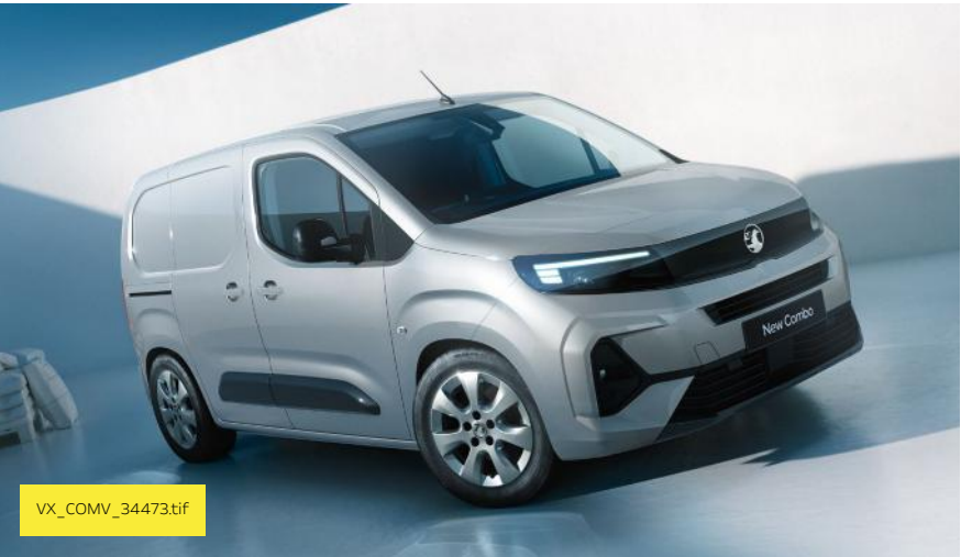
Pro shown with optional 16" "Viana" Alloy Wheels