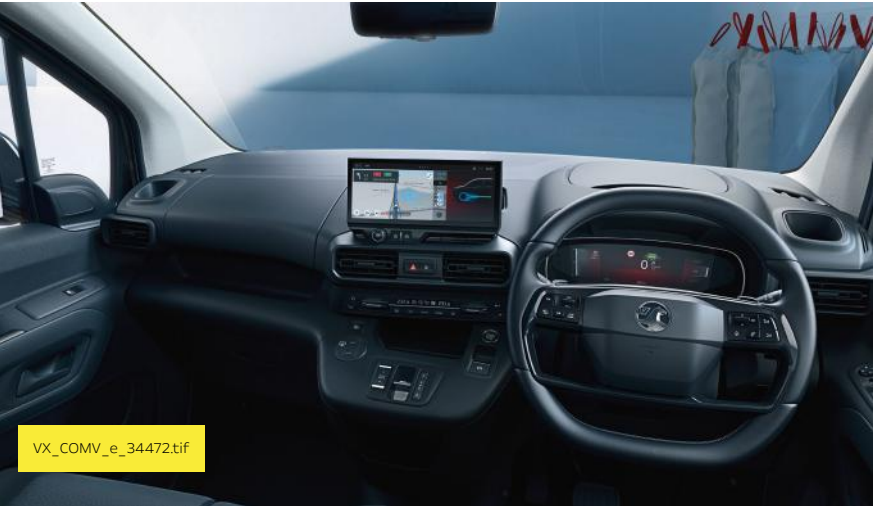
Panel Van – Interior illustrated features Multimedia Pro Navi with 10" touchscreen, available as an extra-cost option