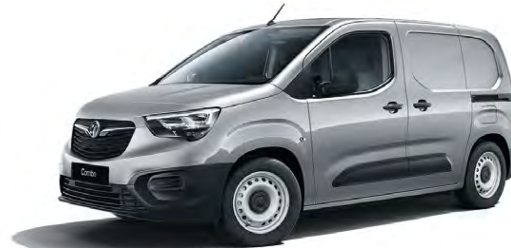
Quartz Silver (G41)** Two-coat metallic paint £475