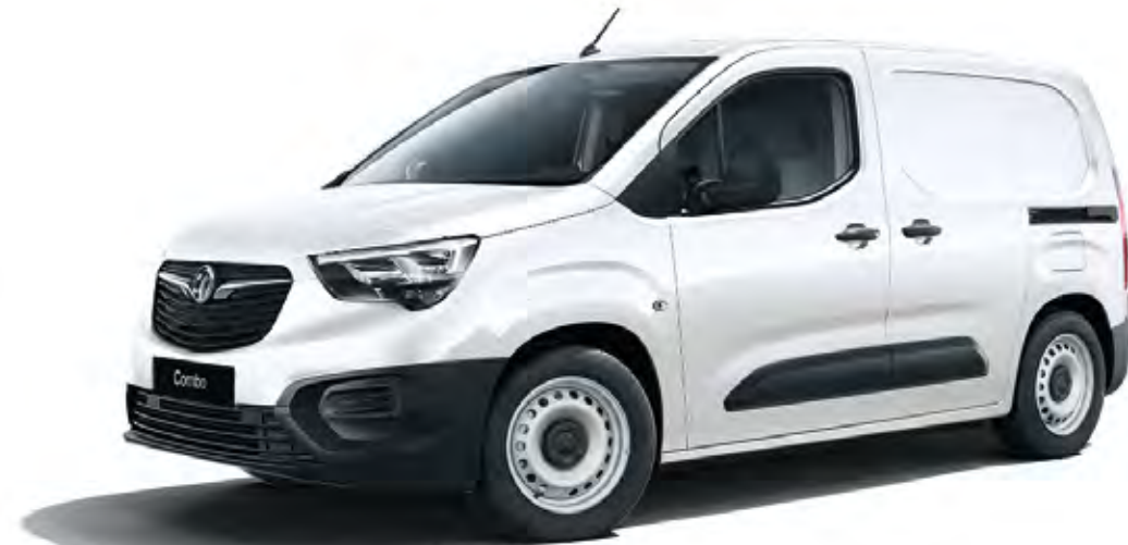
Jade White (G20)* Solid paint