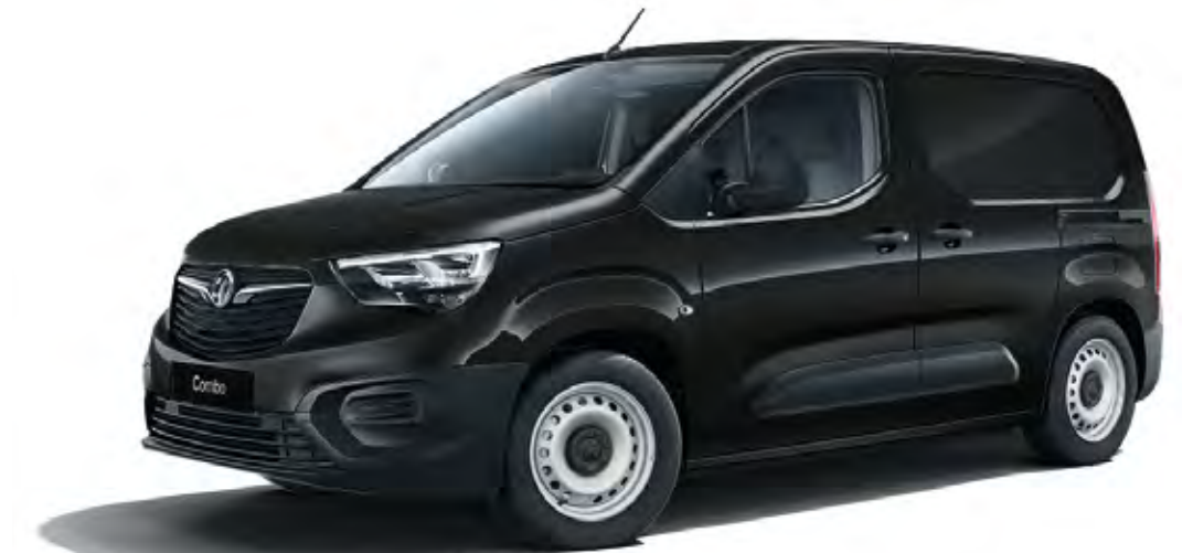
Pearl Black (G70)** Two-coat metallic paint £475