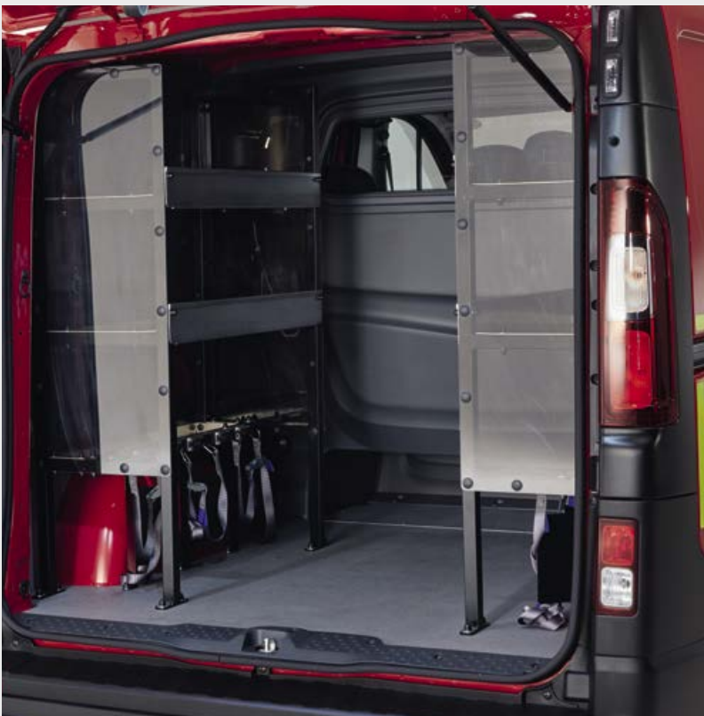
Bespoke racking with cylinder storage.