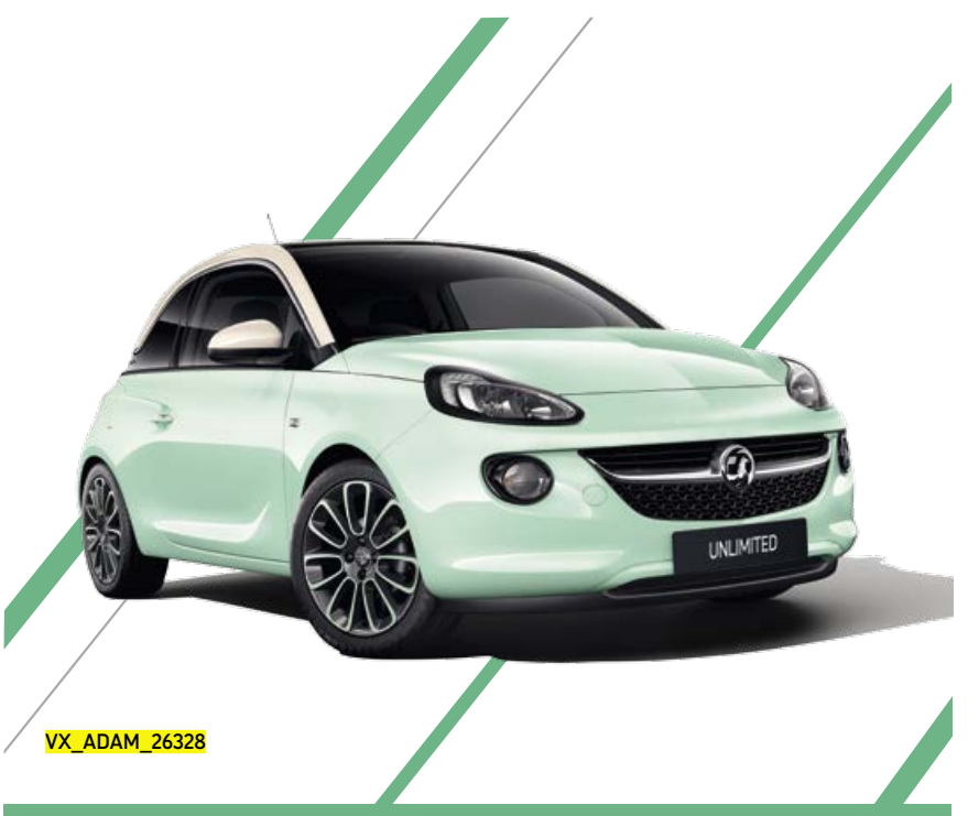
ADAM UNLIMITED 22