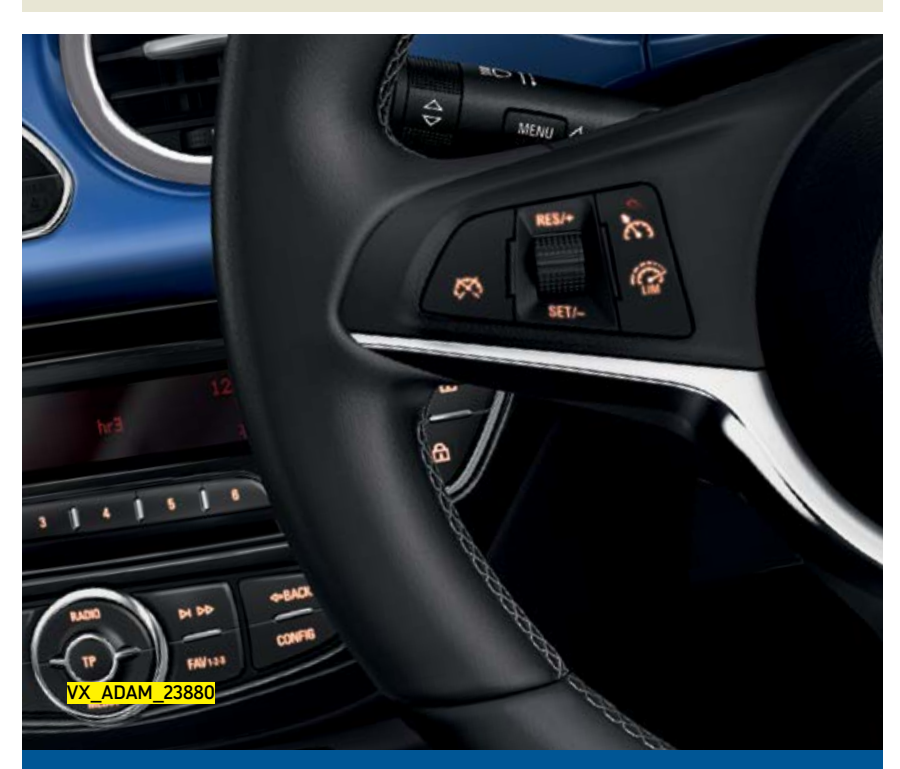
28 ADAM INNOVATIONS