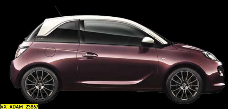
VX_ADAM_23867 Purple Fiction two-coat pearlescent paint is also optional at extra cost.