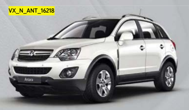
Summit White – Brilliant

Show your true colours. Antara is available in a carefully selected range of paint and interior finishes.