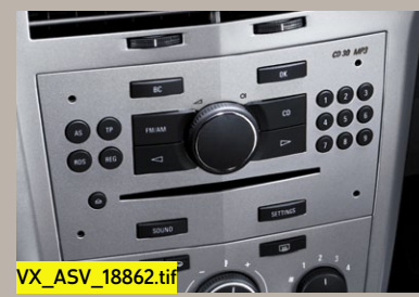
CD/MP3 CD player/stereo radio A high quality audio unit featuring 17 watts per channel is standard.