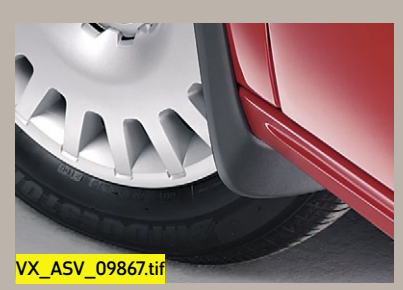
Mudflaps Tailor-made rubber mudflaps protect your vehicle from salt and road grit. Set of four.