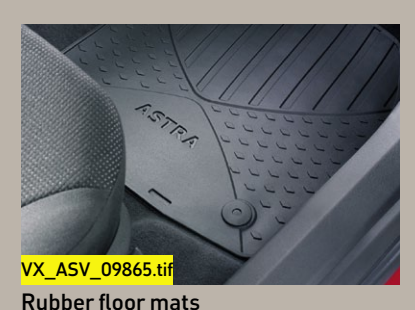
Protect your interior from everyday wear and tear, with secure fixings and an anti-slip underside.