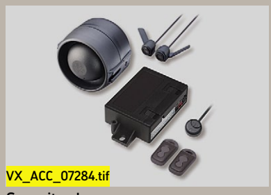
Security alarm Remote control ultrasonic security alarm system ensures high levels of protection for your van and its cargo.