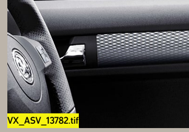
Sportive interior details Maze chrome-effect inserts on doors and facia give Sportive models further visual appeal.

Sportive models feature Silver Alpha cloth seat trim with matt chrome-effect centre console. Model illustrated features Interior Pack, optional at extra cost.