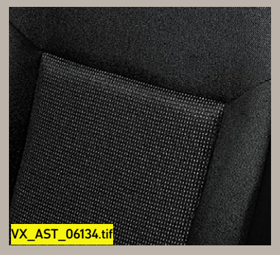
{\bf Alpha\ cloth\ trim}.