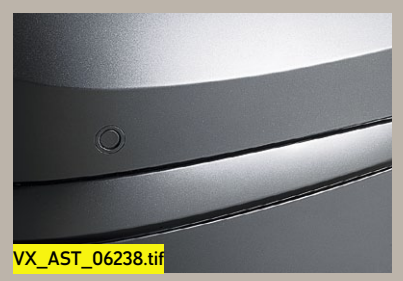
Rear parking distance sensor Activated as you select reverse. Beeps faster the closer you get to an obstruction.

Optional Flex bulkhead with fold-flat passenger seat extends maximum load floor length from 1.82 to 2.68 metres.