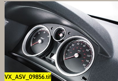
Sportive details Sportive models feature matt chromeeffect edging on instruments.