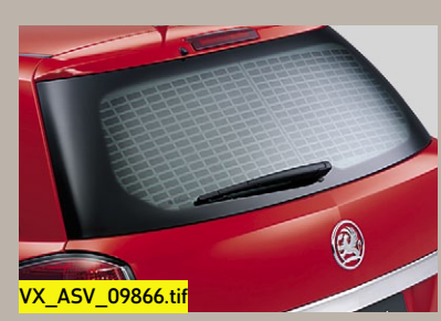
Rear window grille Perforated sheet metal/mesh grille provides a strong physical barrier and a highly visible deterrent to thieves.