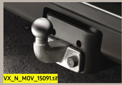
Fixed tow bar 12N This strong and high quality towing hitch expands the versatility and flexibility of your Astravan.

Genuine Vauxhall Accessories are the right choice for your Astravan. The list below is just a small sample of the range available. For a full list, please refer to the Vauxhall Commercial Vehicle Price Guide, or check out our website at: www.vauxhall.co.uk/accessories