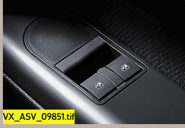
Electrically operated windows With safety autoreverse and one-touch facility as standard.

The spacious and comfortable Club interior is trimmed in hardwearing Alpha cloth. Model illustrated features air conditioning and Interior Pack, optional at extra cost.