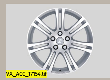
Irmscher alloy wheels Why not personalise your Astravan with a choice of 16-, 18- or 19-inch alloy wheels available in a variety of designs.