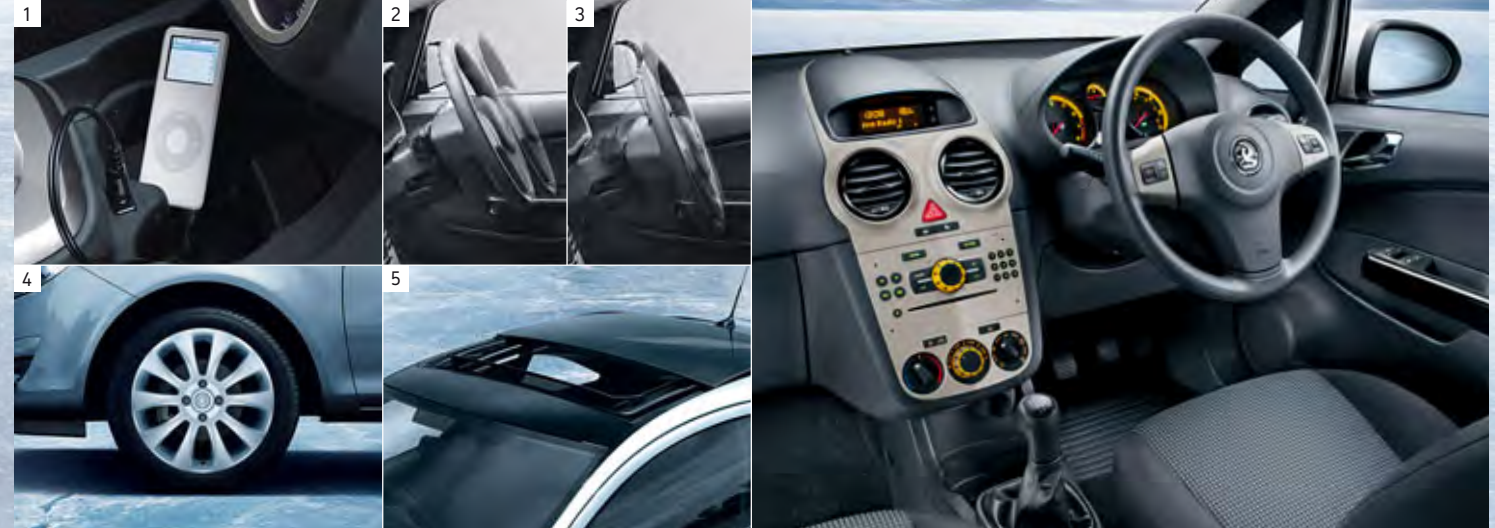
5-door model illustrated left features an electrically operated sliding glass sunroof, optional at extra cost.