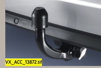
Detachable tow bar Comes complete with 12N electrics and is easily mounted and detached allowing you to take to the road effortlessly.