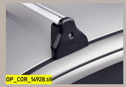
Base carrier Our roof rack system begins with this base carrier, comprising two T-track bars. Compatible with a range of Thule attachments.

Genuine Vauxhall Accessories are the right choice for your Corsavan. The list below is just a small sample of the range available. For a full list, please refer to the Vauxhall Commercial Vehicle Price Guide or check out our website at: www.vauxhall.co.uk/accessories