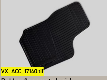
Rubber floor mats (pair) To protect your interior from everyday wear and tear. All come with secure fixings and an anti-slip underside.