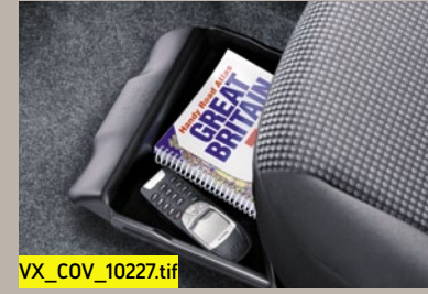
In-cab stowage In-cab stowage features include a passenger's underseat storage tray.

Corsavan models are distinguished by a matt chrome-effect centre console. Model illustrated features air conditioning and passenger's airbag, both optional at extra cost.