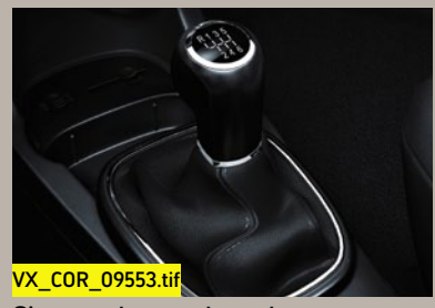
Six-speed manual gearbox Sportive models feature a smooth six-speed manual gearbox as standard.

Piano black centre console and sports instruments add an extra touch of style to the Sportive interior. Model illustrated features passenger's airbag, optional at extra cost.