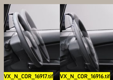
Reach and rake-adjustable steering Enables operators to achieve the ideal driving position.