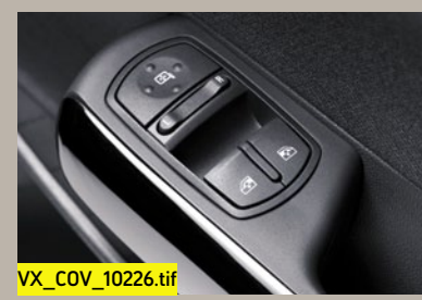
Electrically adjustable door mirrors Body-colour and fitted as standard. Electric windows are optional at extra cost.