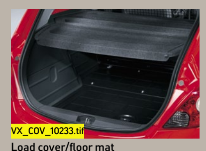
Four-piece load compartment cover hides contents from prying eyes whilst a fitted rubber floor mat safeguards the cargo area.