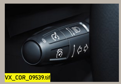
Cruise control* Allows you to maintain a steady speed and keep to the speed limit.