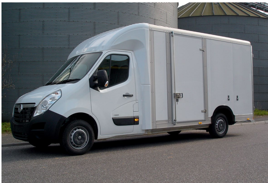
L3 H1 platform cab, standard roof, low floor Luton body.

Standard features include: Double rear doors opening to 270 degrees (other options available); anti-slip plywood floor, opalescent glass fibre roof panel for improved internal visibility; interior lamp; strong bulkhead giving cab security with soft trim on driver's side to reduce noise levels. All this can be driven with a standard category B driving licence, and with no need for an 'Operator's Licence'. The standard roof, low floor Luton van has a loadspace volume of 18.5cu.m (653cu.ft.) and payloads up to 1295kg.