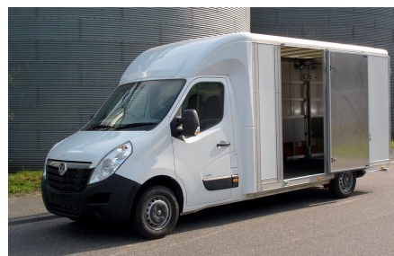
Side-access doors optional at extra cost.