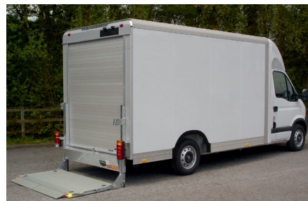
Tail lift optional at extra cost.