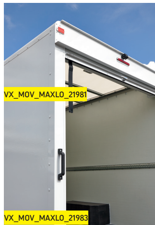
Rear access grab handle.