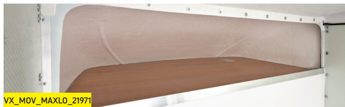
Useful over-cab storage facility.