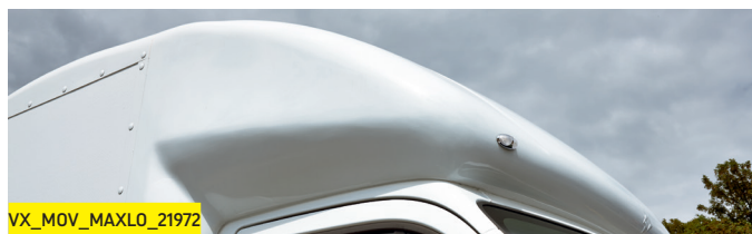
Aerodynamic canopy aids fuel economy.