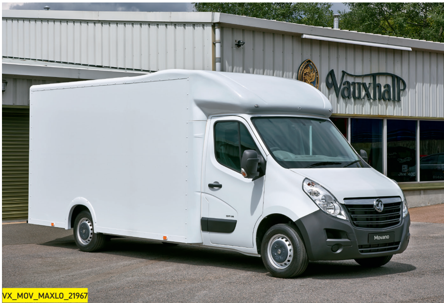
L3 H1 Maxi-Low Luton Van.

In addition to the standard Luton Van, Maxi-Low will also offer a walk-through multi-drop variant designed for parcel delivery and a larger Jumbo Luton Van with capacity of 26.0cu.m (918cu.ft).