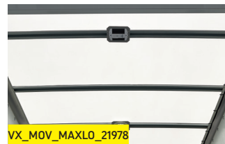
Opaque glass-fibre roof panel with load area light.