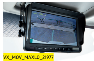
Optional rear-view camera.