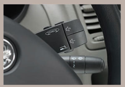
Steering column audio controls Standard on all Vivaro dropside models, enabling you to operate audio functions.

While a selection of practical options help you tailor your vehicle to your own individual needs.