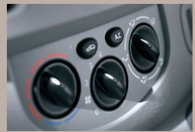
Optional air conditioning Helps maintain a constant temperature and helps clear windscreen of condensation in seconds.