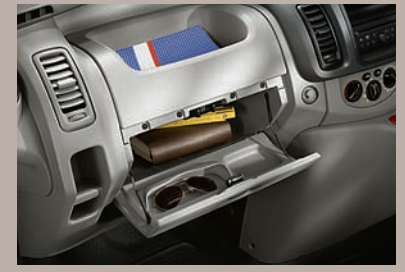
Improved storage A moulded recess above the glovebox creates additional storage space.