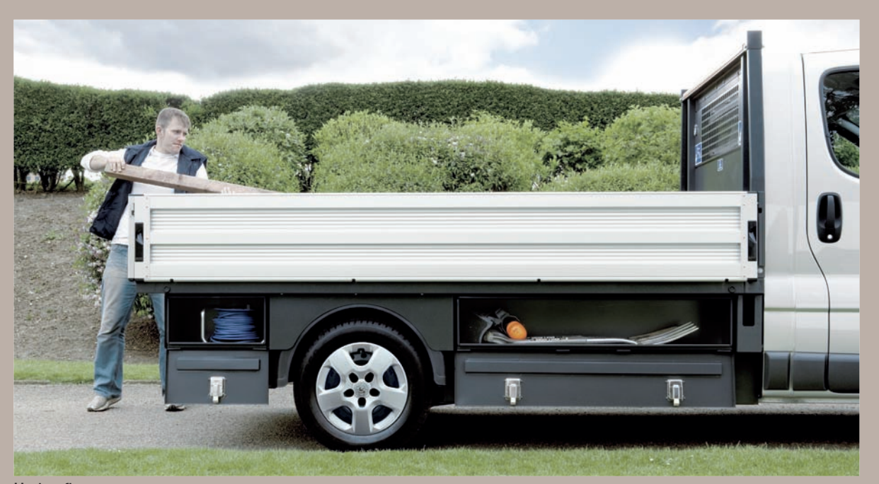
Under-floor compartments Five separate lockable under-floor load compartments provide safe and secure storage.

While lockable under-load floor storage compartments on both sides of the vehicle provide a total of 921 litres of concealed – and weatherproof – stowage.