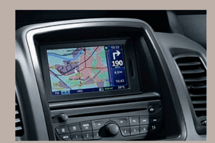
Satellite navigation Optional TomTom-based system features a useful remote control unit.