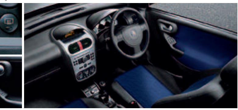
Electrically operated front windows.