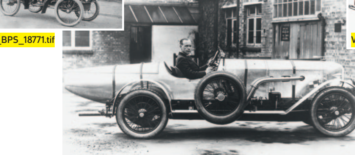
1922 - The Silver Arrow OE 30-98 was capable of speeds of over 100mph, this model was built for shipping magnate Sir Leonard Ropner to race at Brooklands.

1957 - The PA Cresta introduced Americana styling