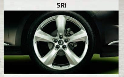
19-inch alloy wheel (extra cost option).*

*Not available on 1.4i.16v VVT, 1.3CDTi.16v or 2.0CDTi.16v automatic models. **Not available on 1.3CDTi.16v or 2.0CDTi.16v