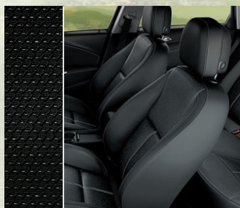
Lace cloth – ergonomic sport seat Optional at extra cost on: Exclusiv/SRi/SE models.