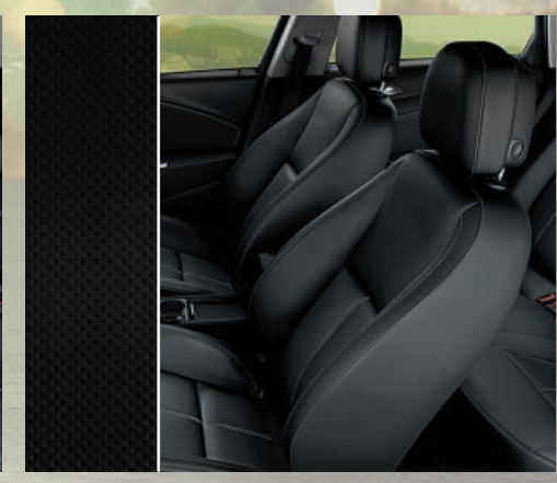
Leather – ergonomic sport seat Optional at extra cost on SRi models as part of Leather Pack.