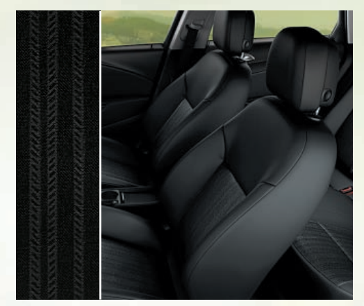
Cordoba cloth Standard on: ES models.