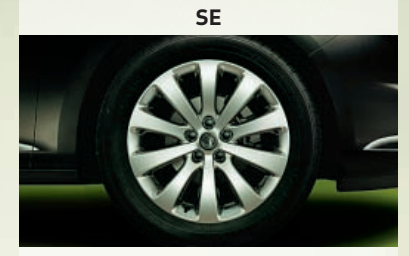
17-inch alloy wheel.