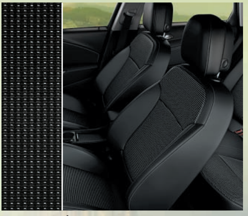
Ribbon cloth/Morrocana Standard on: SE models.