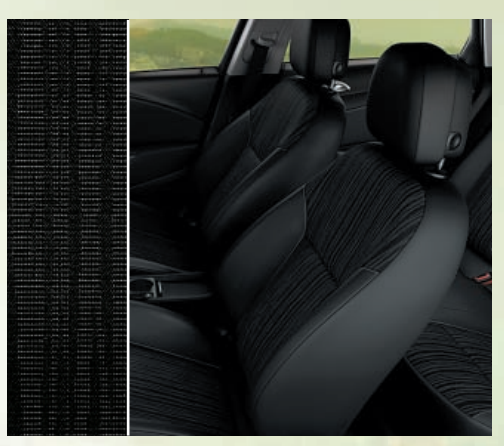
Scene cloth Standard on: Exclusiv models.