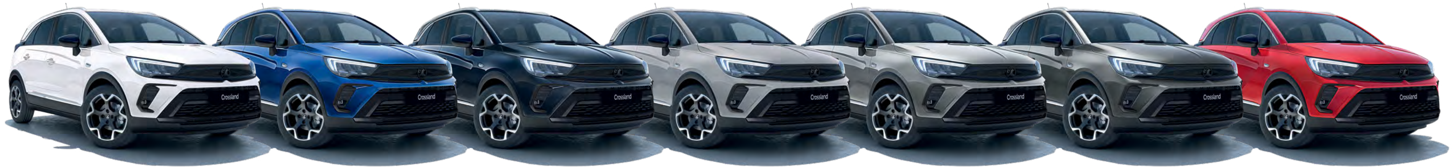
Jade White Brilliant*