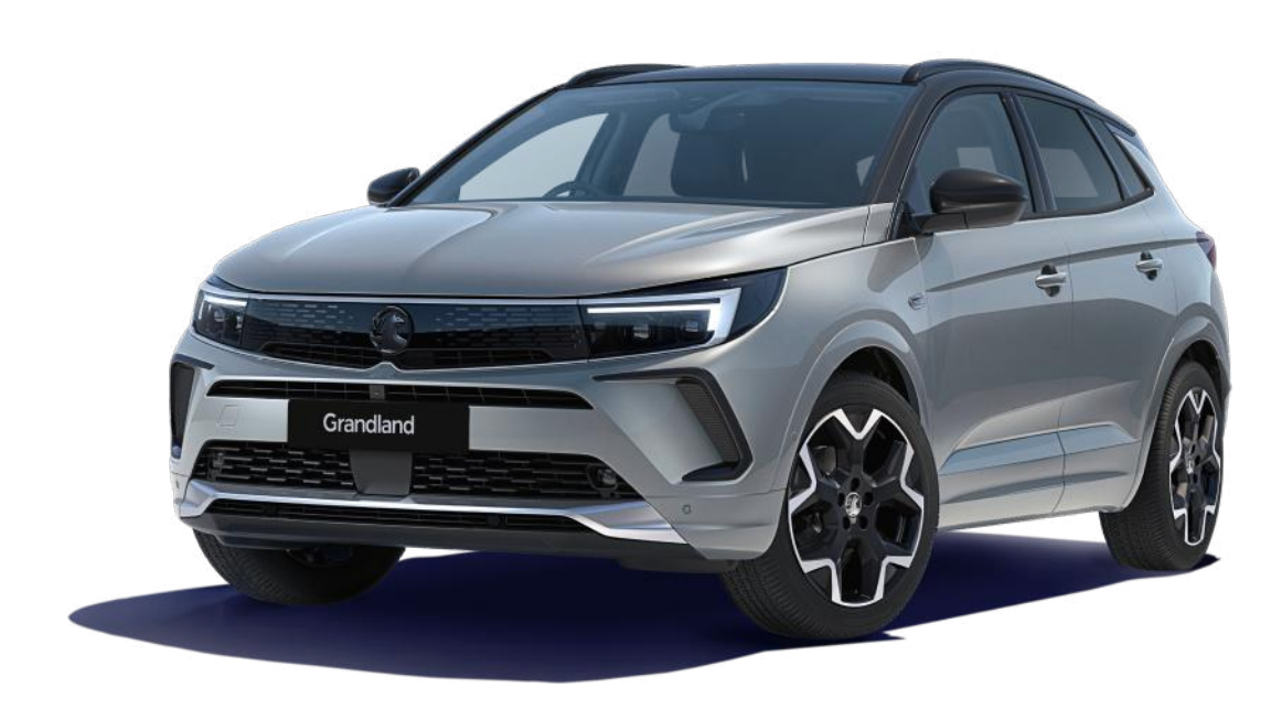
Contrast Grey (OMMO/ONF4)** Two-coat metallic paint £600