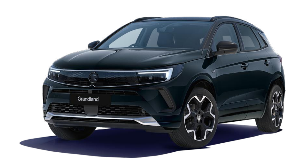
Carbon Black (OMMO/ON9V)** Two-coat metallic paint £600