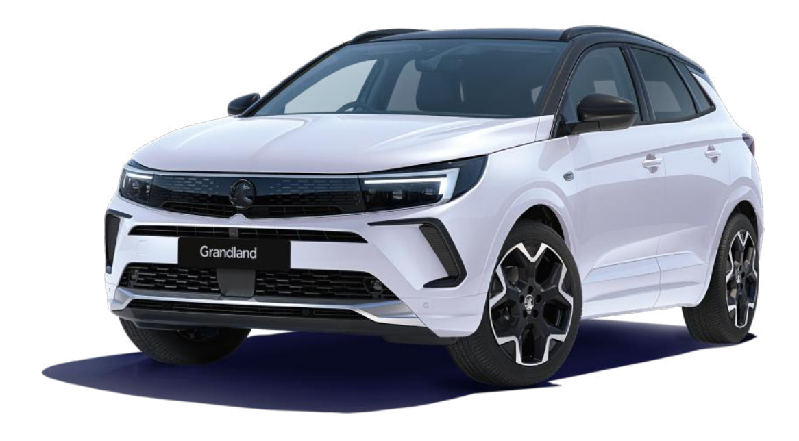
Arctic White (OMPO/ONWP)* Brilliant paint