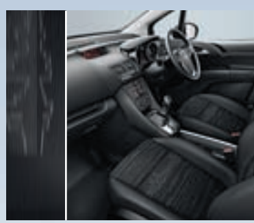
Skyline cloth – Black Standard on Exclusiv models.