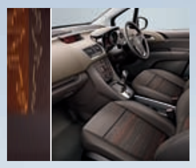
Skyline cloth – Orange<sup>†</sup> Optional at no cost on Exclusiv models.

**Not available on Technical Grey, Silver Lake, Pepperdust and Oriental Blue.