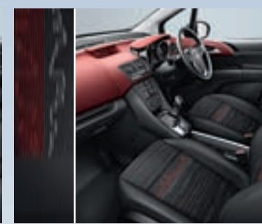
Skyline cloth – Red** Optional at no cost on Exclusiv models.