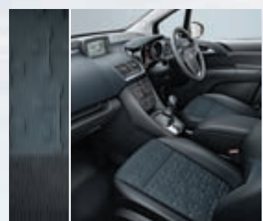
Astor cloth/Morrocana – Black Standard on SE models.