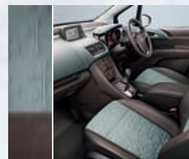
Astor cloth/Morrocana – Cocoa<sup>††</sup> Optional at no cost on SE models.