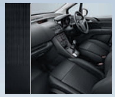
Pepe cloth – Black Standard on Expression/S models.