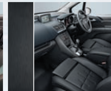
Astor Leather – Black Optional at extra cost on SE models.

ttNot available on Flame Red, Technical Grey, Oriental Blue and Black Sapphire.