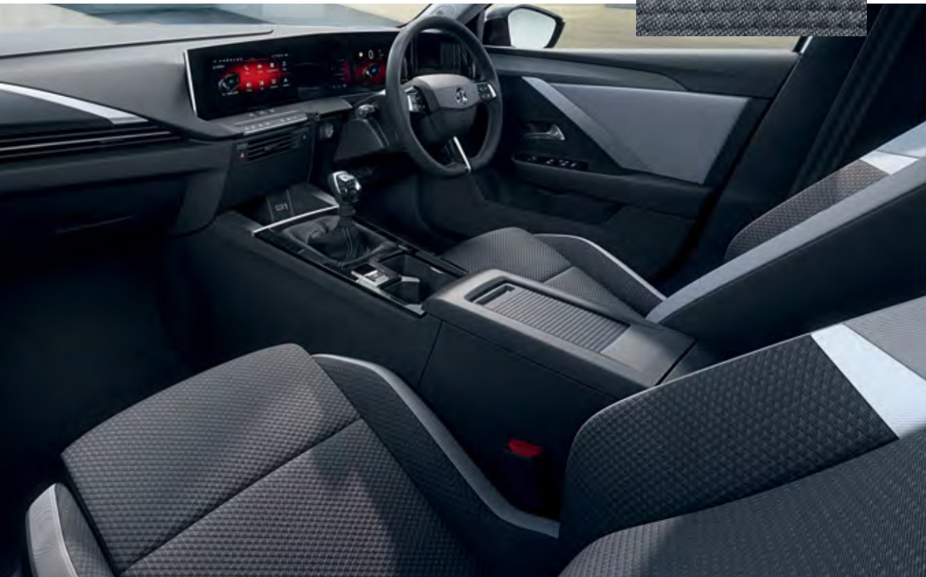
Design Modene cloth trim

We've made it simple to choose the interior that's right for you, with every model featuring a different interior trim. From classic cloth to Alcantara and Leather* with stylish interior accents and design touches.