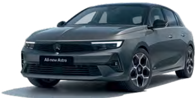
Vulcan Grey Two-coat metallic paint