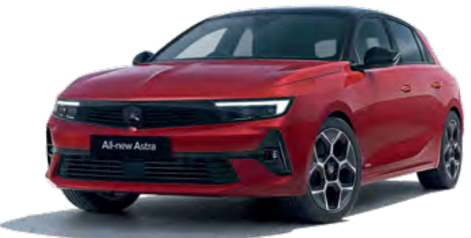
Crimson Red Two-coat premium metallic paint