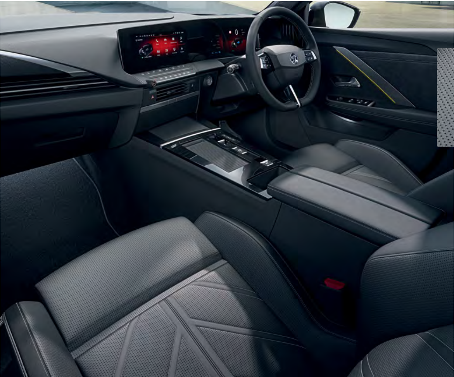
Ultimate Leather trim

We've made it simple to choose the interior that's right for you, with every model featuring a different interior trim. From classic cloth to Alcantara and Leather* with stylish interior accents and design touches.