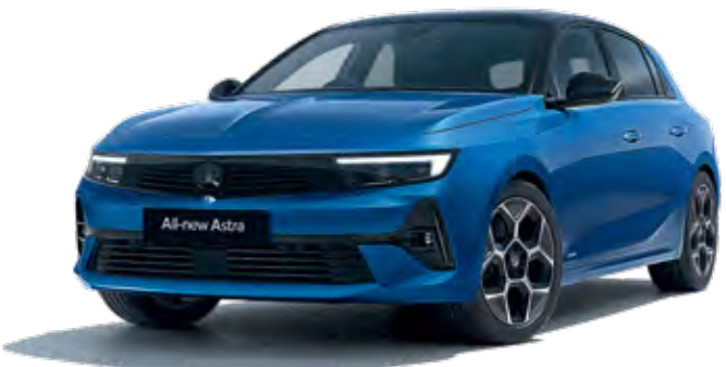
Cobalt Blue Tri-coat premium metallic paint