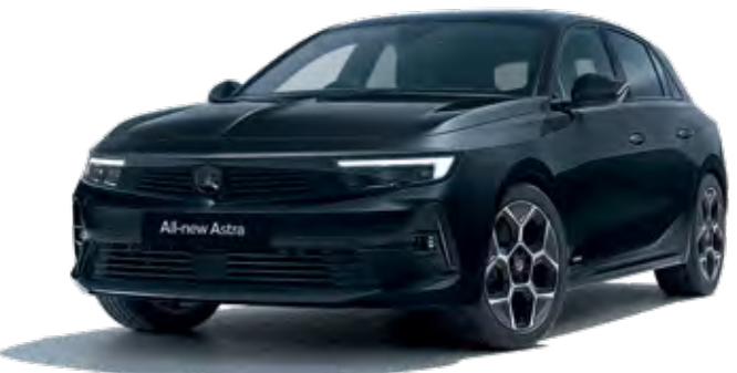
Carbon Black Two-coat metallic paint