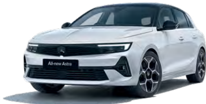
Arctic White Brilliant paint