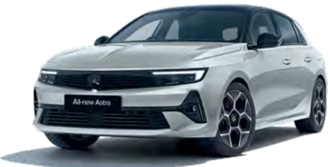
Crystal Silver Two-coat metallic paint