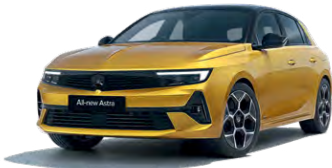
Electric Yellow Two-coat premium metallic paint