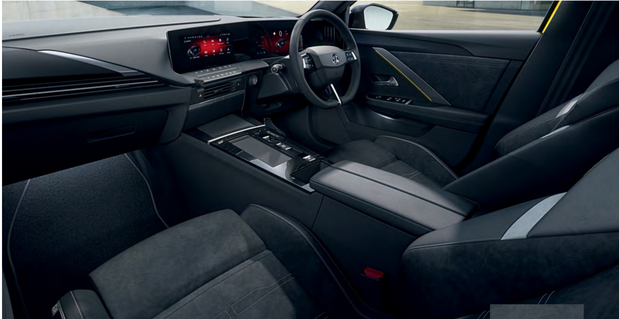
Ultimate Alcantara trim