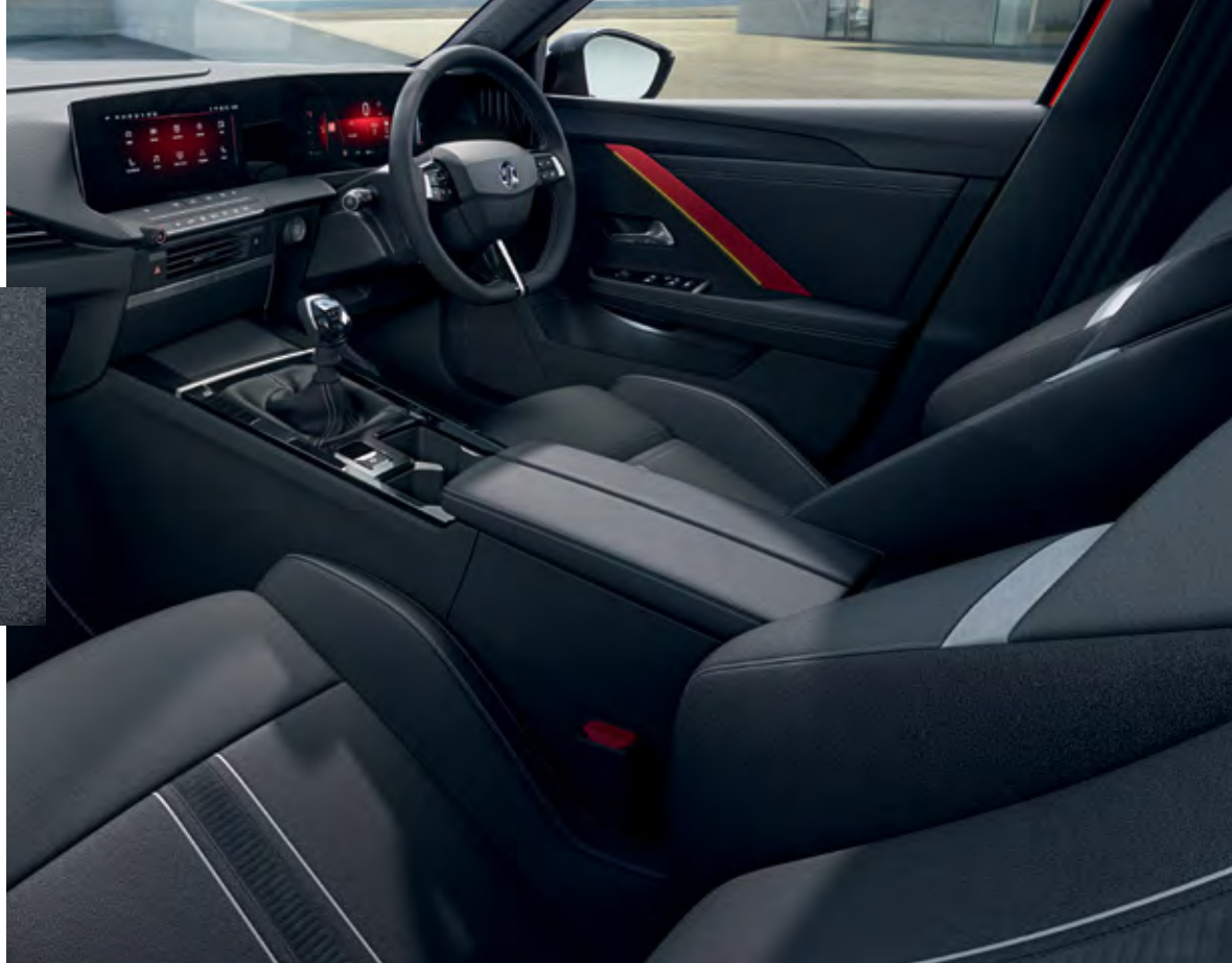
GS Line Greta cloth trim