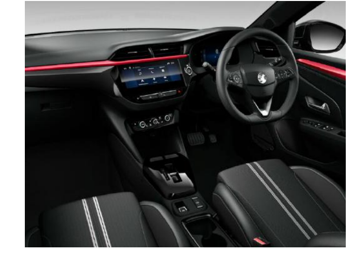
YES 2025 Electric Interior (Kiss Red Exterior and Interior)