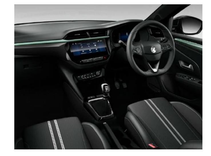
YES 2025 Petrol Interior (Eucalyptus Green Exterior and Interior)