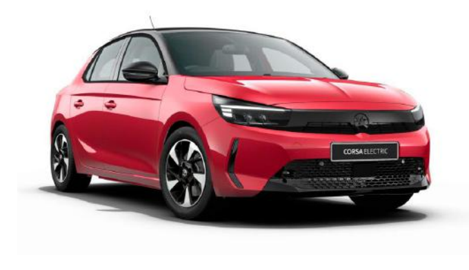
YES 2025 Electric