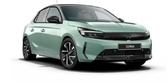
YES 2025 Petrol

colours selected on this trim (Arctic White and Carbon Black) will receive blanc banquise door inserts and standard floor mats.