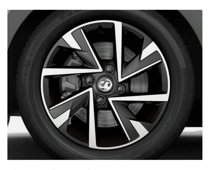
16" alloy wheel (Petrol only)