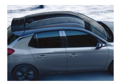
Black roof and dark-tinted rear windows