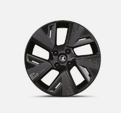
17" alloy wheel