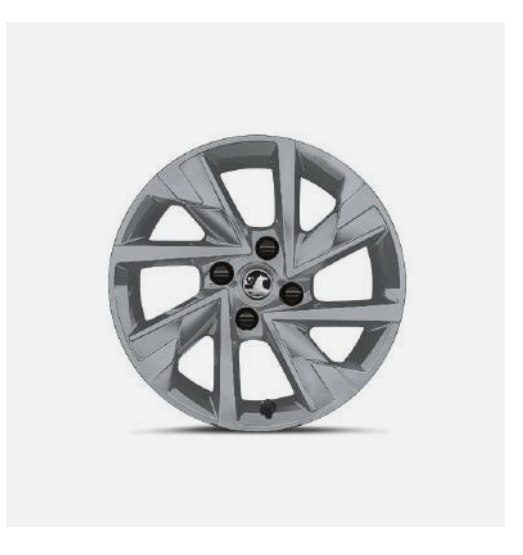
16" alloy wheel