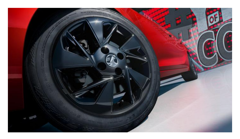
16" alloy wheel (standard on Electric models)