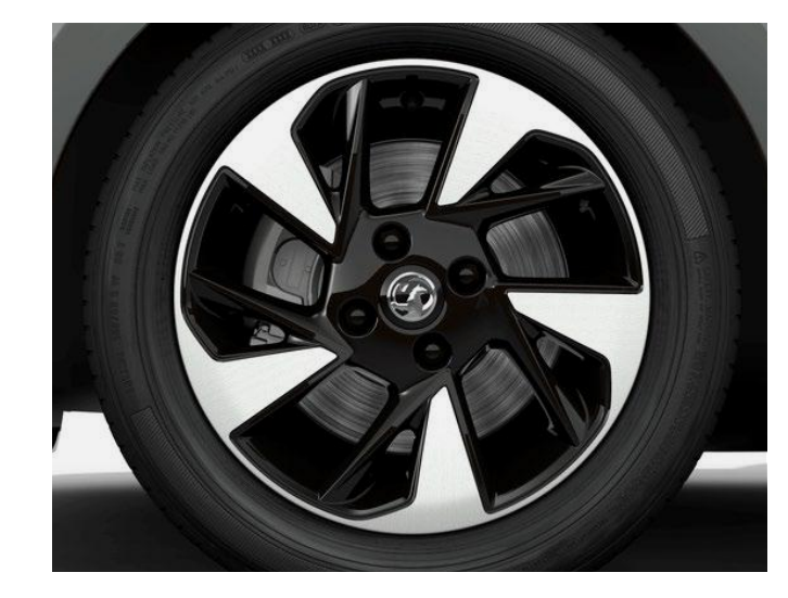
16" allov wheel (Electric only)