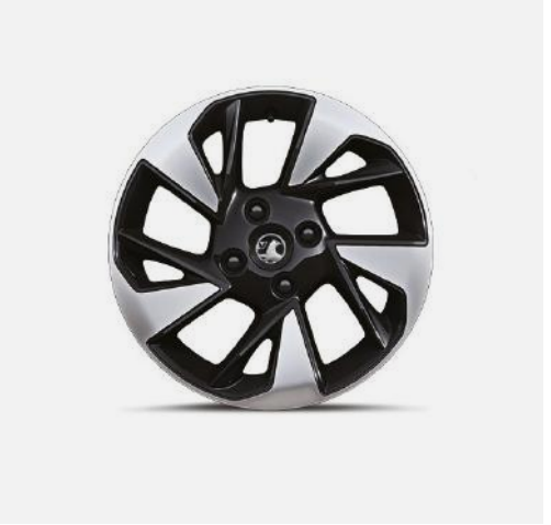
16" alloy wheel