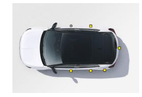
Remote control central locking