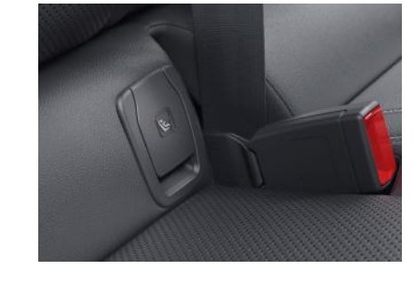
ISOFIX child seat mountings