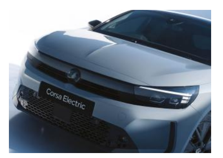
Black Griffin logo and vizor frame