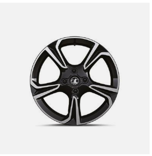
17" alloy wheel