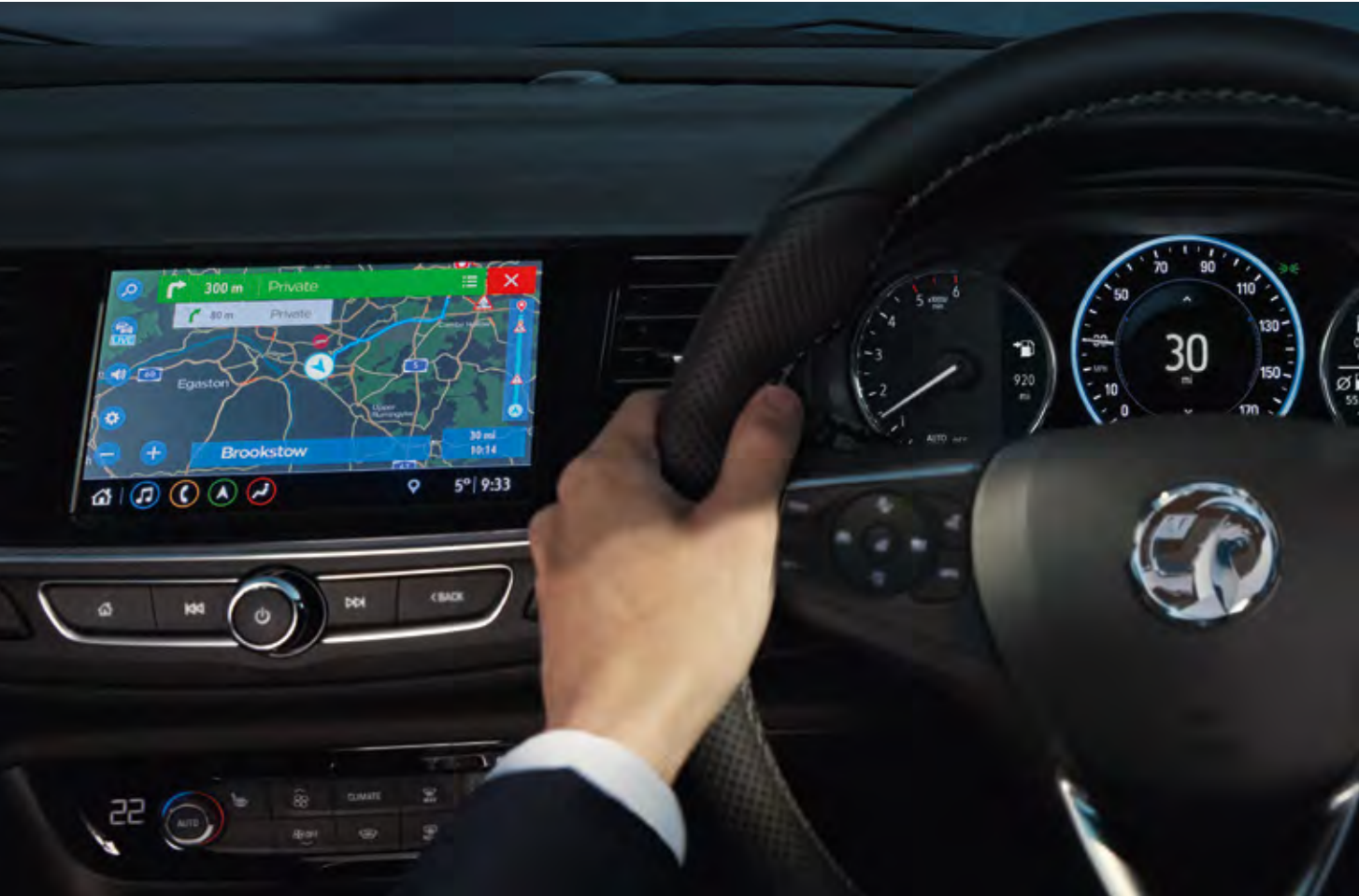
8-inch colour touchscreen and digital information display.