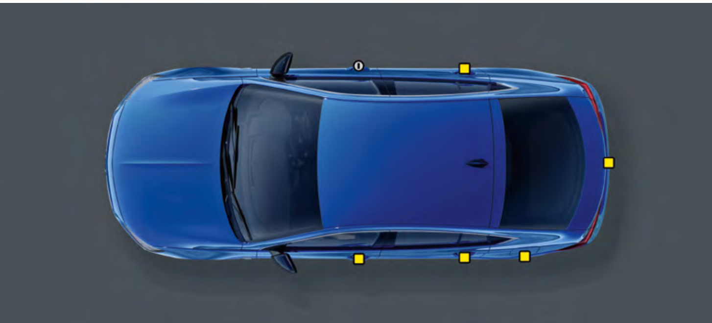
Remote control central locking.