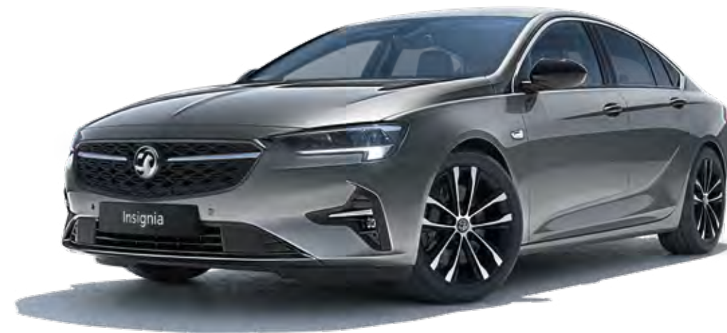
Vulcan Grey (G40)** Two-coat metallic paint £600