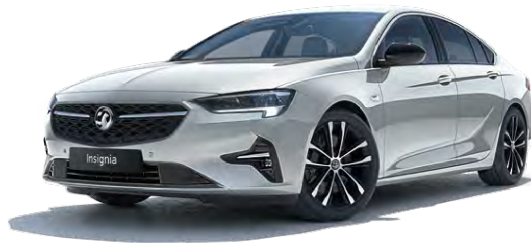
Sovereign Silver (GAN)† Two-coat metallic paint £600