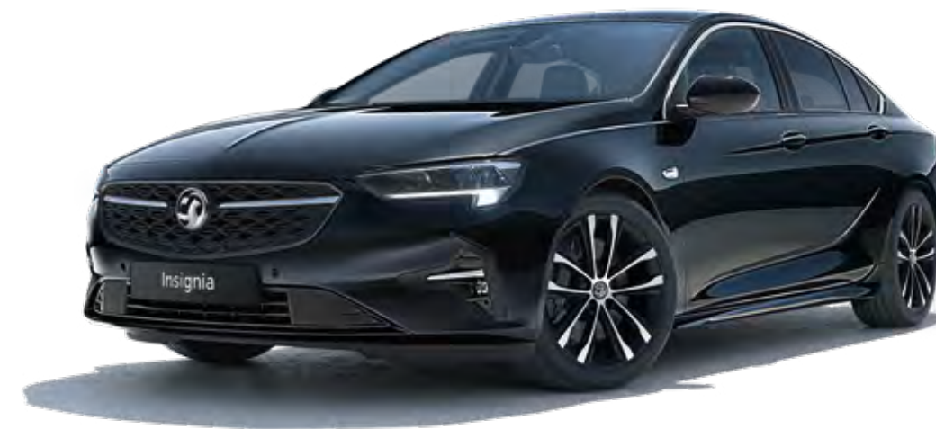
Carbon Black (G70)** Two-coat metallic paint £600