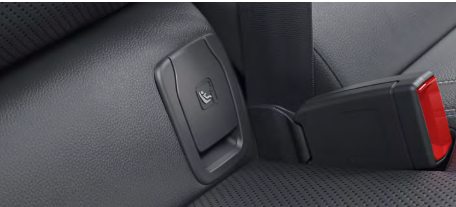
ISOFIX child seat mountings.