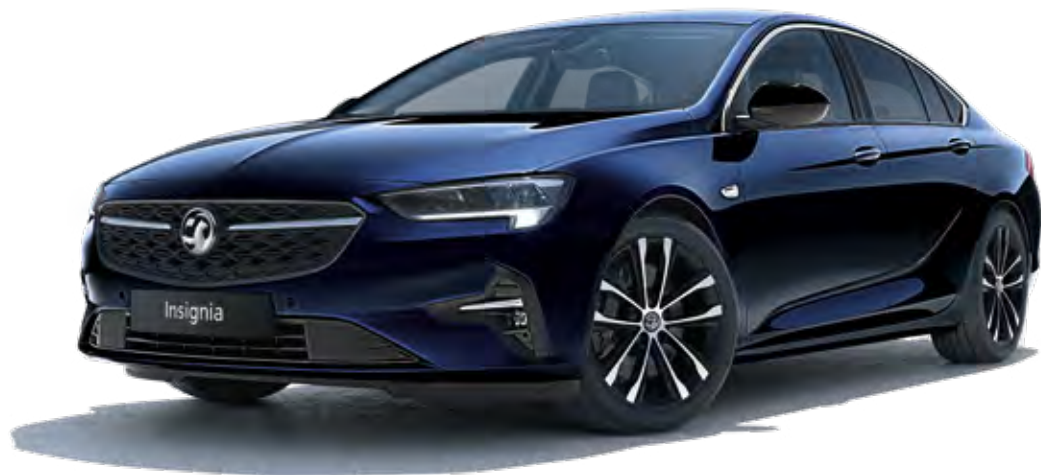
Nautic Blue (G4B)** Two-coat metallic paint £600