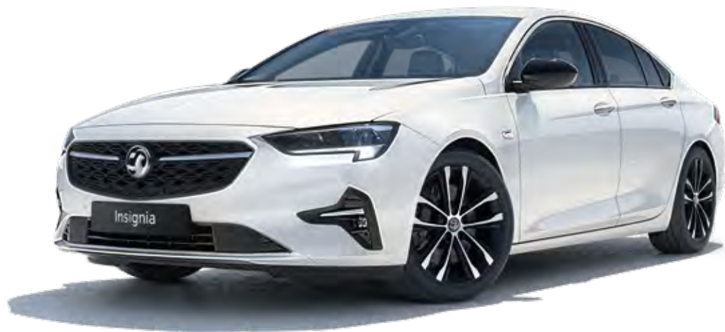
Arctic White (G2o)* Brilliant paint