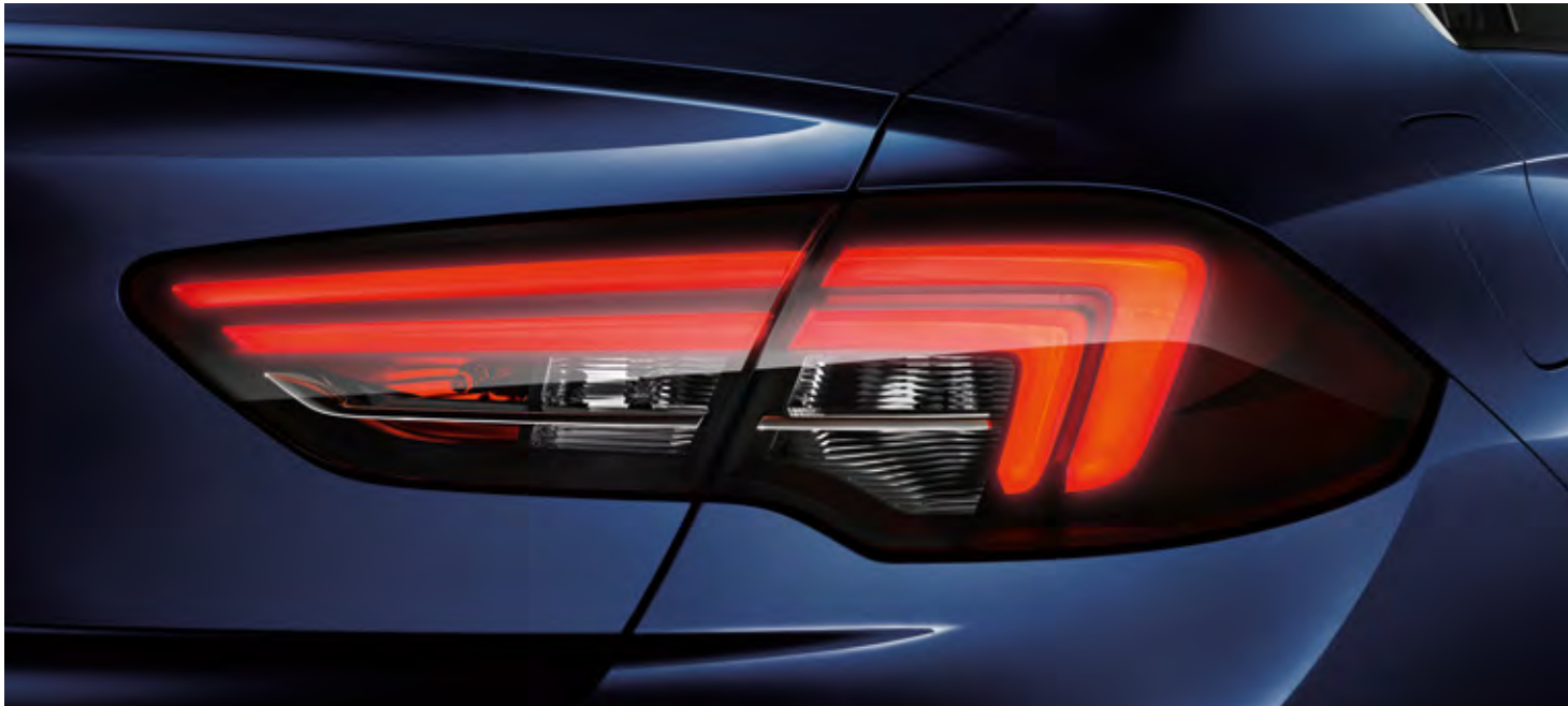
LED tail lights.