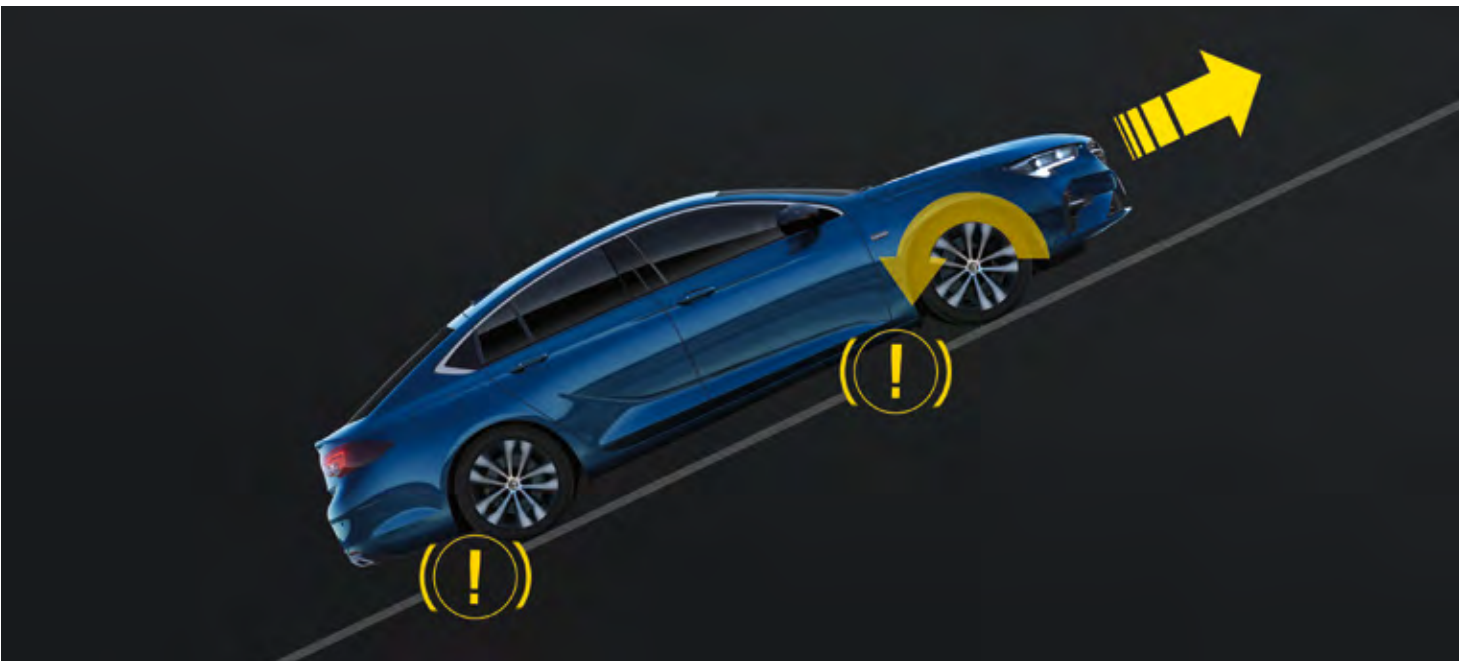
Hill start assist.