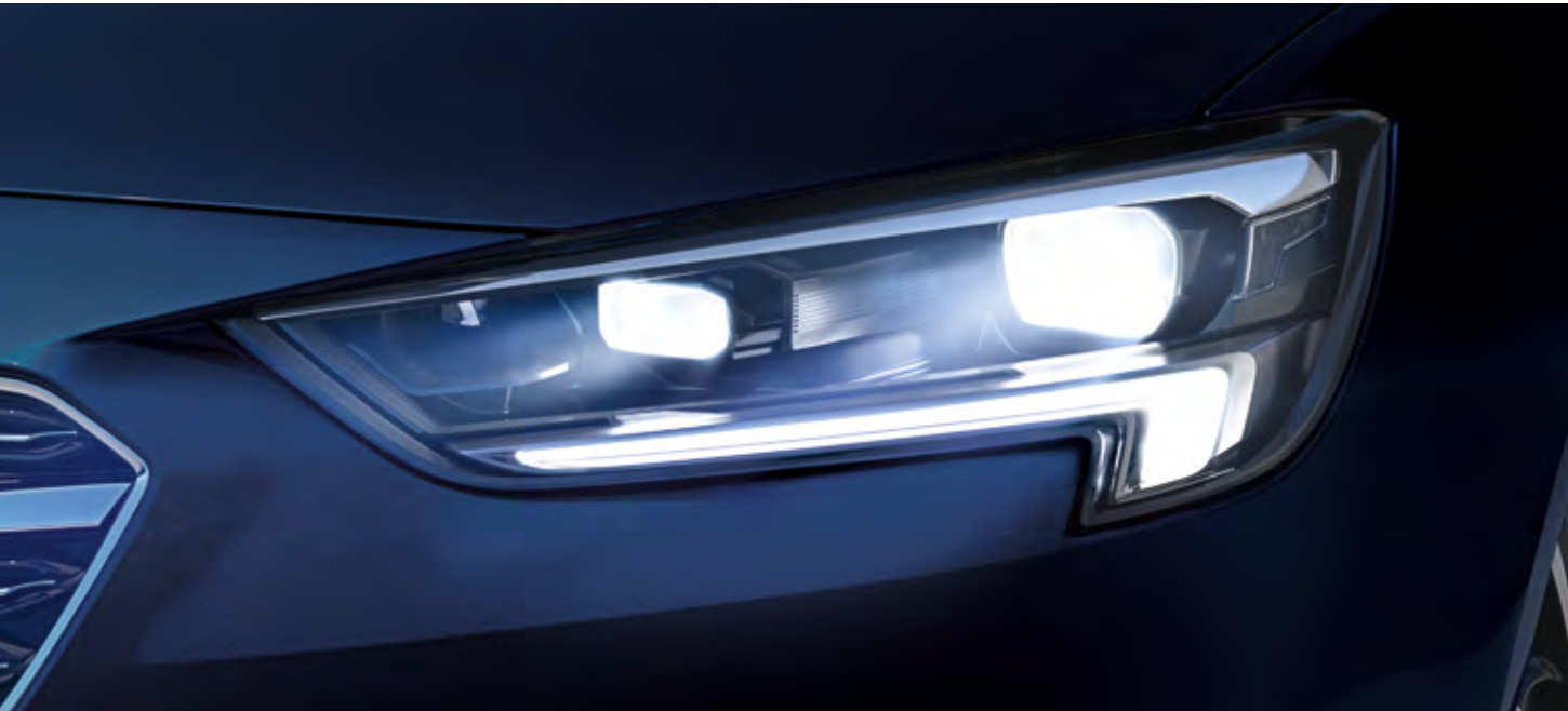
Adaptive IntelliLux LED® pixel headlights.