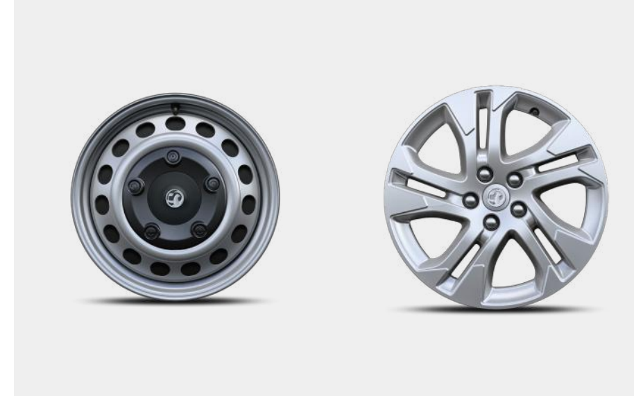
16-inch steel wheel with centre cap.