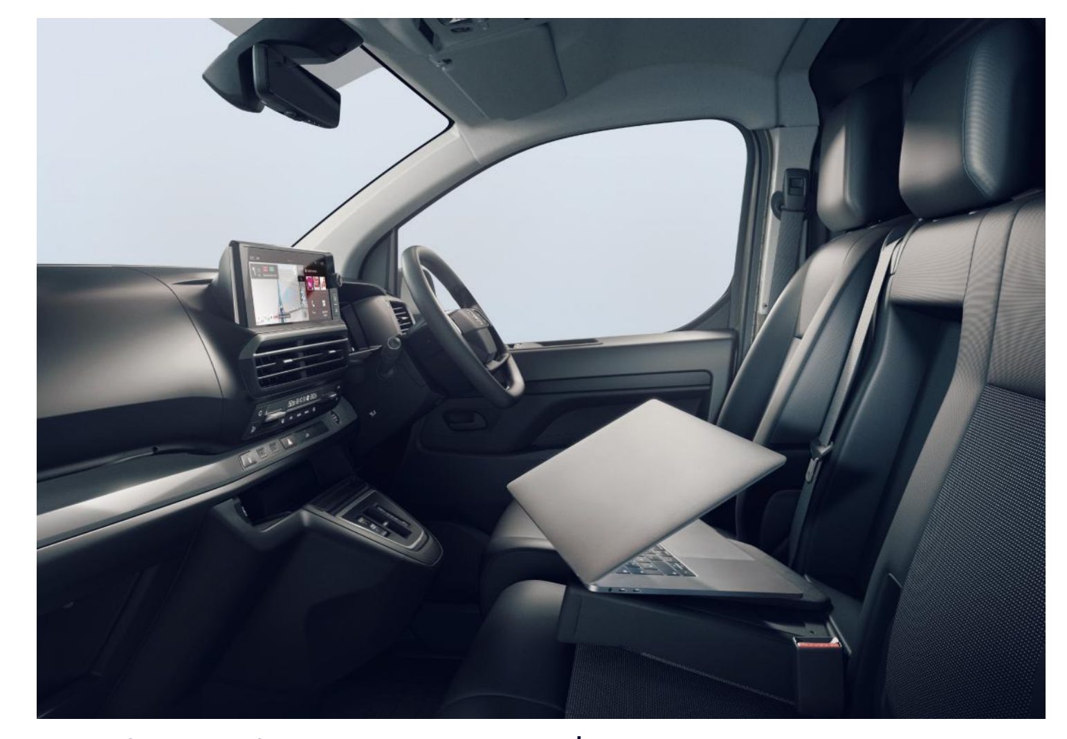
Multi-function fixed bench passenger's seat.