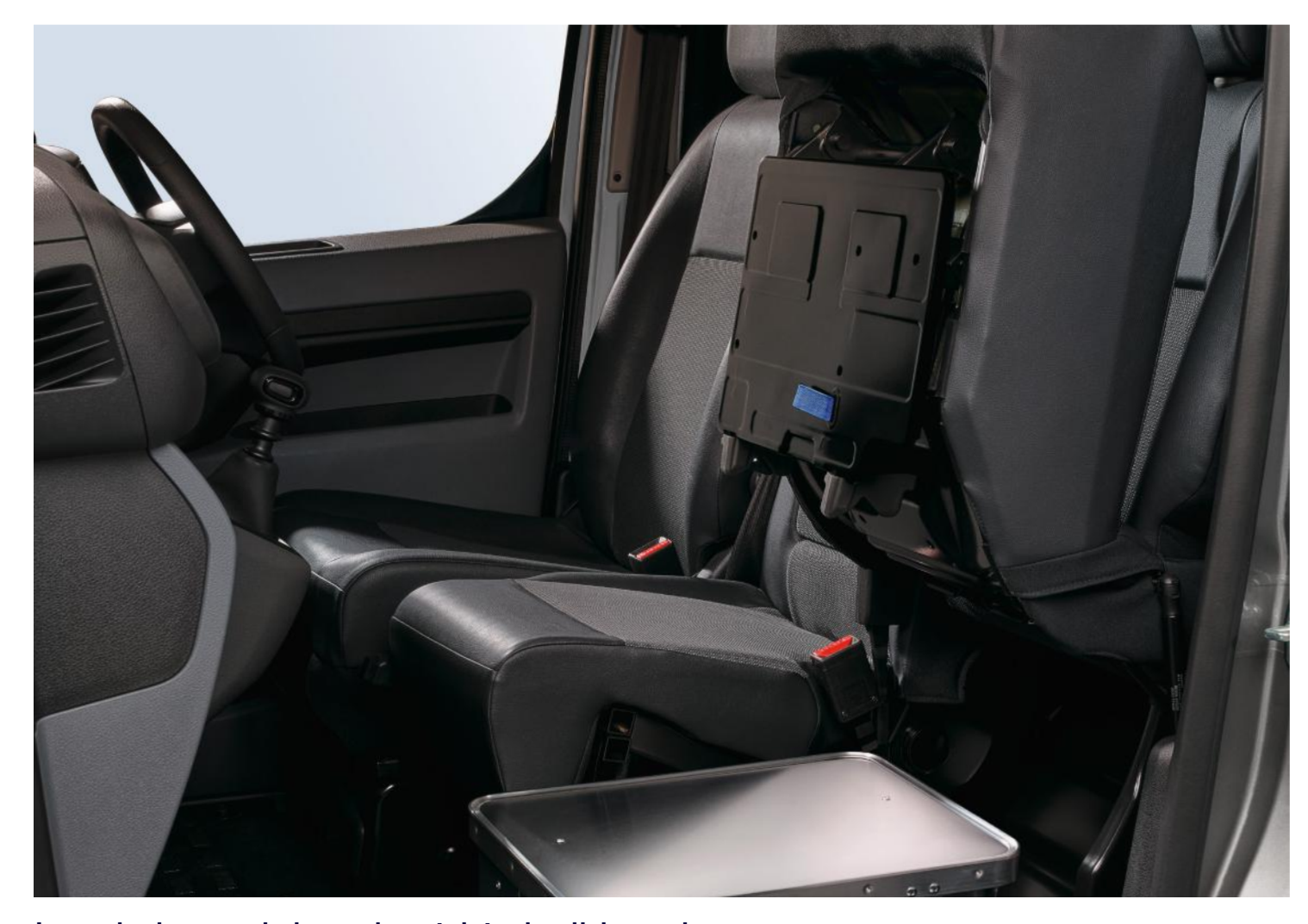
Load-through hatch within bulkhead.