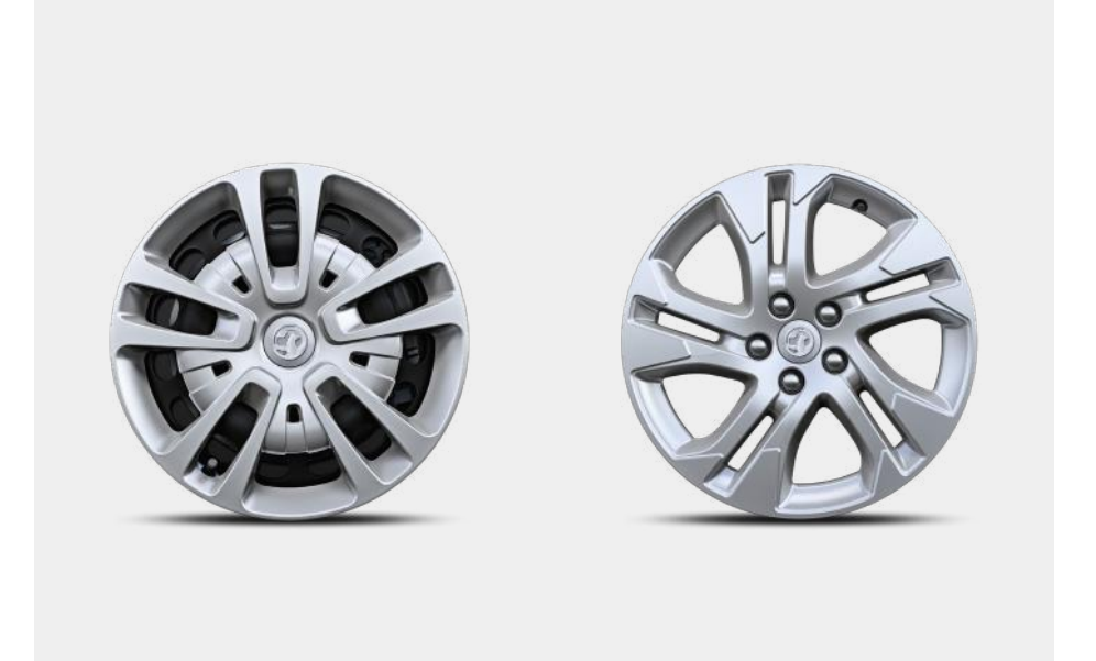
17-inch steel wheel with full-diameter wheel trim.