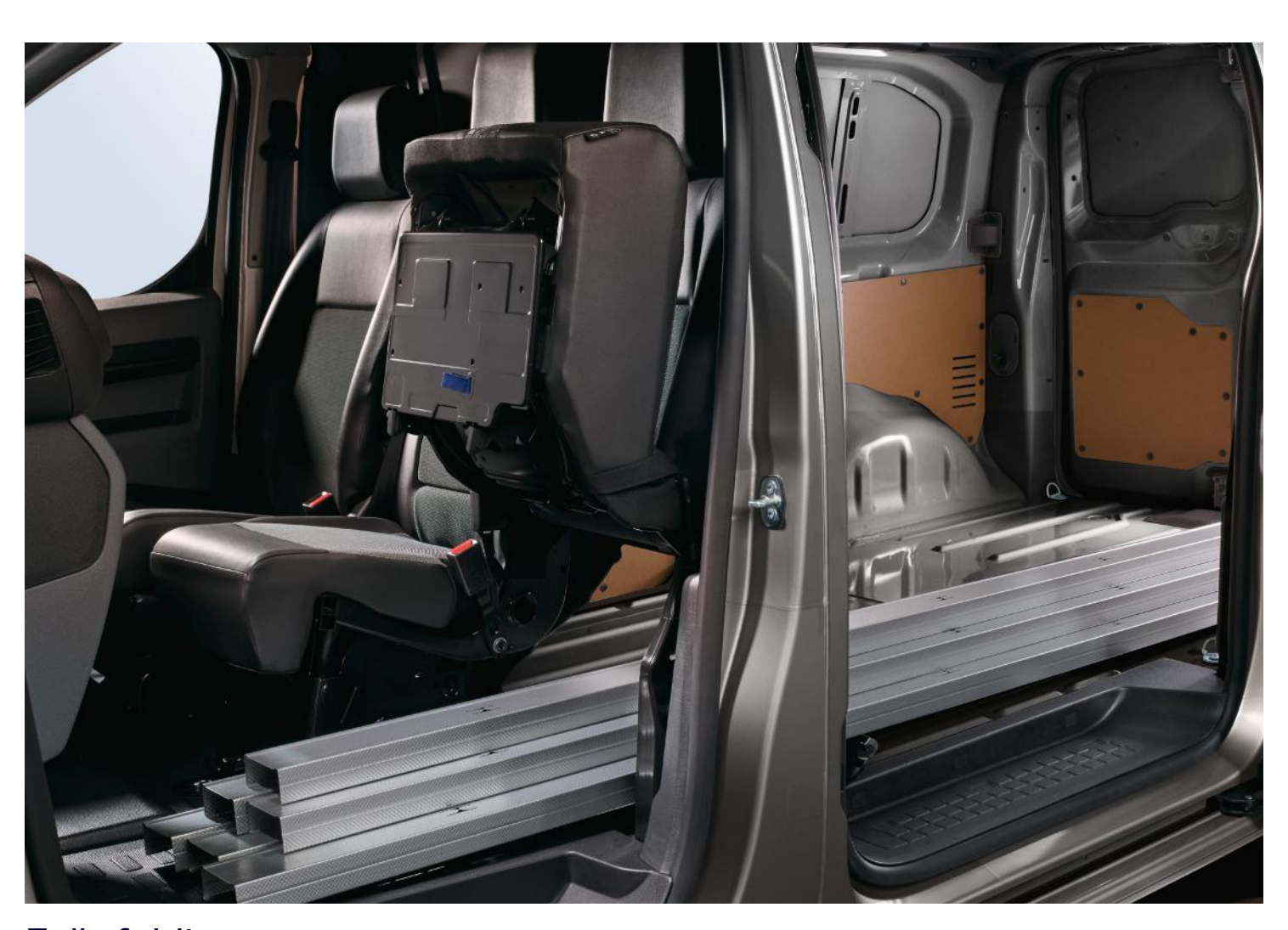
Fully folding passenger seat.