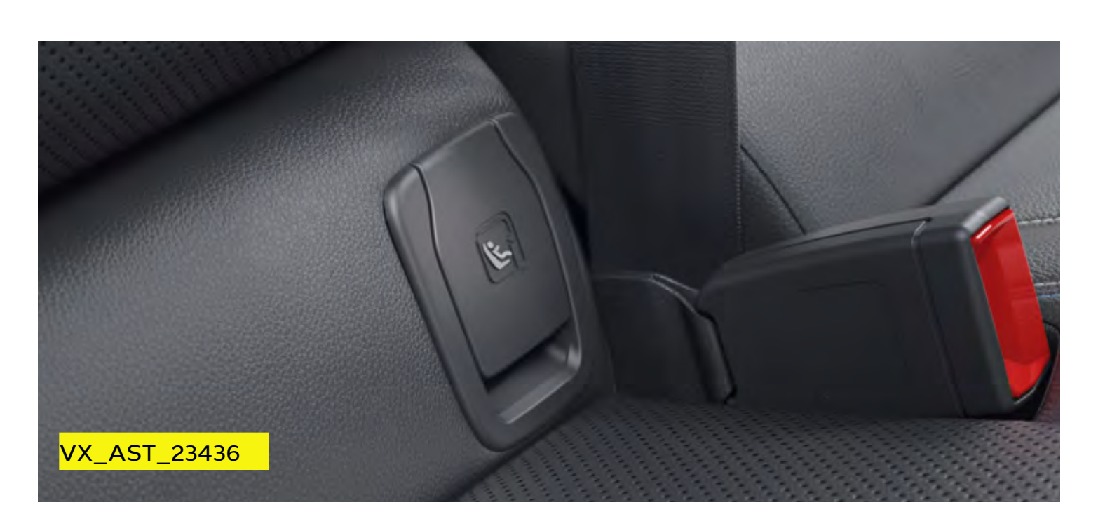
ISOFIX child seat mountings.