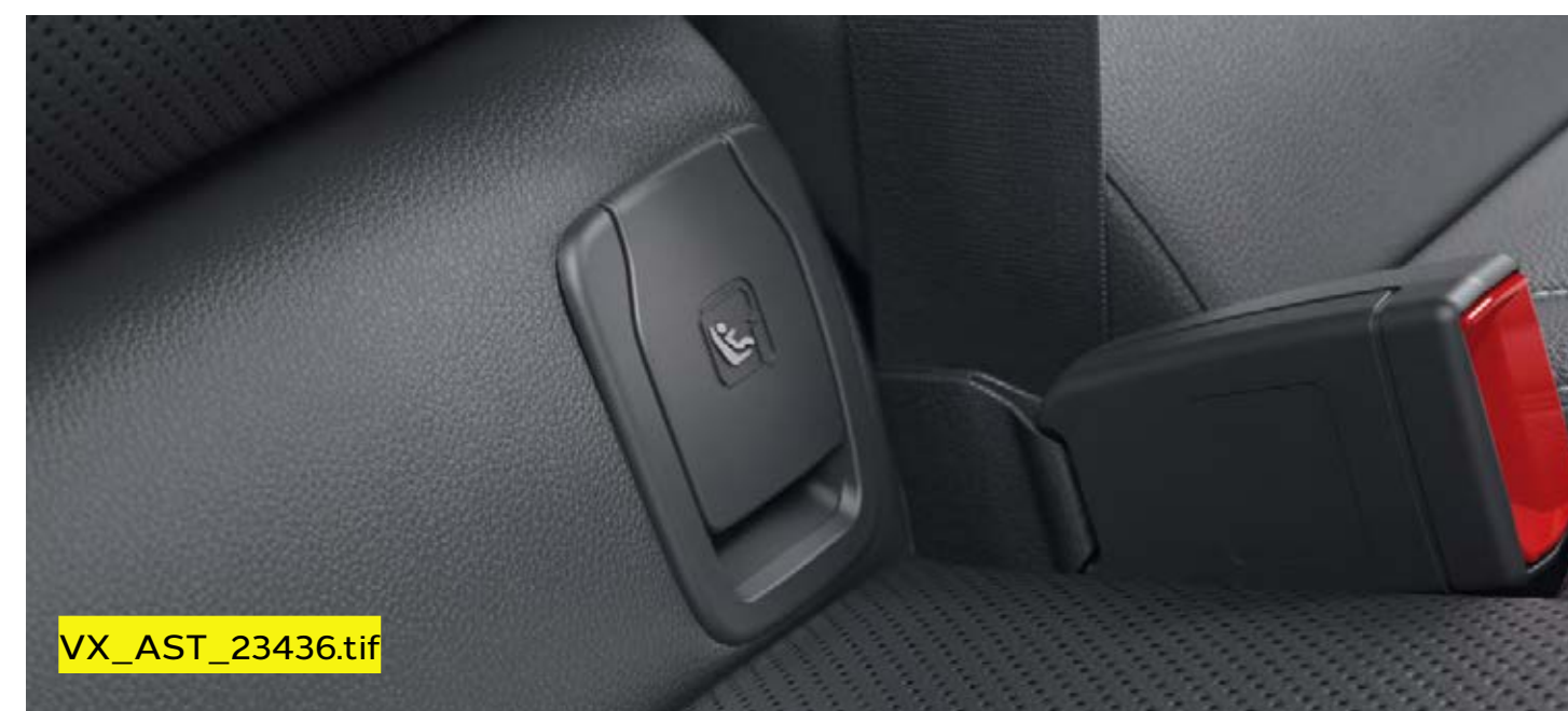
ISOFIX child seat mountings.