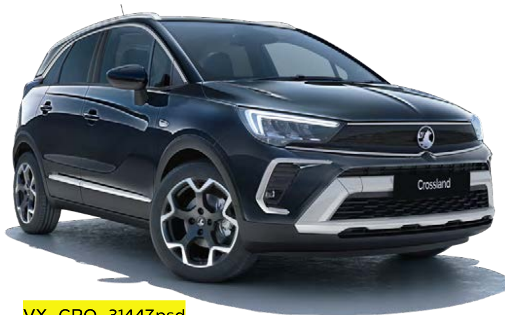
Diamond Black (G7O)** Two-coat metallic paint £550†