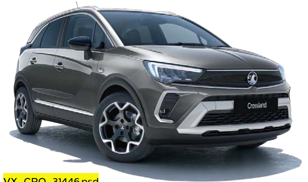
Moonstone Grey (G4O)** Two-coat metallic paint £550†