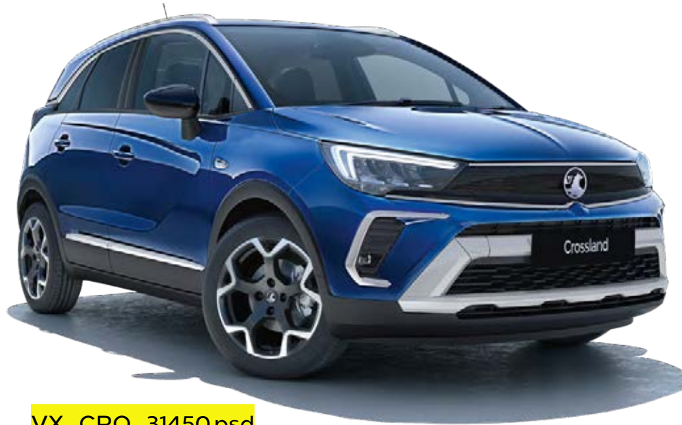
Navy Blue (G4B)* Two-coat metallic paint