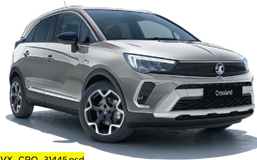
Quartz Grey (G4I)** Two-coat metallic paint £550†