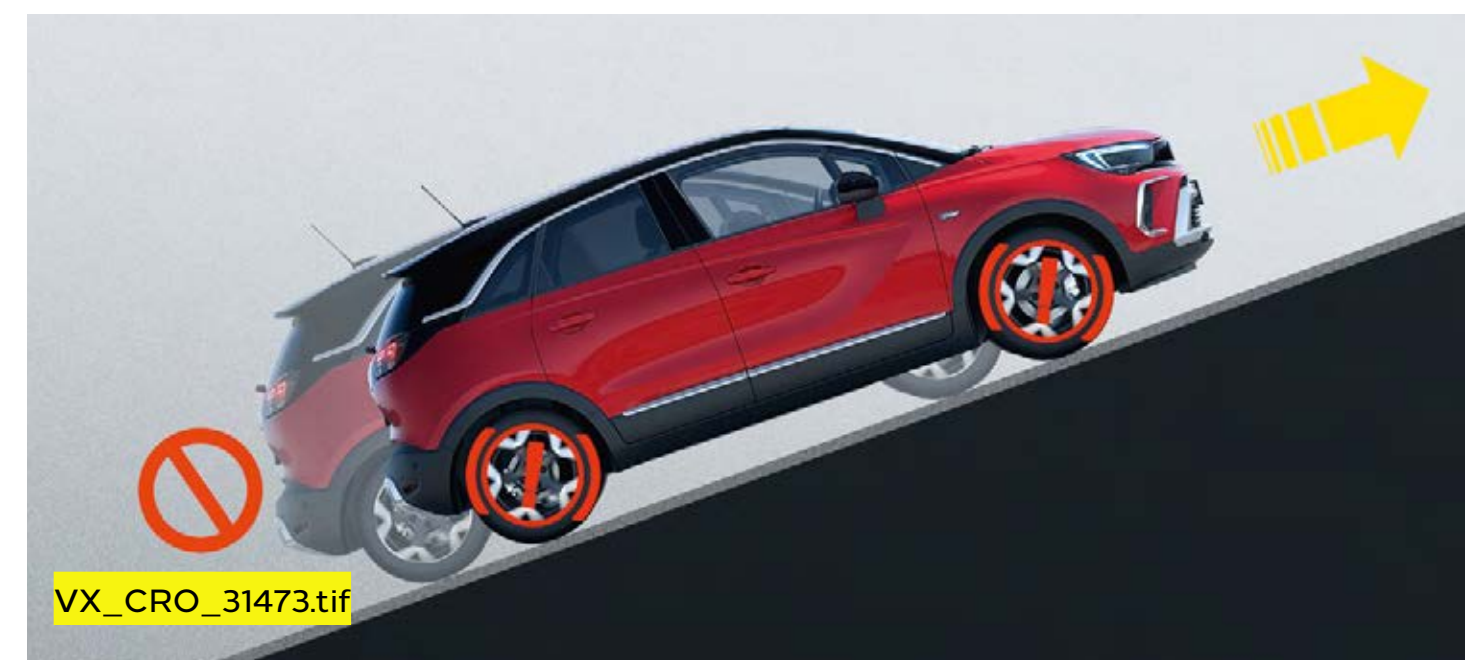
Hill start assist.