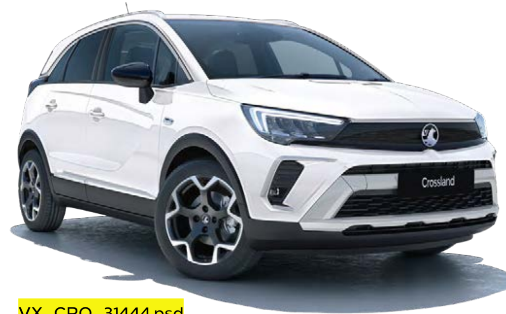
White Jade (G20)** Brilliant paint £320†