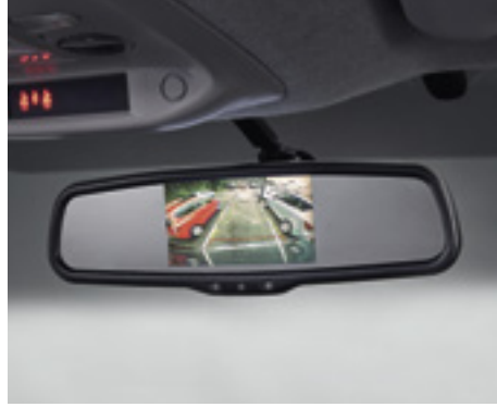
CCTV MIRROR MONITOR FOR REVERSING CAMERA.