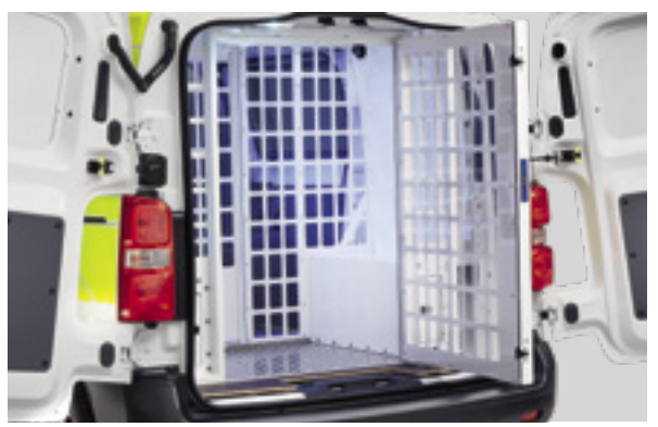
PRISON CELL REAR ACCESS.