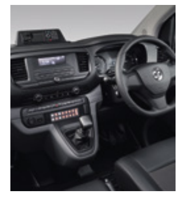
POLICE COMMUNICATIONS RADIO FASCIA AND INTEGRATED 14-WAY SWITCH PANEL.