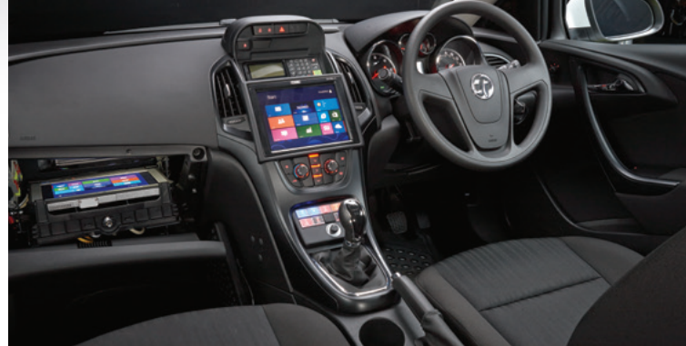
Image shown includes optional Rugged tablet, Central Repeater Screen and additional USB Keyboard.