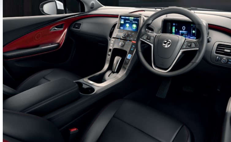
Civilian interior illustrated.