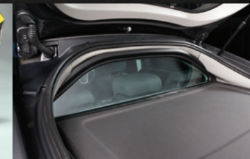
Rear upstand between passenger and rear load compartments. (Hatchback model shown)