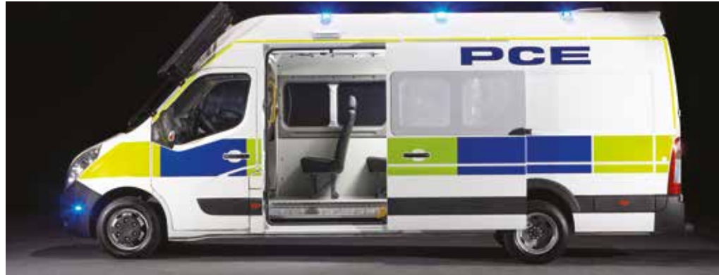
Image shown features 360° high level lighting and nearside despatch light.