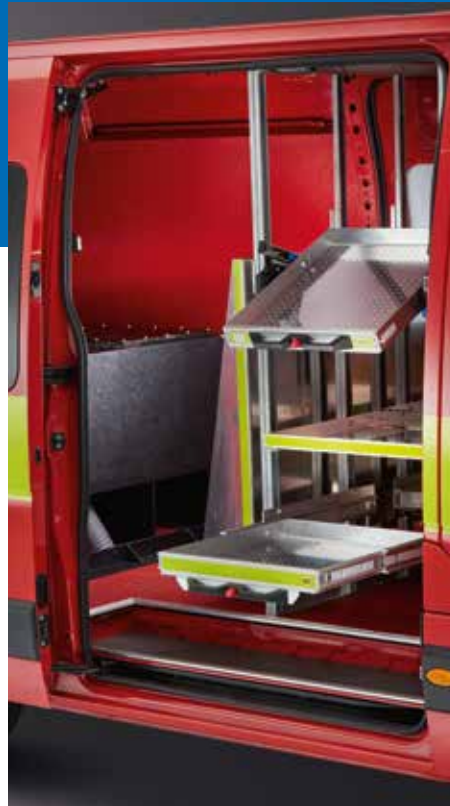
Configurable racking system.