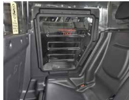
Astra police cell shown.