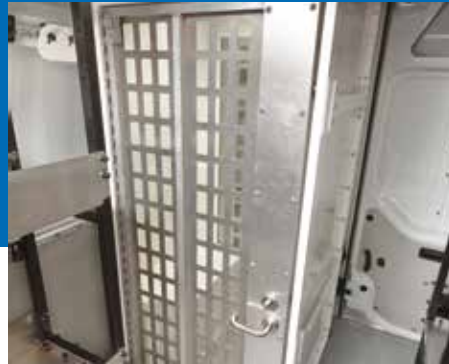
Single containment cell.