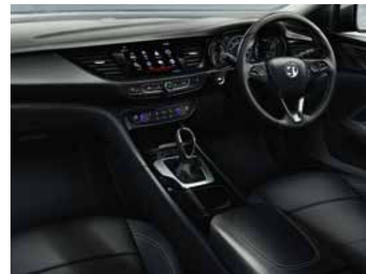
Standard interior shown.

* = Converted New Insignia based on Design trim will be available late 2017.