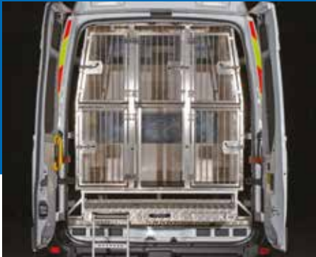
Six compartment dog cell.