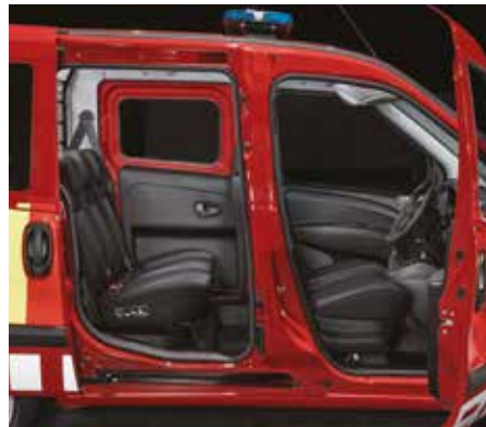
Twin glazed sliding side doors.