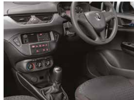
Image shown includes combined 10-way switch panel and aperture for communications head unit.