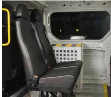
Image shown features storage box and configurable seating solution.

For engine availability, please refer to table on page 11.