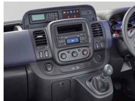
Fully integrated control panel.