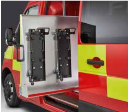
Pull-out vertical bulkhead.