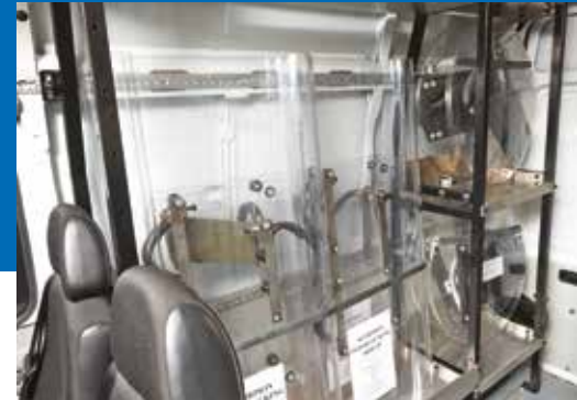
Configurable storage solution.