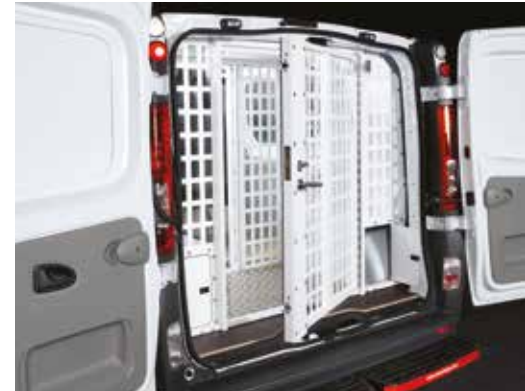
Two-person prison cell with side facing seats.