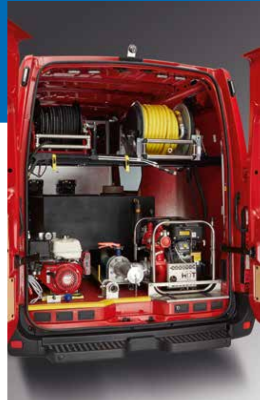
Large load area allows ample room for easy operation of equipment.