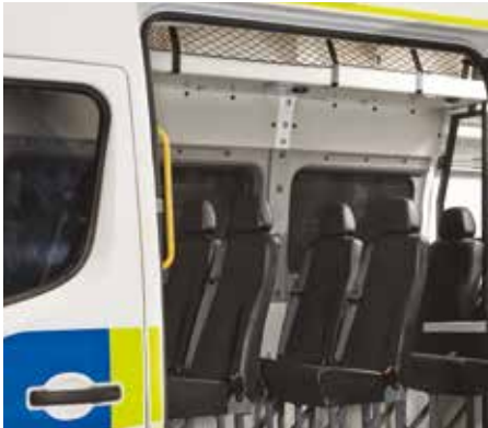
Configurable seating solution.