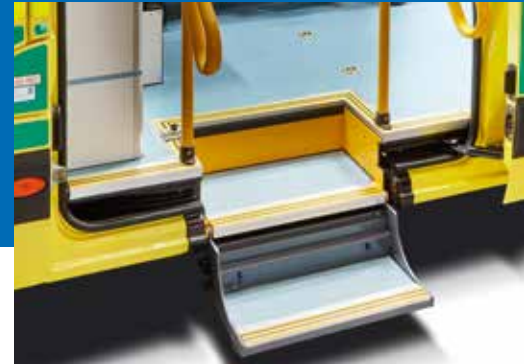
Side access fold out step.