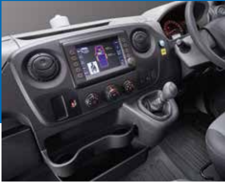
Fully integrated control panel.