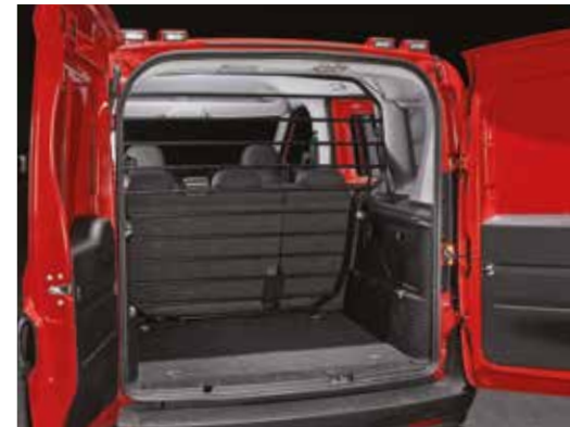
Load area with steel load guard.