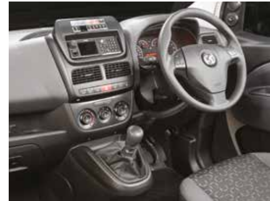
Image shown includes combined 10-way switch panel and aperture for communications head unit.